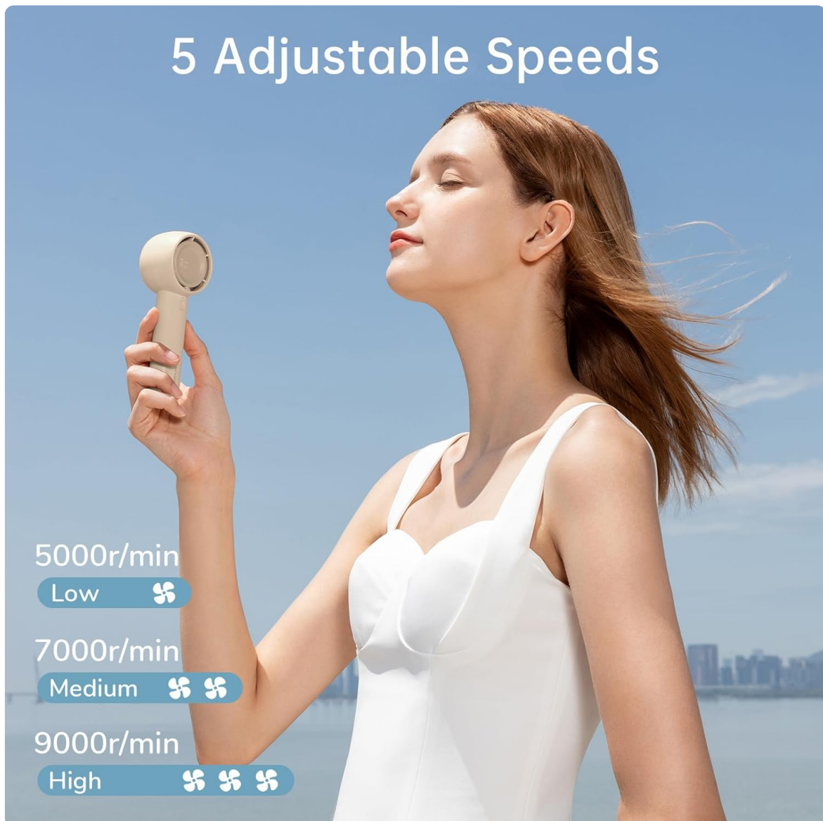
Figure 5.1: The fan offers 5 adjustable speeds, ranging from 5000r/min (Low) to 9000r/min (High).