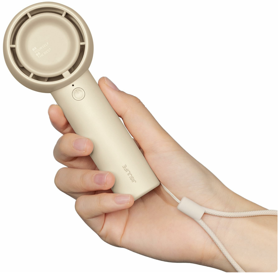
Figure 3.1: JISULIFE FA42 Mini Portable Bladeless Handheld Fan (Brown)