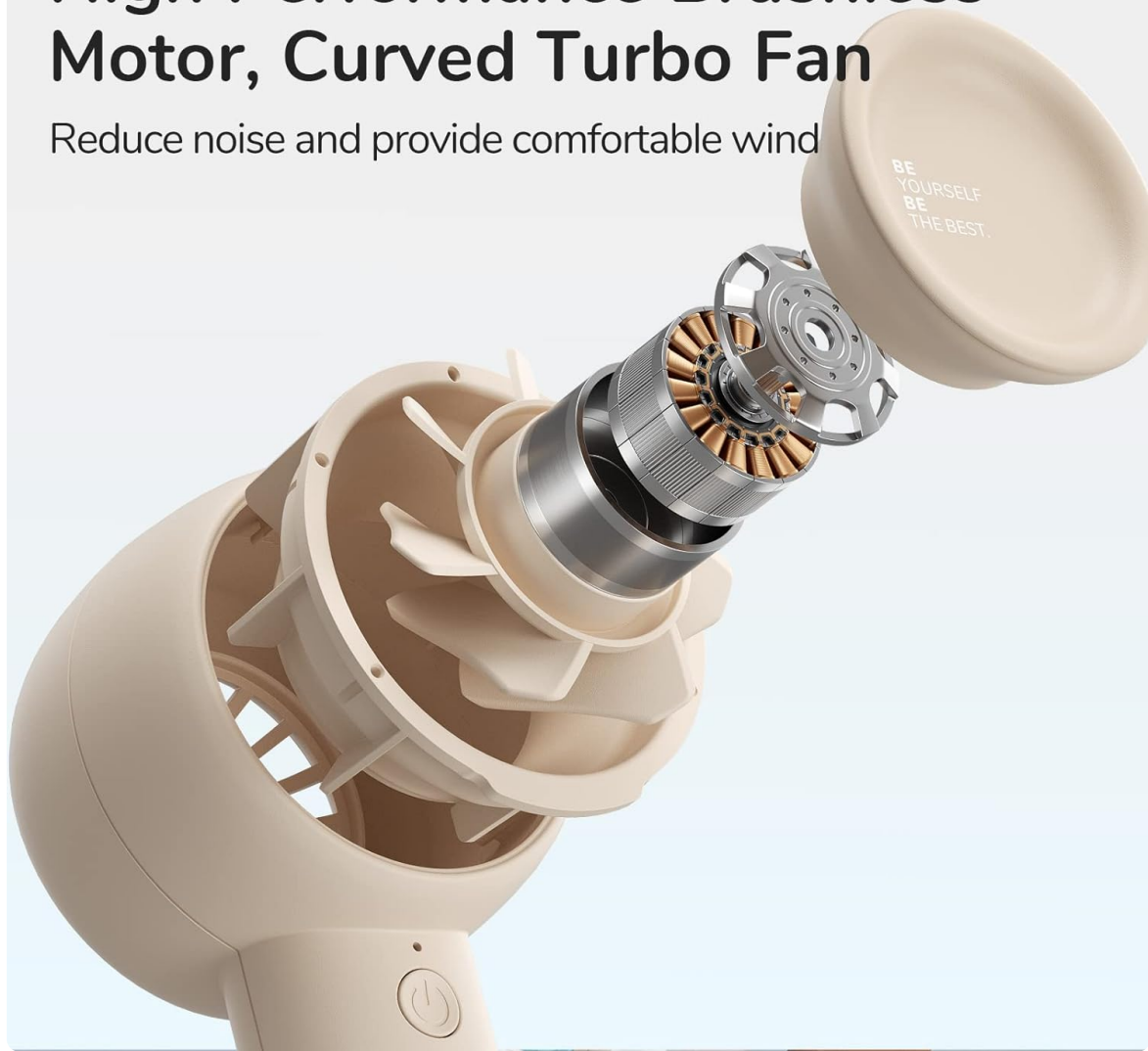
Figure 3.3: Internal view highlighting the high-performance brushless motor and curved turbo fan designed for reduced noise and comfortable airflow.

Reduce noise and provide comfortable wind