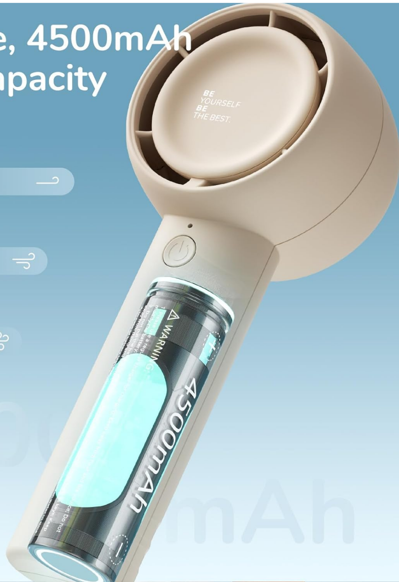
Figure 5.2: The 4500mAh battery provides up to 16 hours of 'Sleep Wind', 8.5 hours of 'Cold Wind', and 5 hours of 'Strong Wind'.