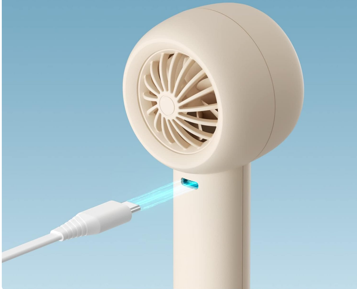
Figure 4.2: The fan's Type-C charging port in use. A full charge takes approximately 4 hours and provides up to 16 hours of cooling time.

It only takes 5-6h to fully charge, more convenience to use.