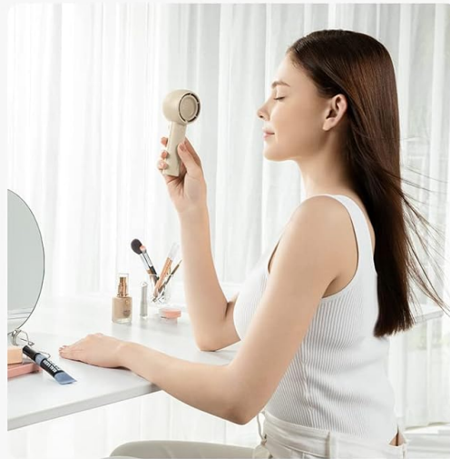
Figure 5.3: The fan is versatile for use while walking, in the office, during makeup application, and while camping.

Your browser does not support the video tag.