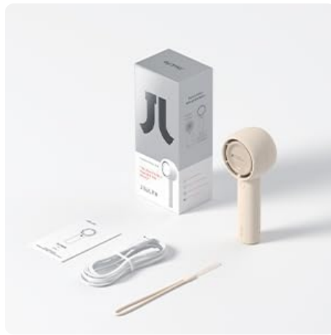
Figure 4.1: The JISULIFE FA42 fan, its packaging, USB-C charging cable, and instruction manual. Before first use, fully charge the fan. Connect the provided USB-C cable to the charging port on the fan and the other end to a USB power adapter (not included) or a computer's USB port. The indicator light will show charging status.