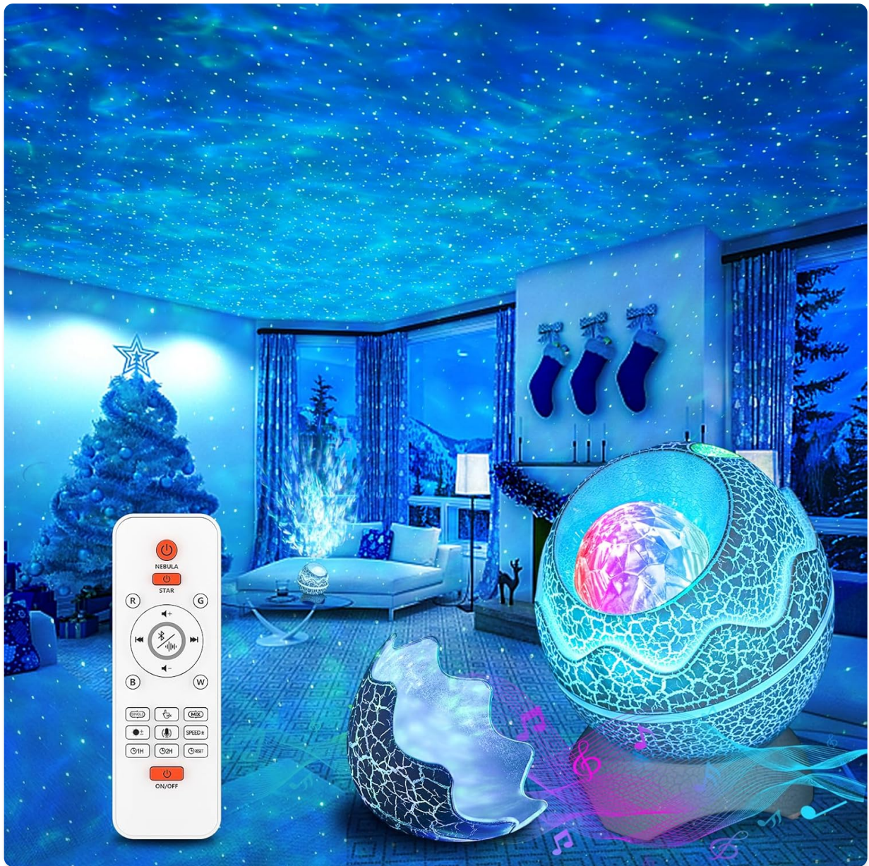
Image: The Rossetta Galaxy Projector, Star Projector 2.0, showcasing its unique dinosaur egg design and vibrant light projections.