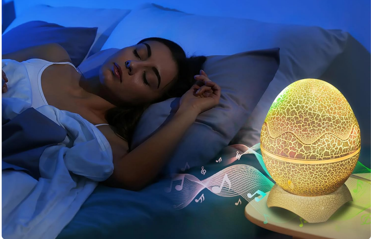
Image: A graphic illustrating the 10 white noise sounds available on the Rossetta Galaxy Projector, including soothing music, white noise, brook, ocean wave, thunder, heavy rain, summer night, and dinosaur sounds.

Soothing music White noise Brook Ocean wave Thunder Heavy rain Summer night Dinosaur