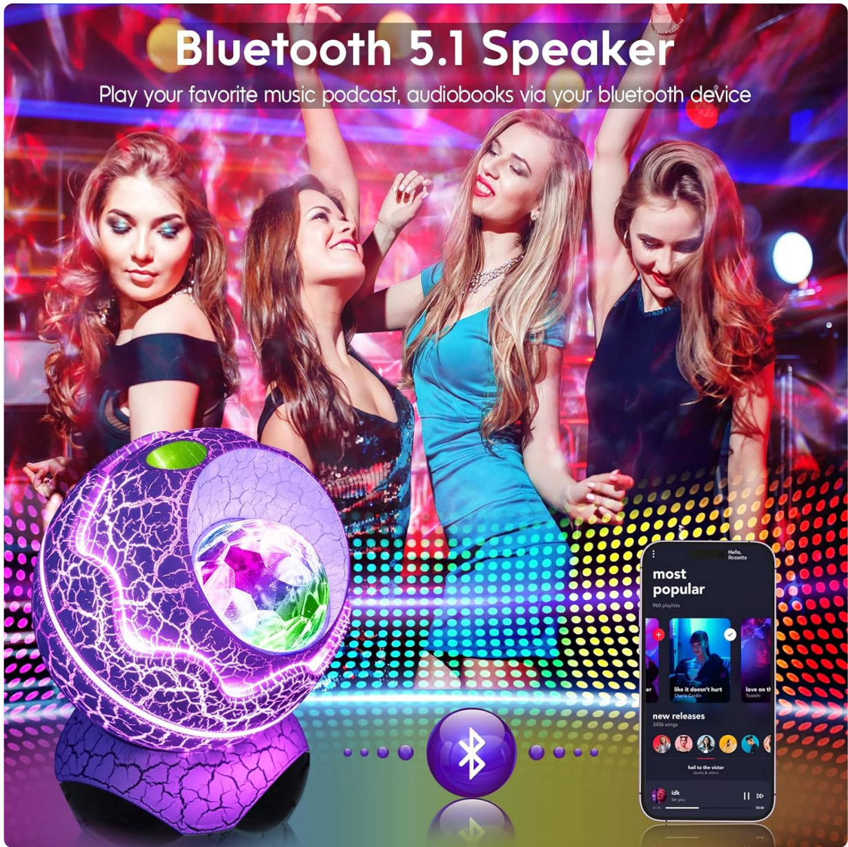
Image: The Rossetta Galaxy Projector highlighting its Bluetooth 5.1 speaker capability, with a smartphone displaying a music app.

Connect your device via Bluetooth 5.1 to play music through the projector. The lights can synchronize with the music for an immersive experience.