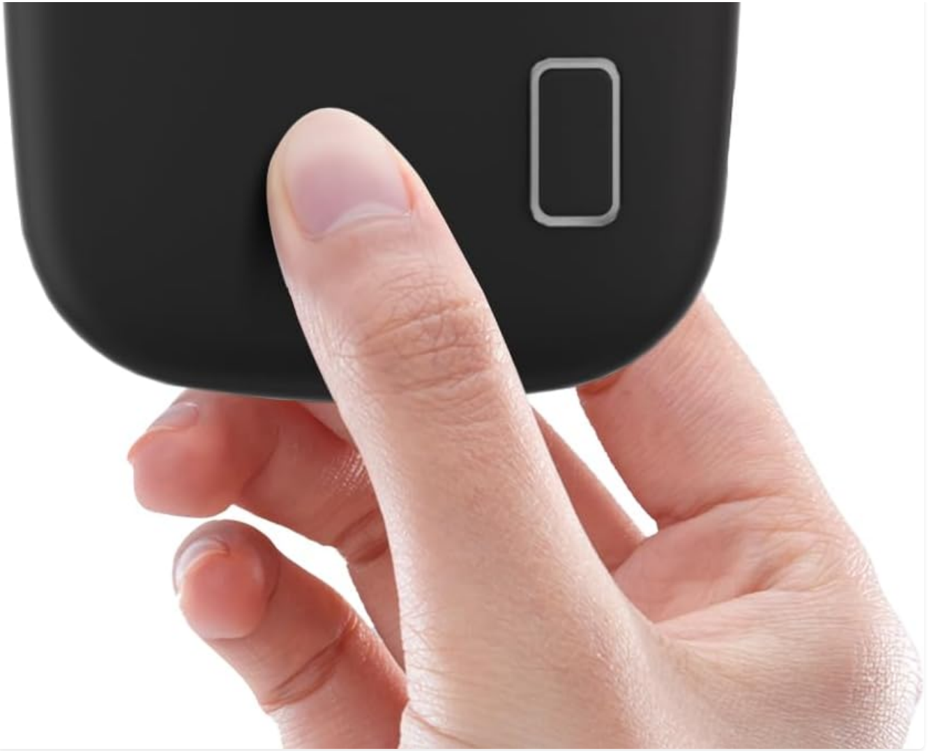
The Aluan Handheld Mini Fan, compact and ready for use.