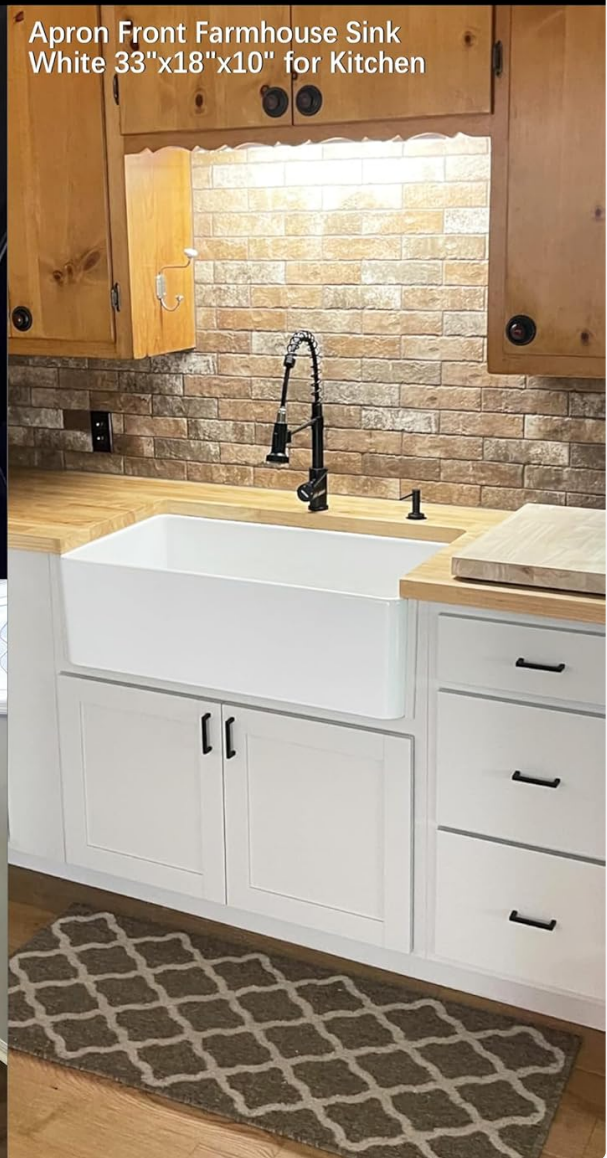
Apron Front Farmhouse Sink White 33"x18"x10" for Kitchen