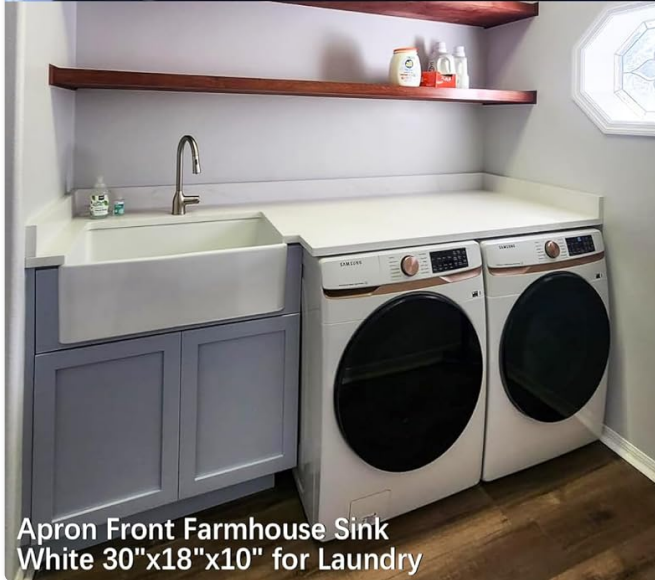
Apron Front Farmhouse Sink White 30"x18"x10" for Laundry