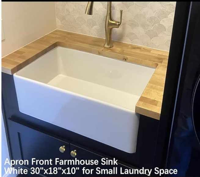
Apron Front Farmhouse Sink White 30"x18"x10" for Small Laundry Space