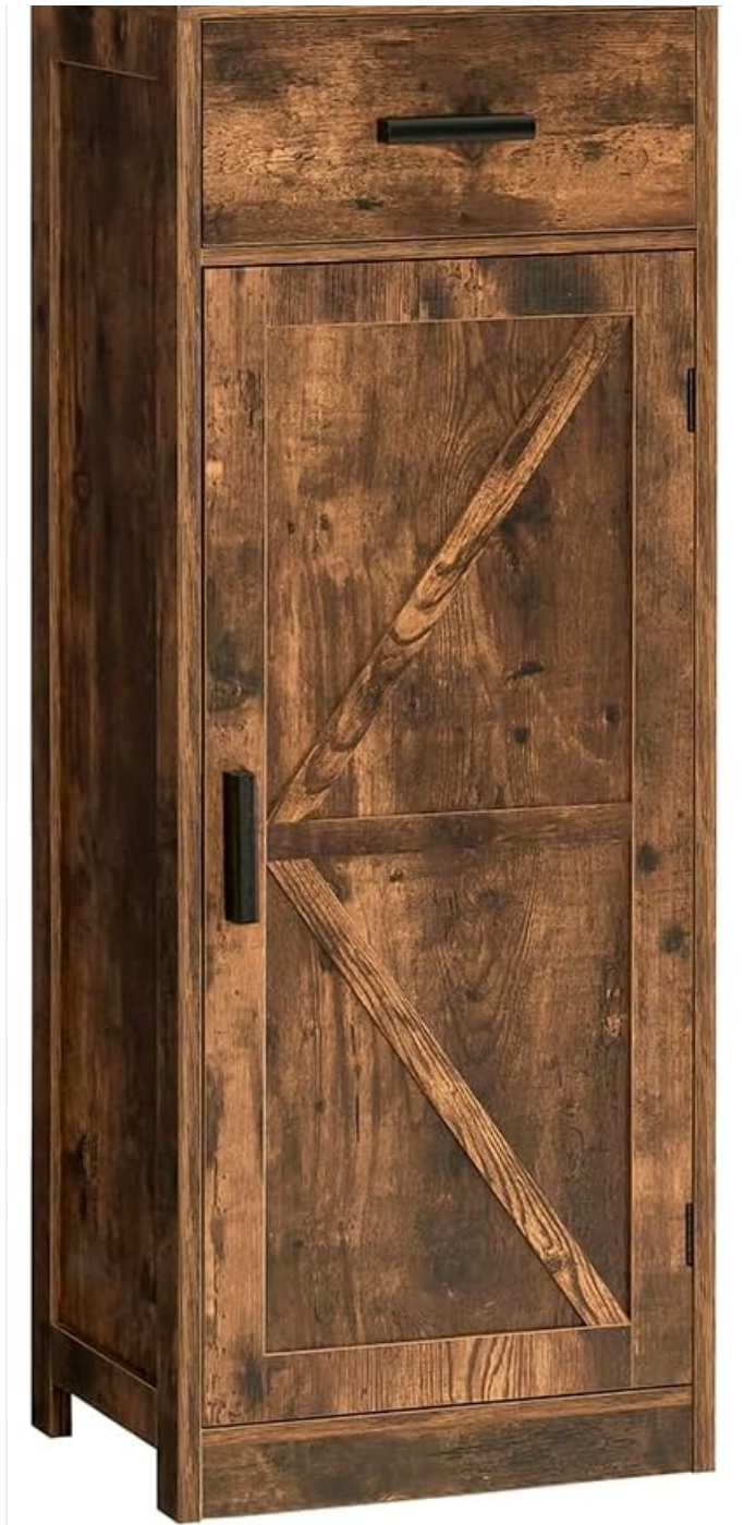
Figure 1: Front view of the WEENFON Tall Storage Cabinet in Rustic Brown.