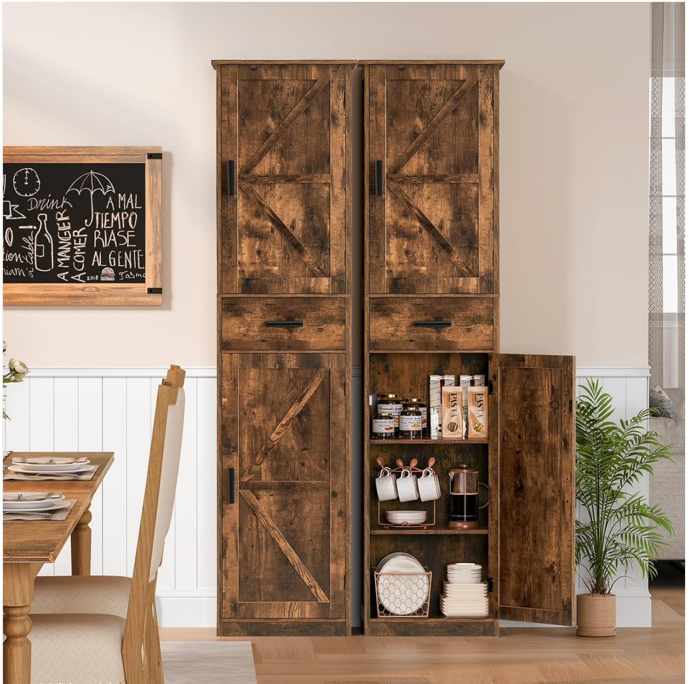
Figure 4: Cabinet used in a kitchen, demonstrating its storage capacity for pantry items.