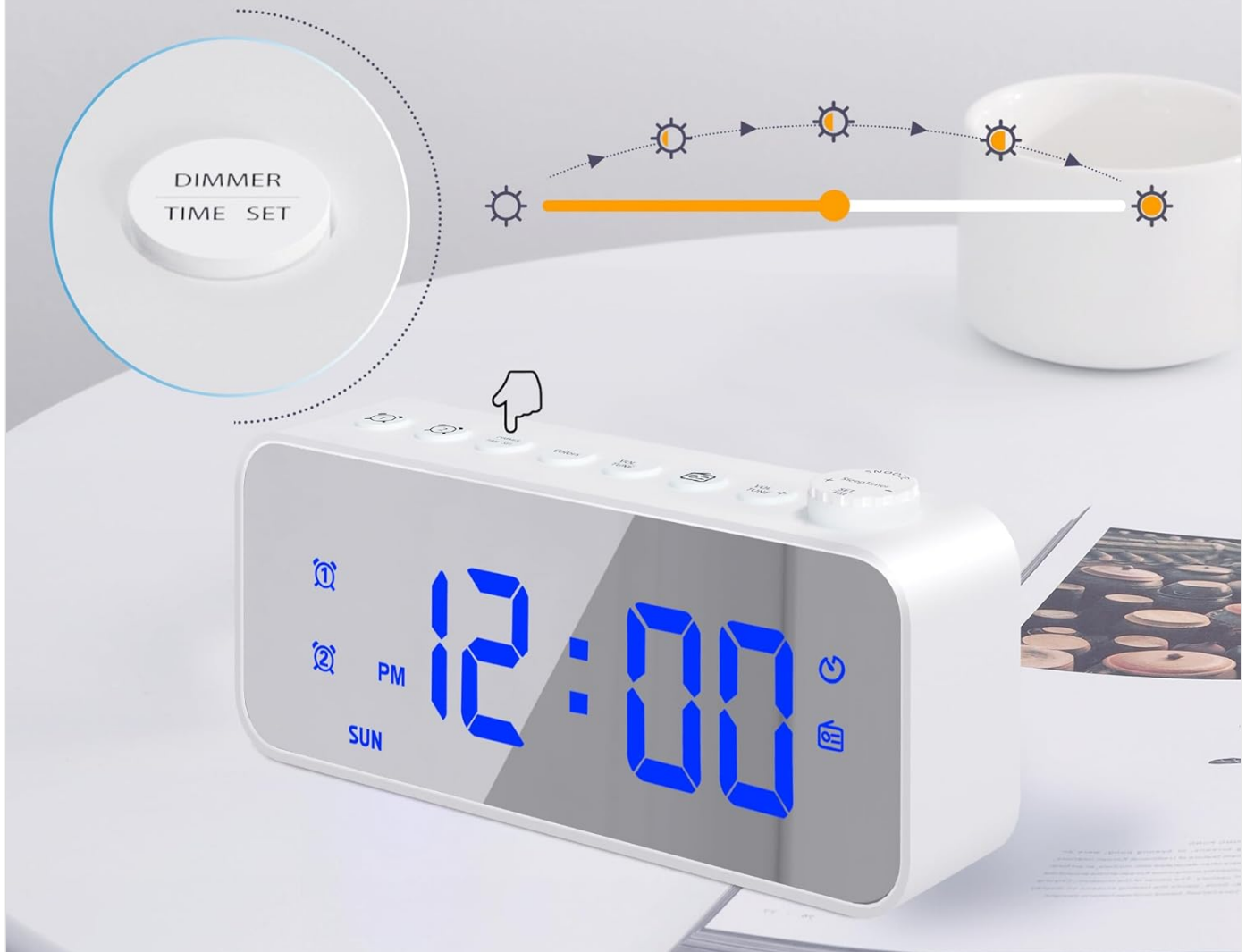
Figure 5: Brightness adjustment feature, detailing 5 levels of screen brightness from 0% (off) to 100% for optimal visibility in any lighting condition.

It can be adjusted from 0 to 100% , and the lowest level can completely turn off screen display.