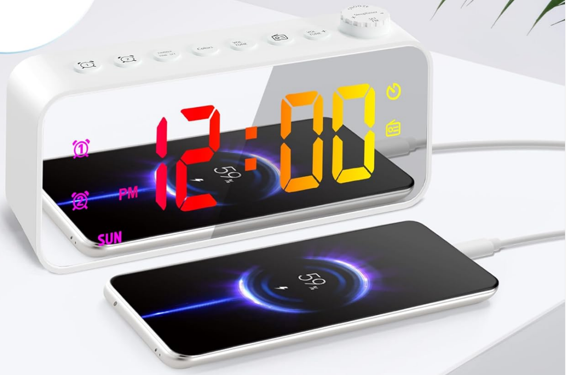
Figure 7: USB Charging Port, indicating its location and function for charging various electronic devices with a 5V output.