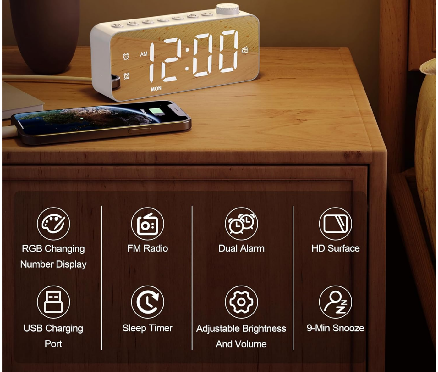
Figure 2: Function introduction diagram, illustrating the main features such as RGB changing number display, FM radio, dual alarm, HD mirror surface, USB charging port, sleep timer, adjustable brightness and volume, and 9-minute snooze.