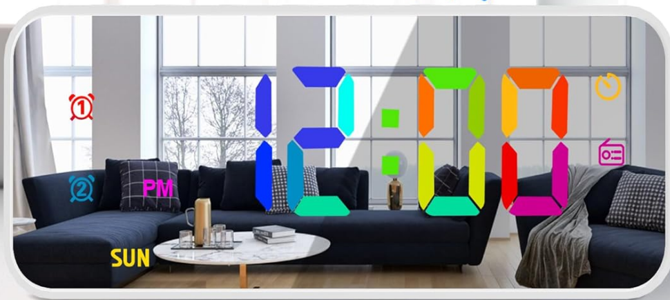
Figure 3: Dual Alarm functionality, showing options for 8 wake-up sounds, 16 volume levels, 9-minute snooze, and flexible alarm modes (weekend/weekday/7-day).