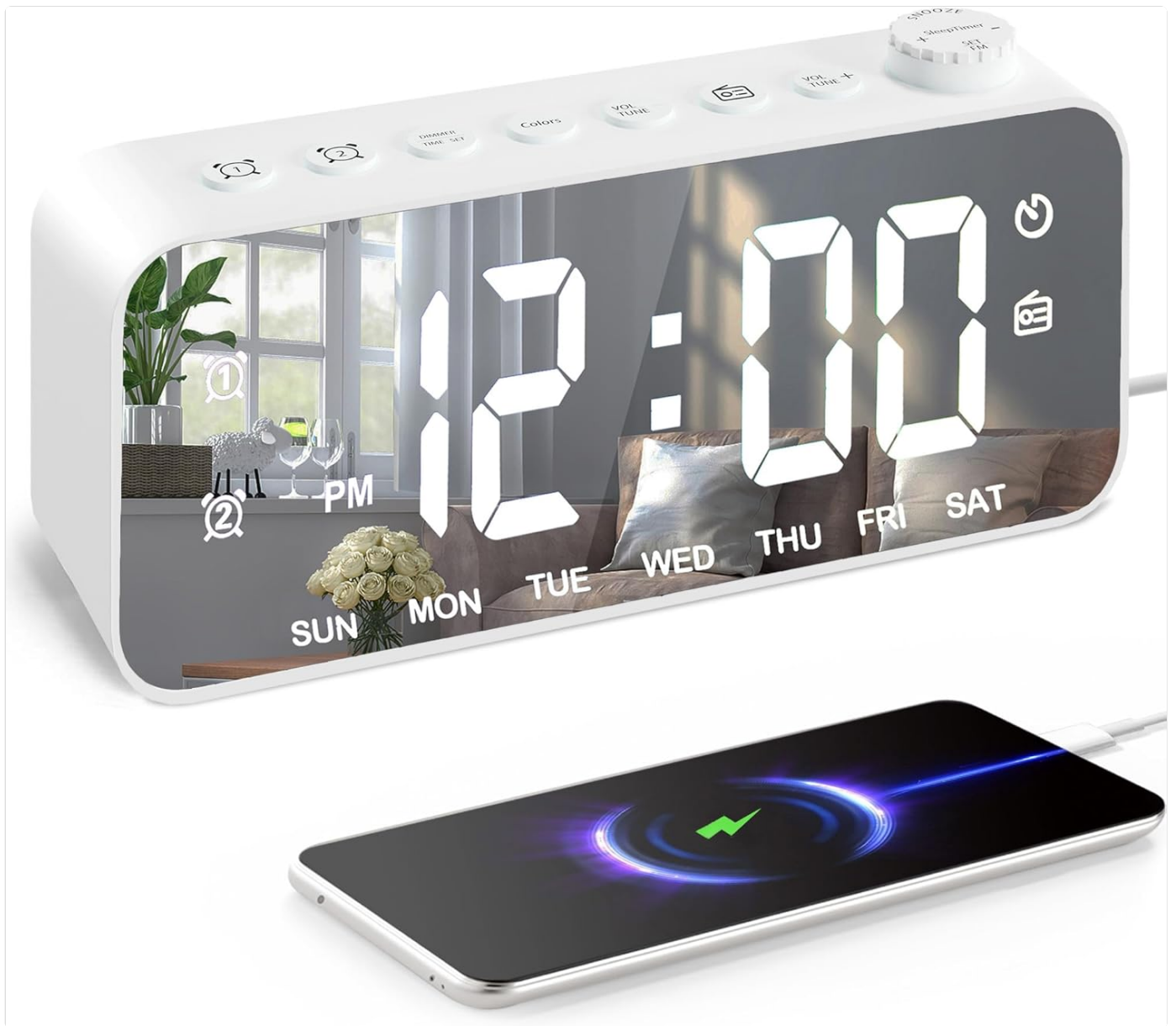
Figure 1: Front view of the JALL Colorful Digital Alarm Clock Radio, highlighting its mirror surface and large digital time display. A smartphone is shown charging via its USB port.