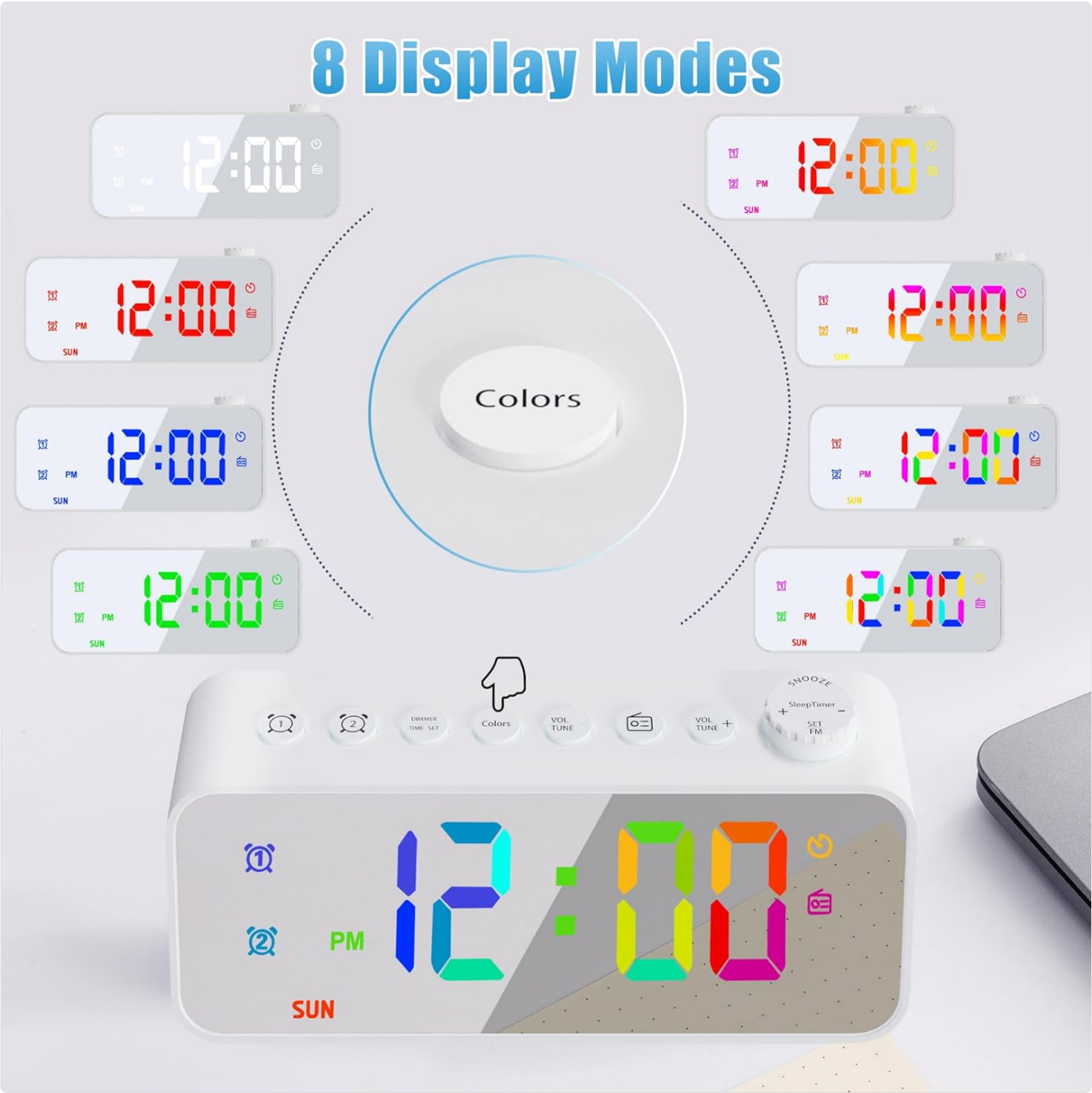
Figure 4: Eight distinct display color modes available on the JALL alarm clock, offering various aesthetic options from solid colors to dynamic gradients.

The clock offers 8 display modes and 5 levels of screen brightness.