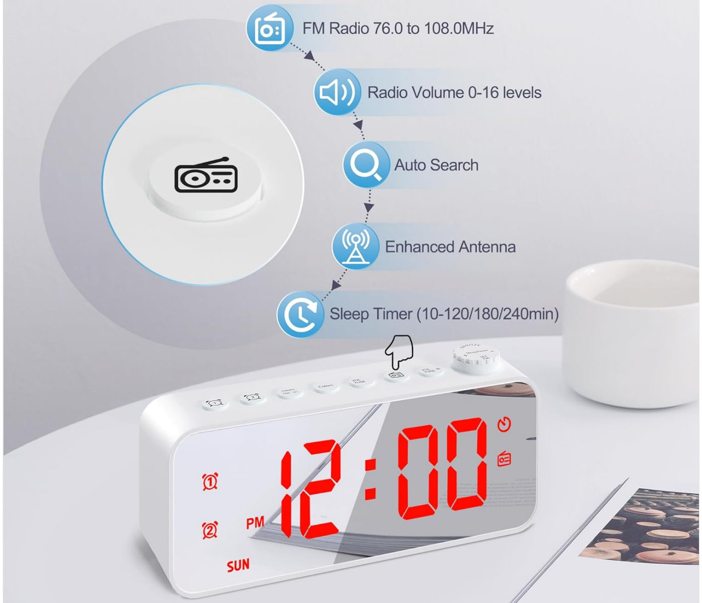
Figure 6: FM Radio and Sleep Timer features, detailing the frequency range, volume control, auto-search function, enhanced antenna, and various sleep timer durations.