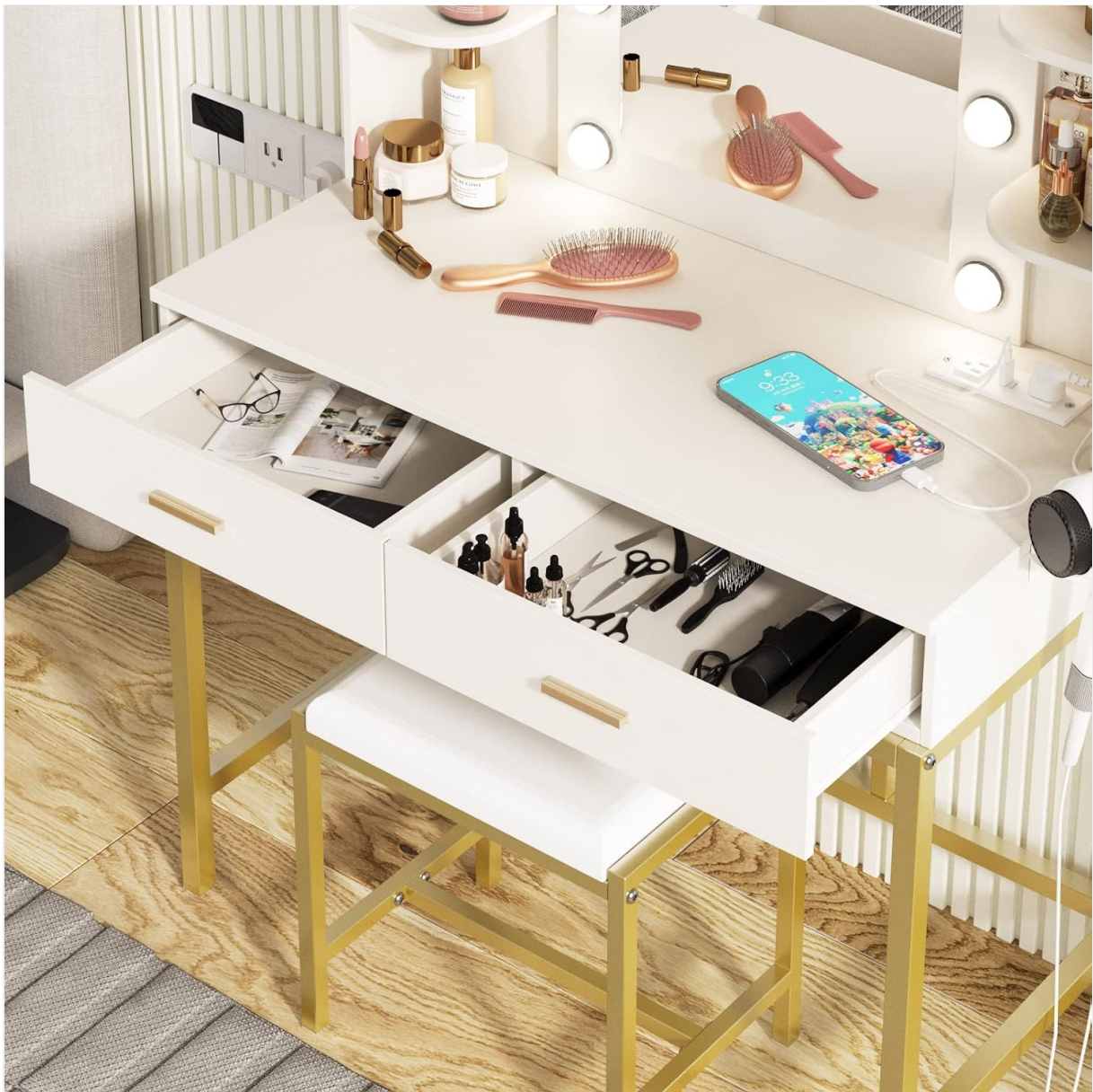
Image: The vanity desk with its two large drawers open, revealing organized compartments for various makeup items and accessories.