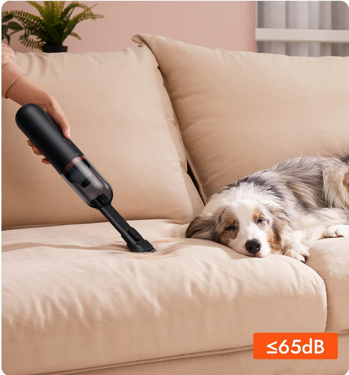
Figure 5.1: Vacuuming a couch with the Baseus A2 Pro, highlighting its low noise level.