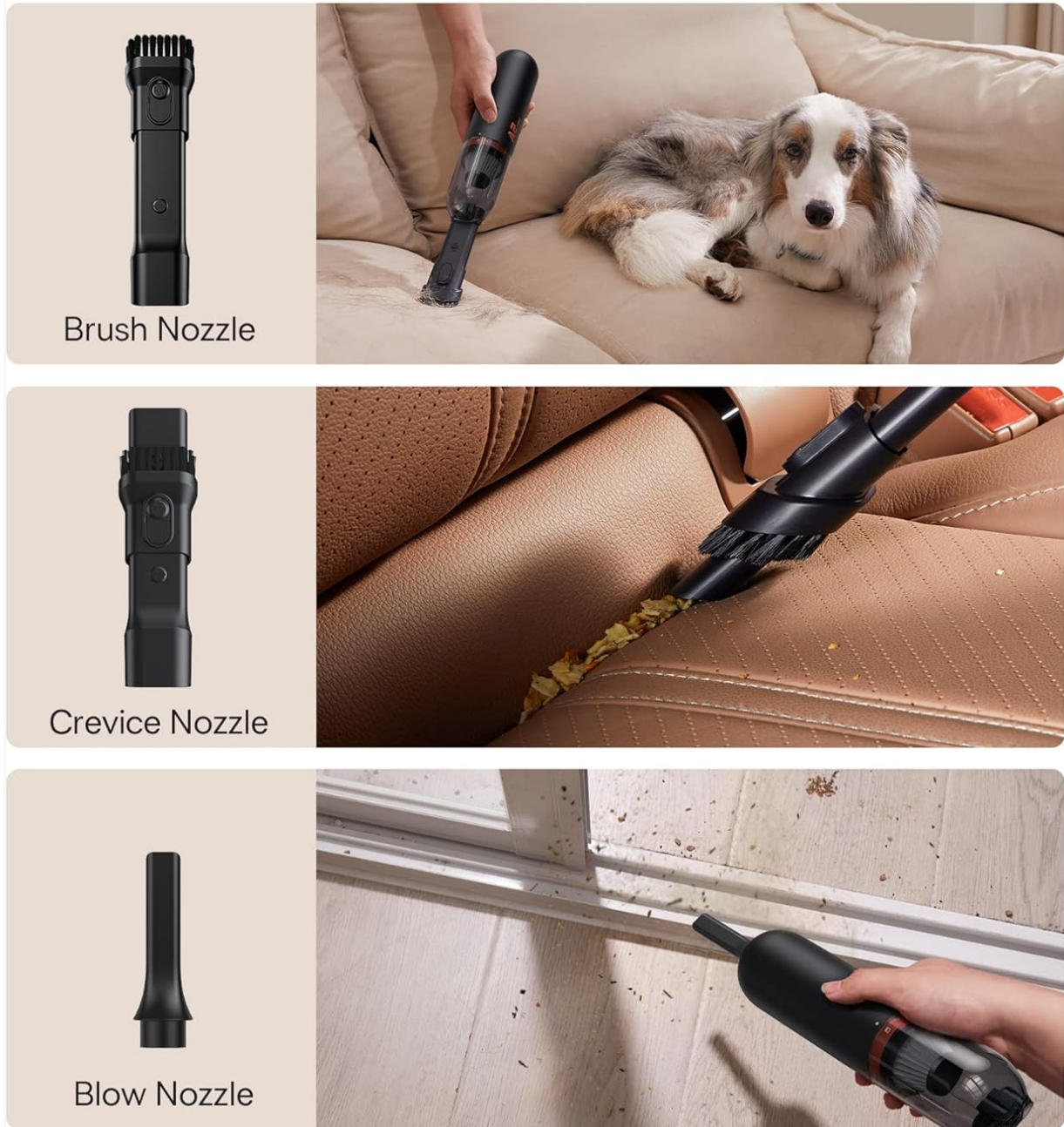
Figure 3.1: Close-up of the versatile 2-in-1 nozzle and the blower nozzle.