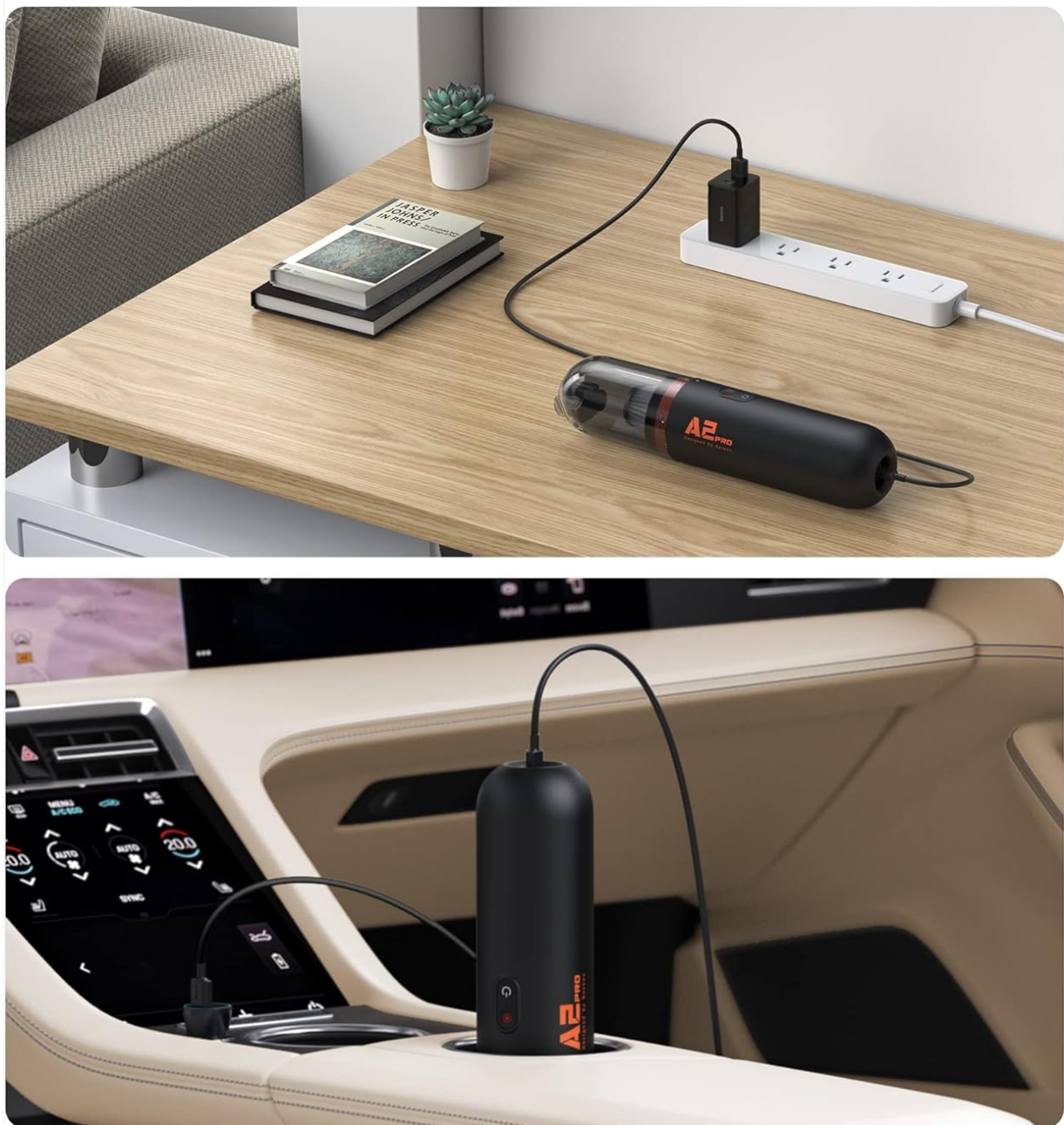
Figure 4.1: Charging the Baseus A2 Pro in different environments.

Fully recharges in 3 hours with the type-C port