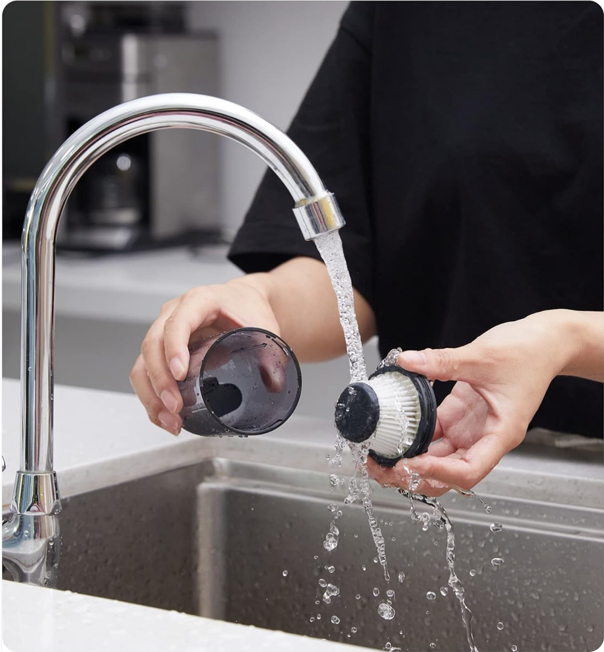
Figure 6.1: Cleaning the washable HEPA filter.