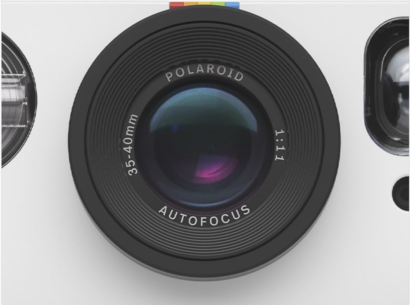
Figure 4: The dual-lens autofocus system ensures clarity in your photos.

Automatically chooses which lens is right for the shot.