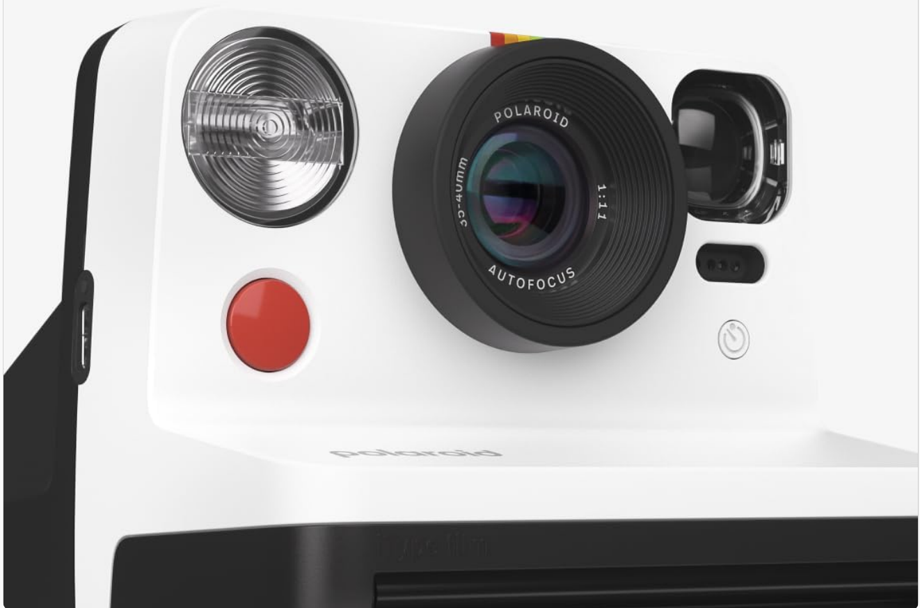
Figure 2: The camera features a built-in USB-C rechargeable battery.

Shoots 15 film packs with a single charge.