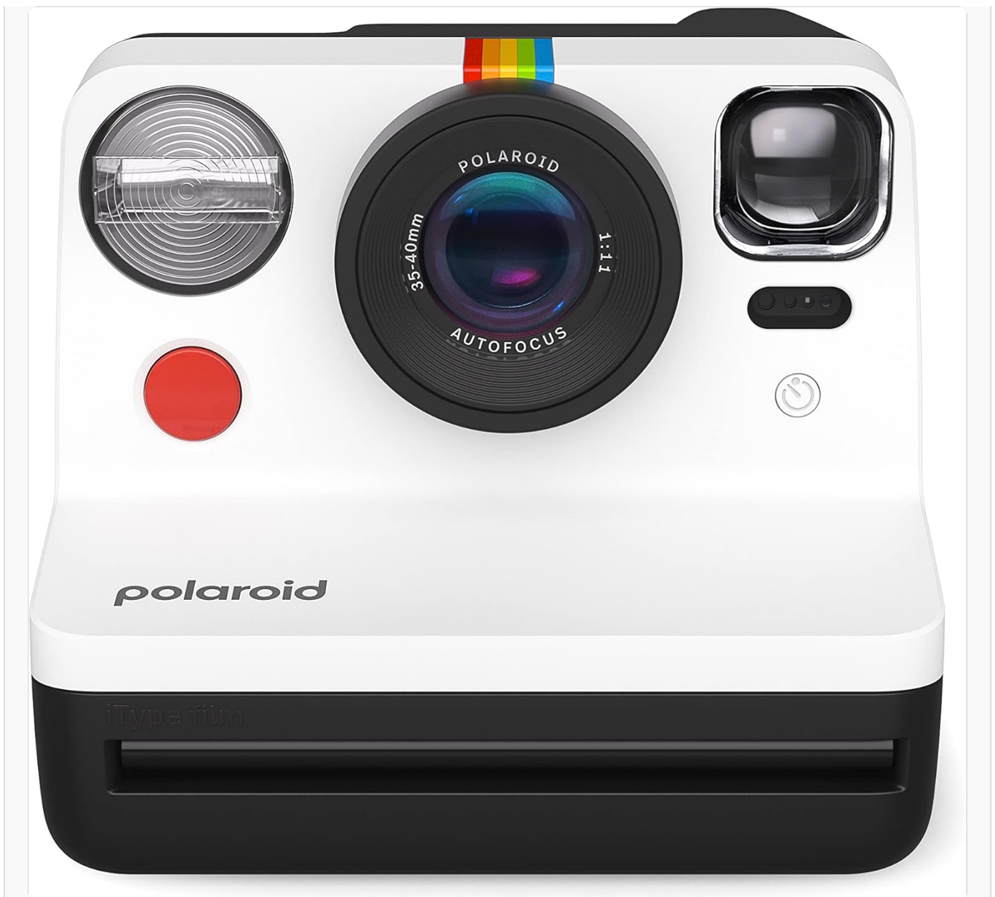
Figure 1: Front view of the Polaroid Now 2nd Generation I-Type Instant Film Camera.