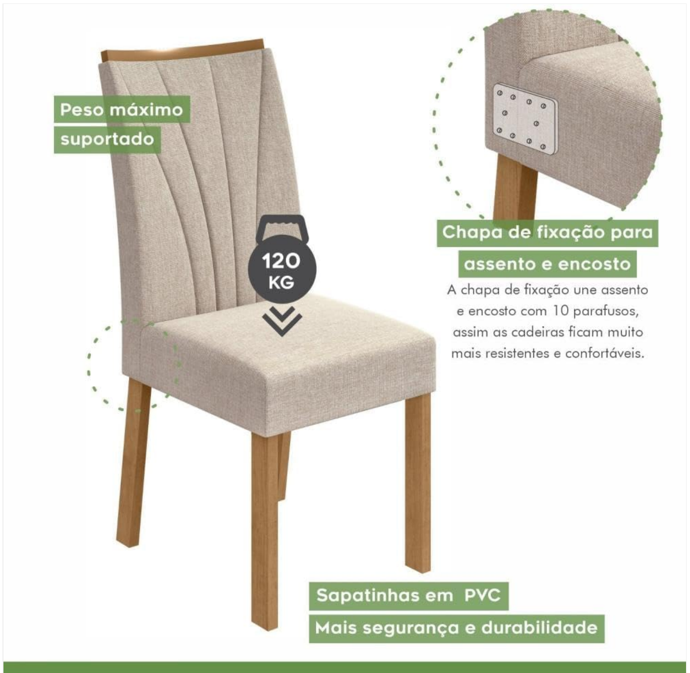
Image 5: Detailed view highlighting the 120 kg maximum supported weight, the robust fixation plate connecting the seat and backrest with 10 screws for strength, and PVC feet for enhanced safety and durability.