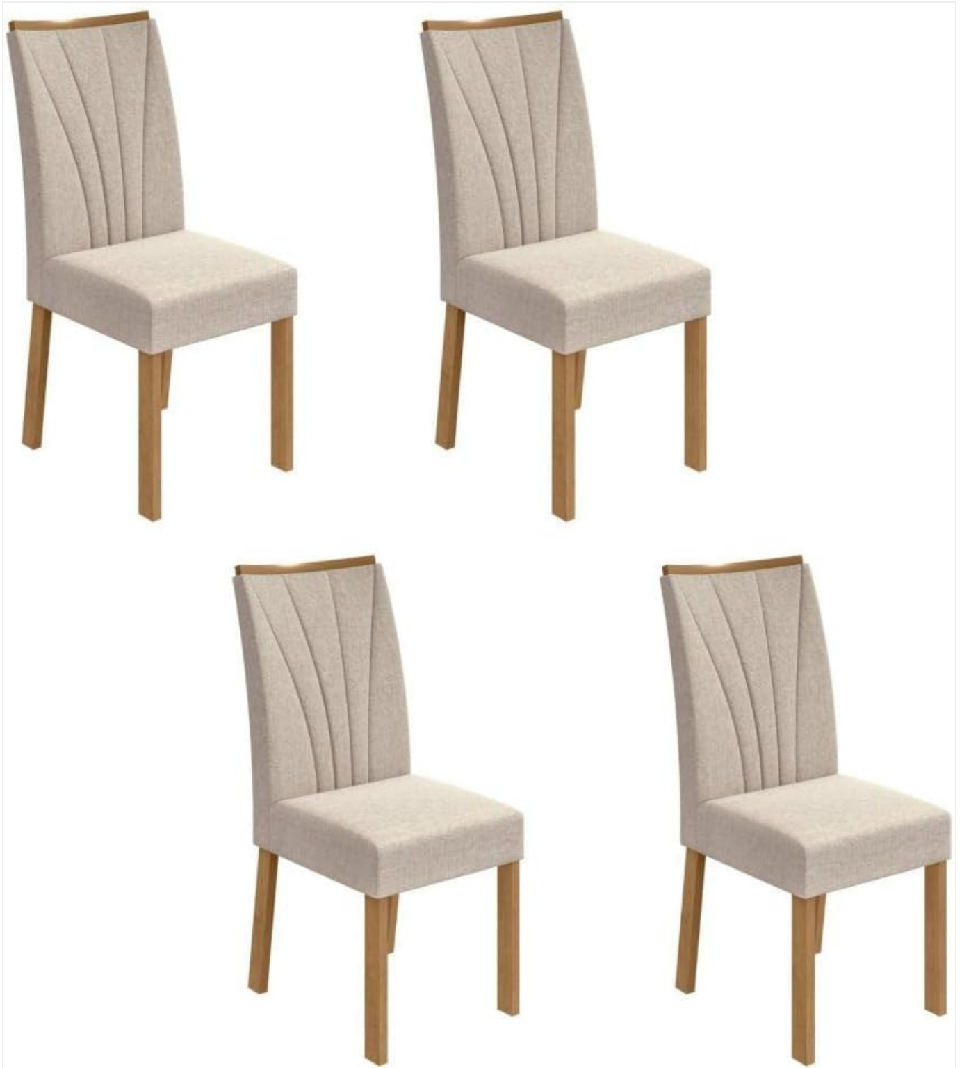
Image 1: A set of four Moveis Lopas Apogeu upholstered dining chairs, showcasing their beige fabric and wooden legs.