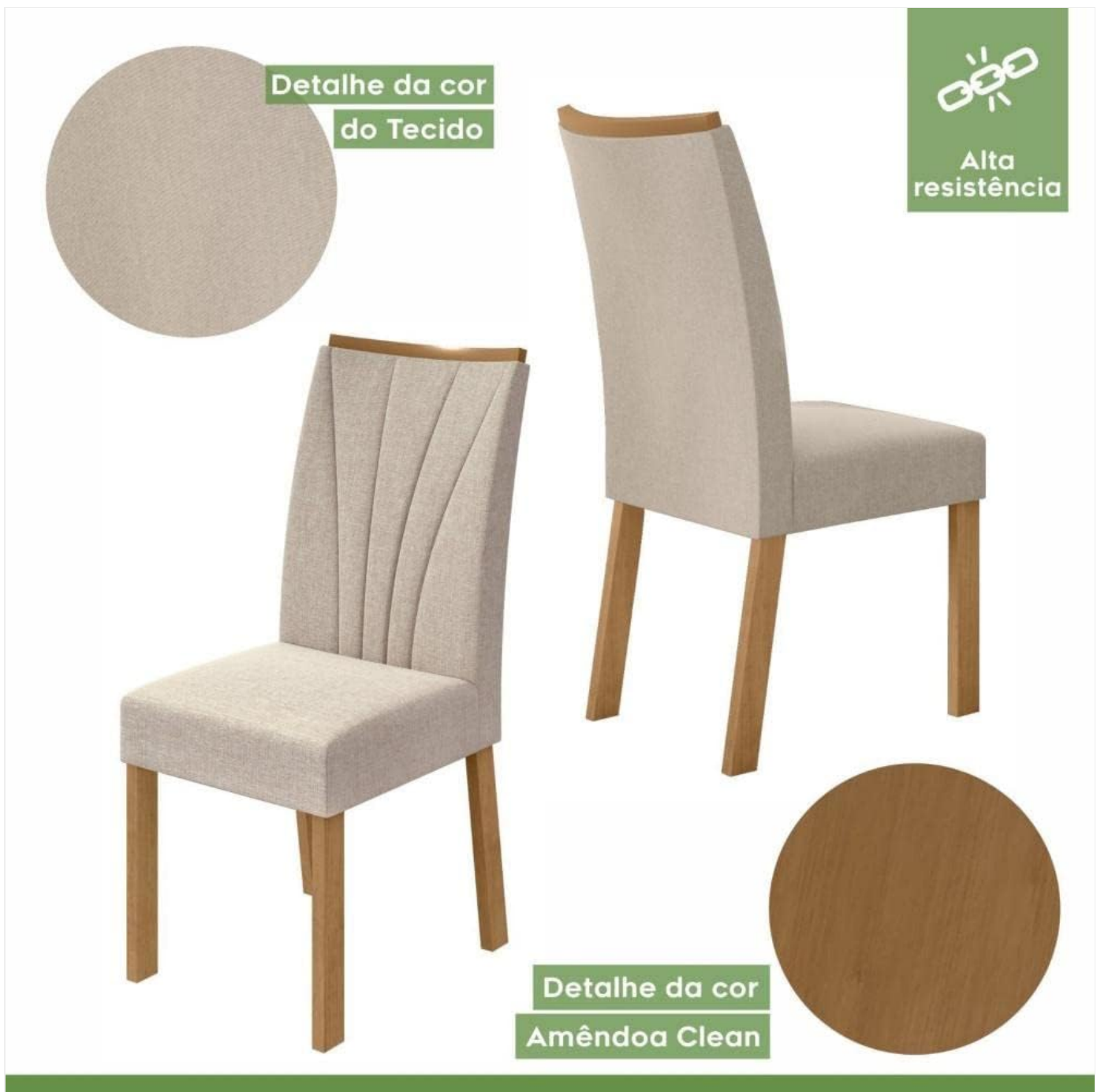
Image 2: Close-up details of the chair's beige fabric and the Amêndoa Clean wood finish, highlighting material quality.