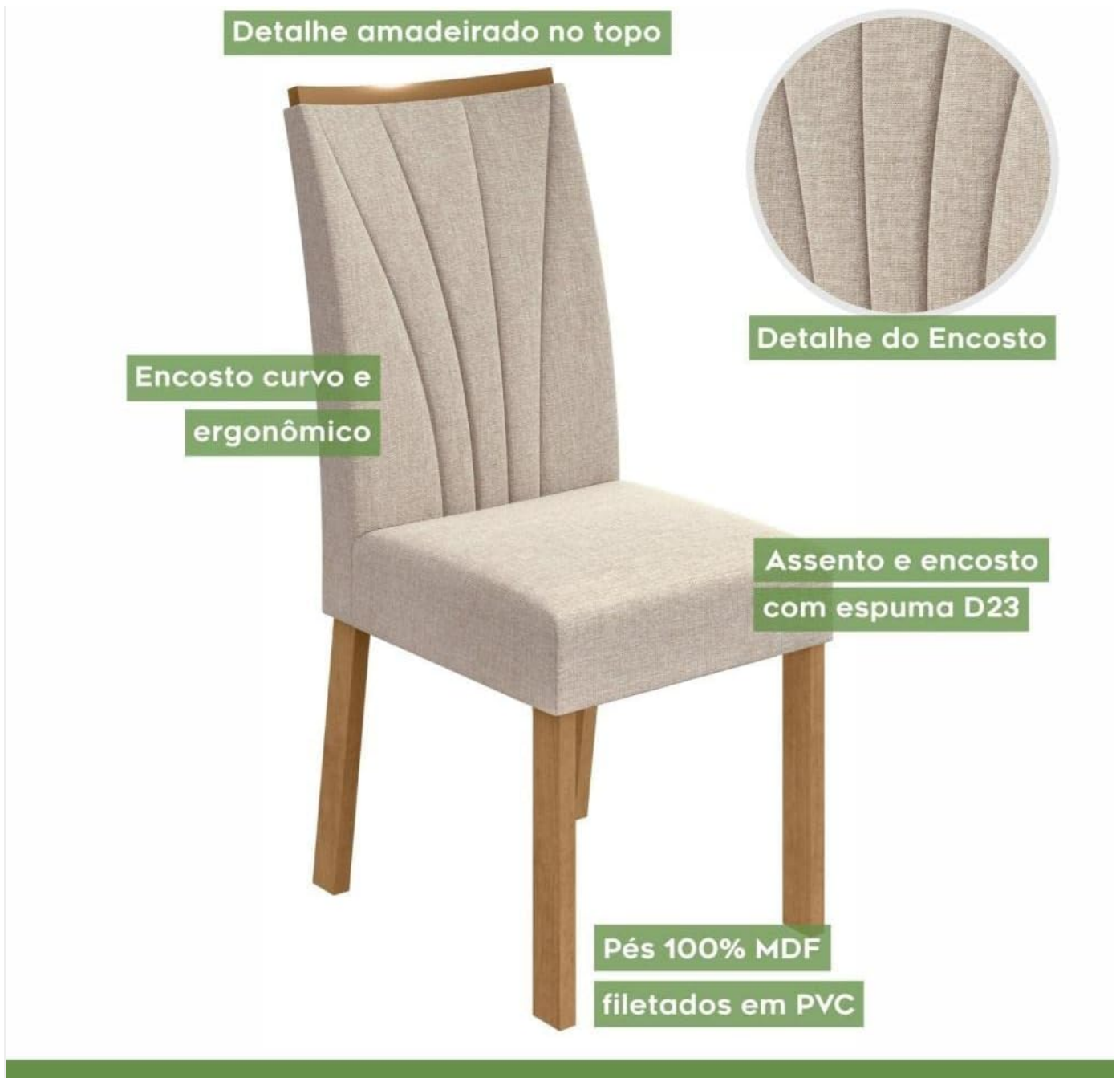
Image 6: Features of the chair including the curved and ergonomic backrest, seat and backrest with D23 foam, and 100% MDF feet with PVC finish.