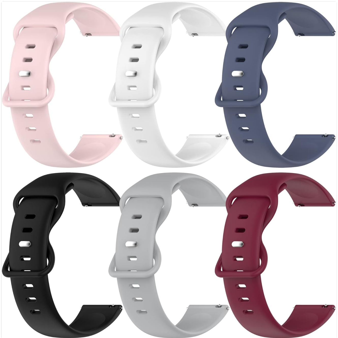
Figure 1: Assortment of NineHorse Smart Watch Bands.