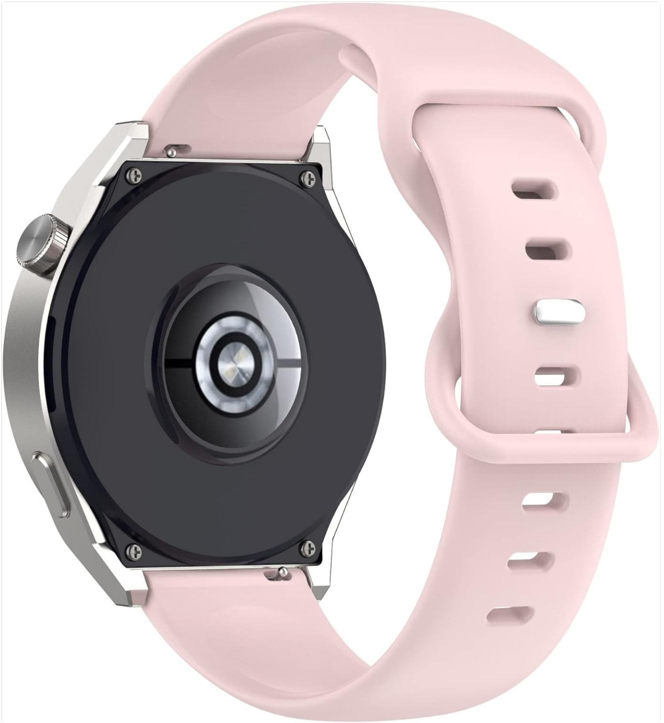
Figure 2: View of the quick-release pin attachment point on the watch back.