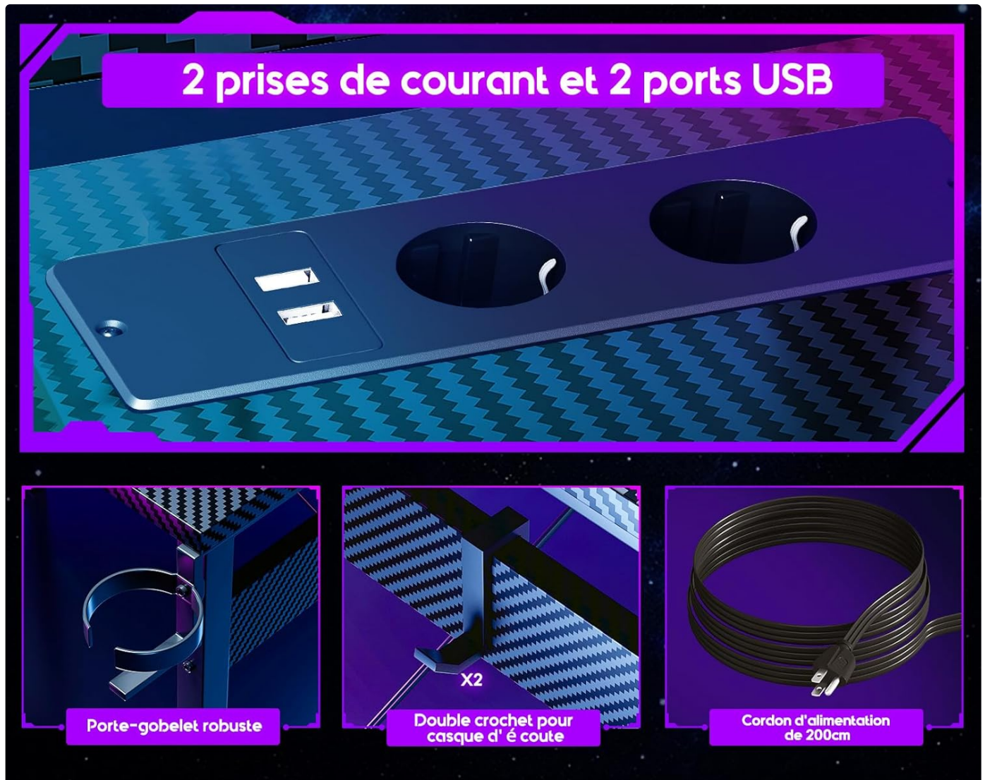
Image: A detailed view of the integrated power strip on the ODK Gaming Desk, featuring two AC power outlets and two USB charging ports.