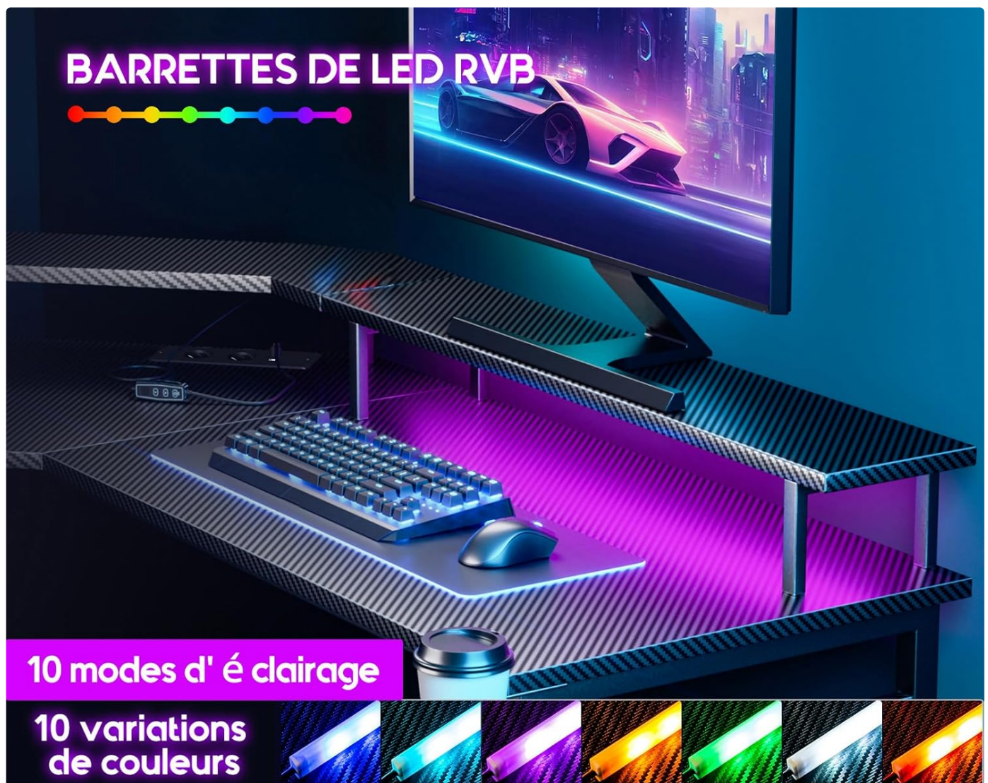
Image: The ODK Gaming Desk with its LED lighting system active, showing various color options illuminating the workspace.