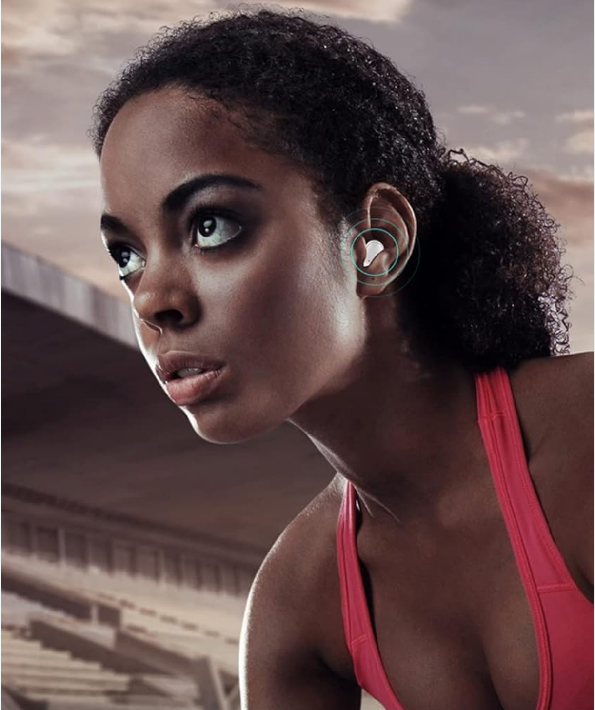
Image: A woman wearing the earbuds during a sports activity, demonstrating their comfortable and secure fit for active

Ergonomically fits the ear canal deeply to make the ear more comfortable Prevent fall