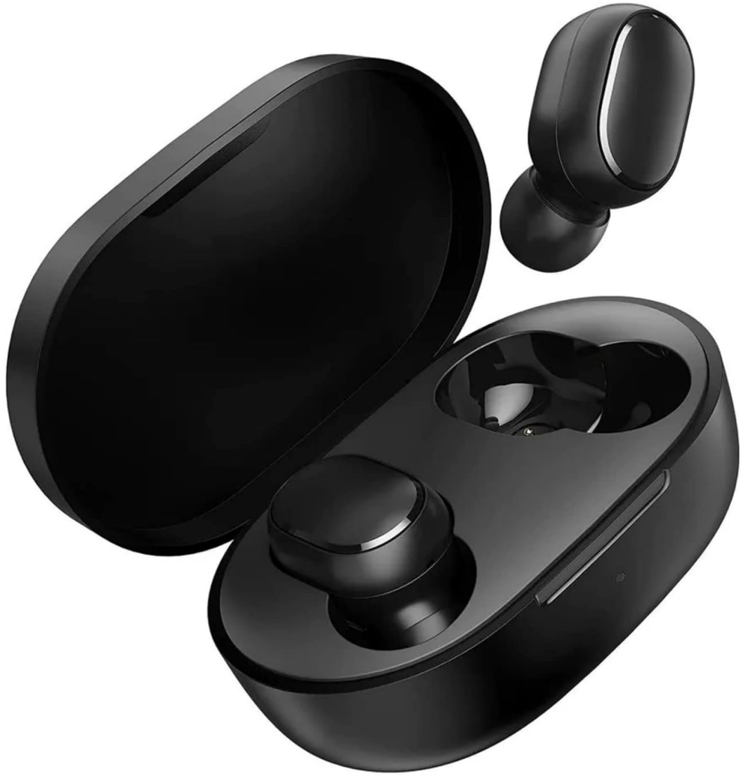
Image: VEHOP Buds Mini TWS Earbuds shown with their charging case, illustrating their compact design.