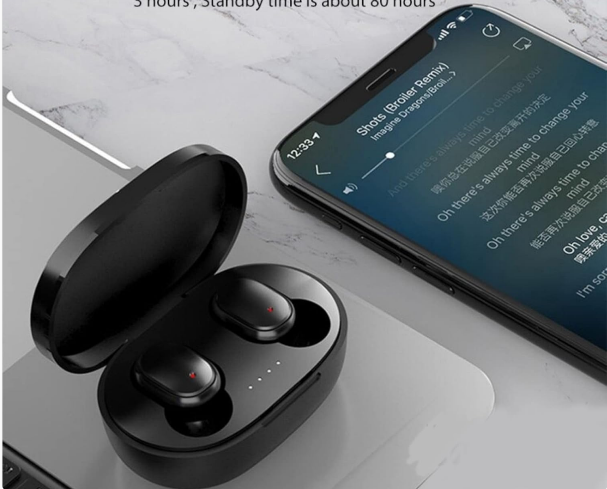
Image: Earbuds resting in their charging case next to a smartphone playing music, illustrating the long-lasting lithium battery and extended usage.

45mAh high active lithium battery for sustainable use About 3 hours , Standby time is about 80 hours