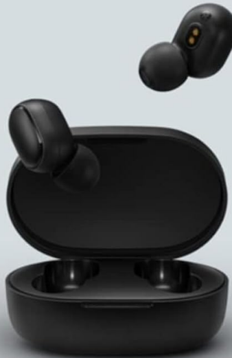
Image: An overview highlighting key features such as 12-hour music playback, sleek design, IPX4 rating, Bluetooth 5.2, DSP Environmental Noise Cancellation, and ultra-lightweight construction.