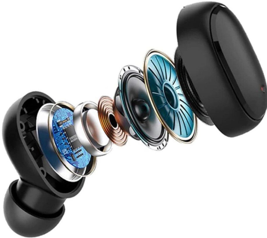
Image: An exploded diagram showcasing the internal components of an earbud, emphasizing its HiFi sound quality design.

Born for quality, you can hear where you go