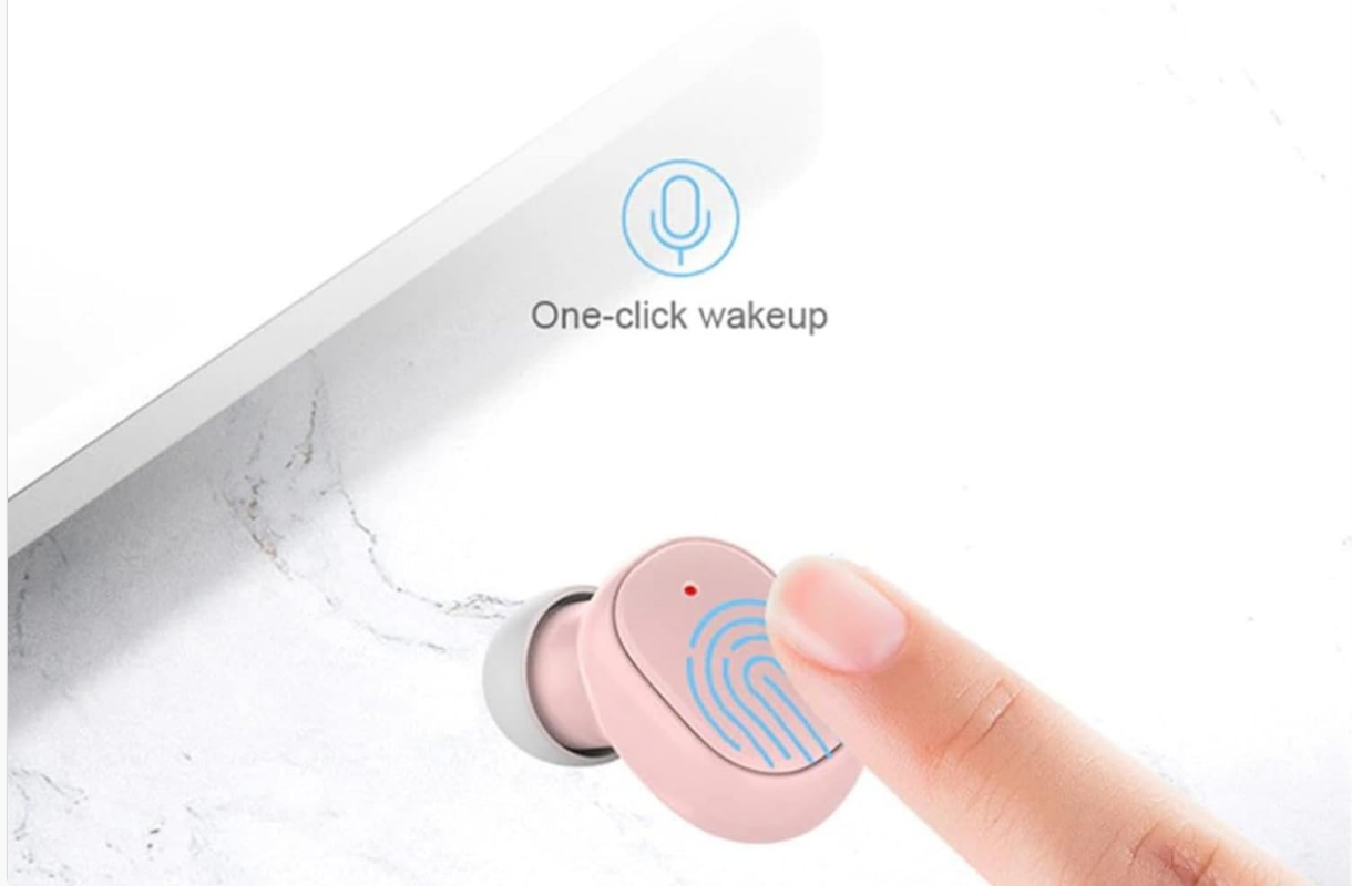
Image: A finger interacting with the touch sensor on an earbud, demonstrating the one-button activation for voice assistants like Siri.

One-click call to voice assistant, travel and listen to your instructions freely at any time