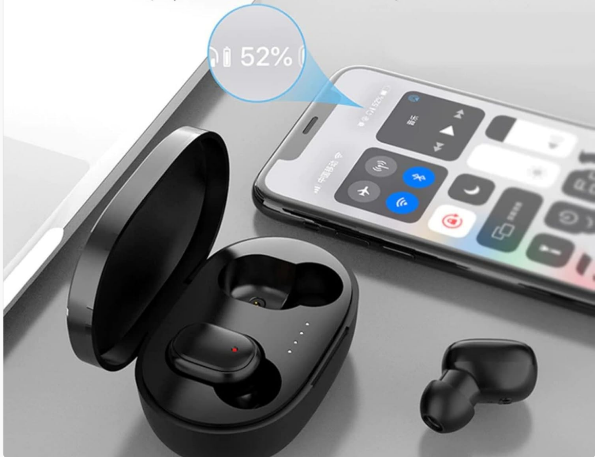
Image: A smartphone screen displaying the real-time battery percentage of the connected earbuds, indicating convenient power monitoring.

In the playback state , the remaining power of the headset can be displayed in real time on the mobile phone interface