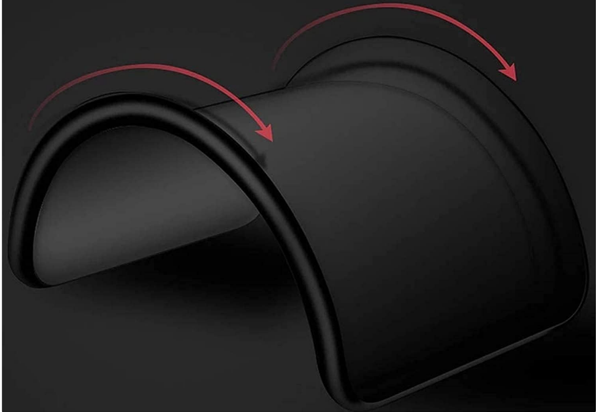
Image: Demonstration of the soft and flexible TPU material for easy installation.