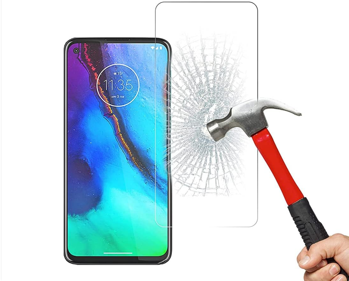
Image: Visual demonstration of the screen protector's scratch-proof capabilities.

Scratch proof screen effectively avoids sharp objects scratching or abrasion