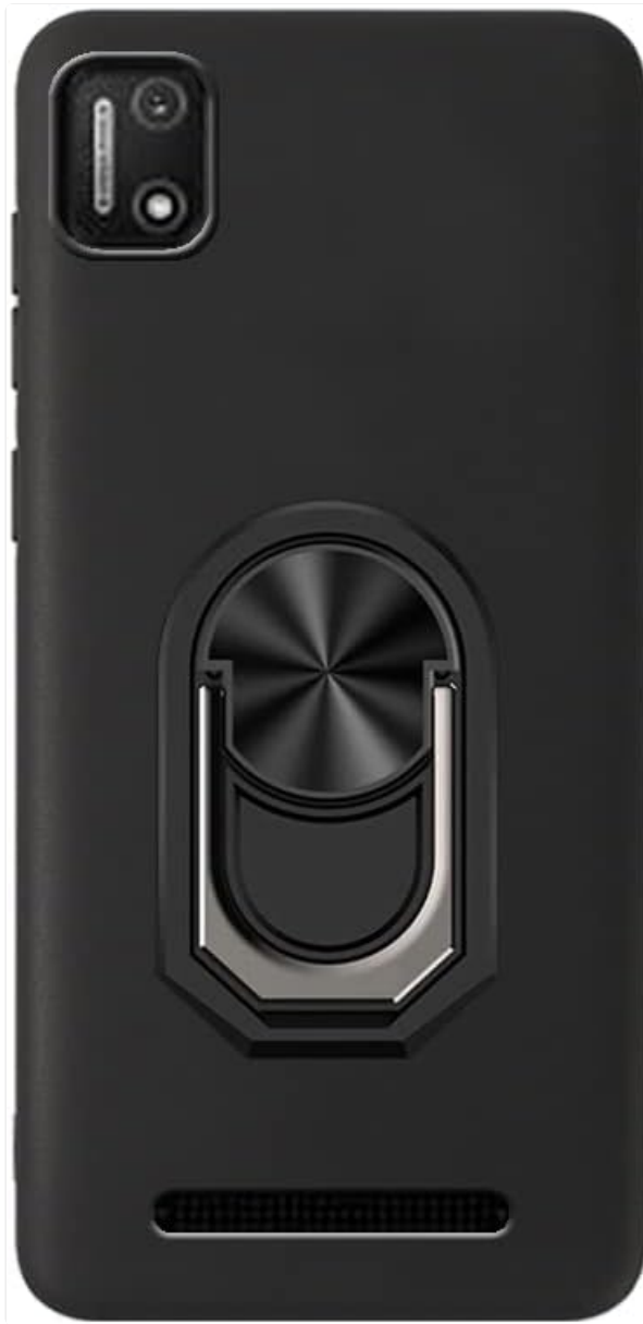
Image: Rear view of the Futanwei Stratus C7 phone case with integrated ring holder.