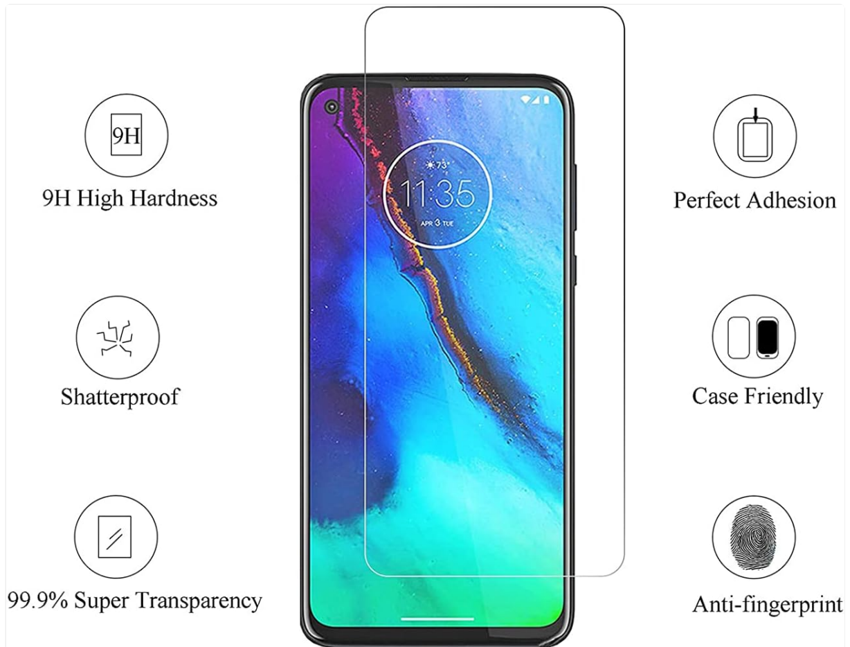
Image: Overview of the tempered glass screen protector's features including 9H hardness and anti-fingerprint properties.