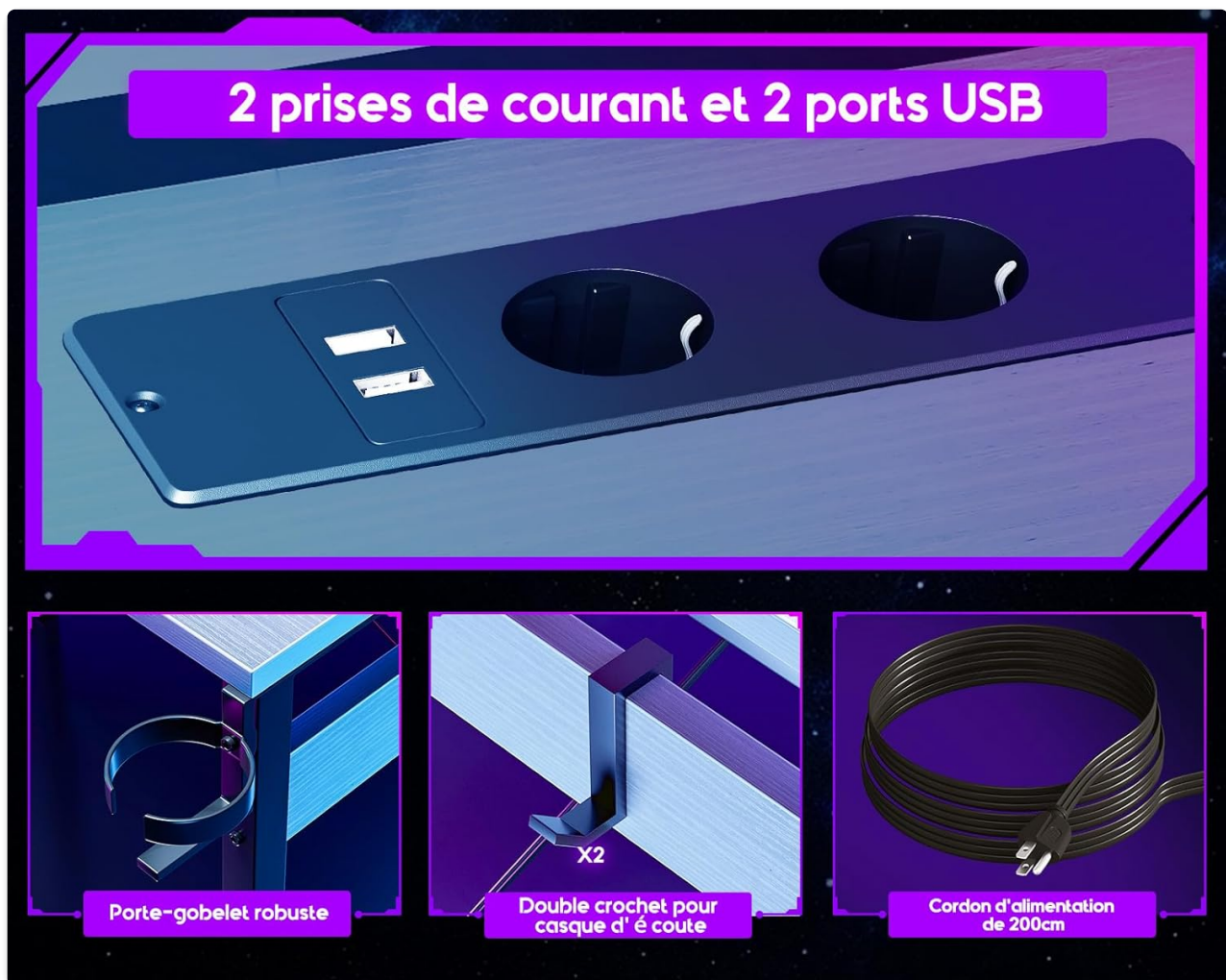
Image 3.3: Integrated power outlets and USB ports for device connectivity.