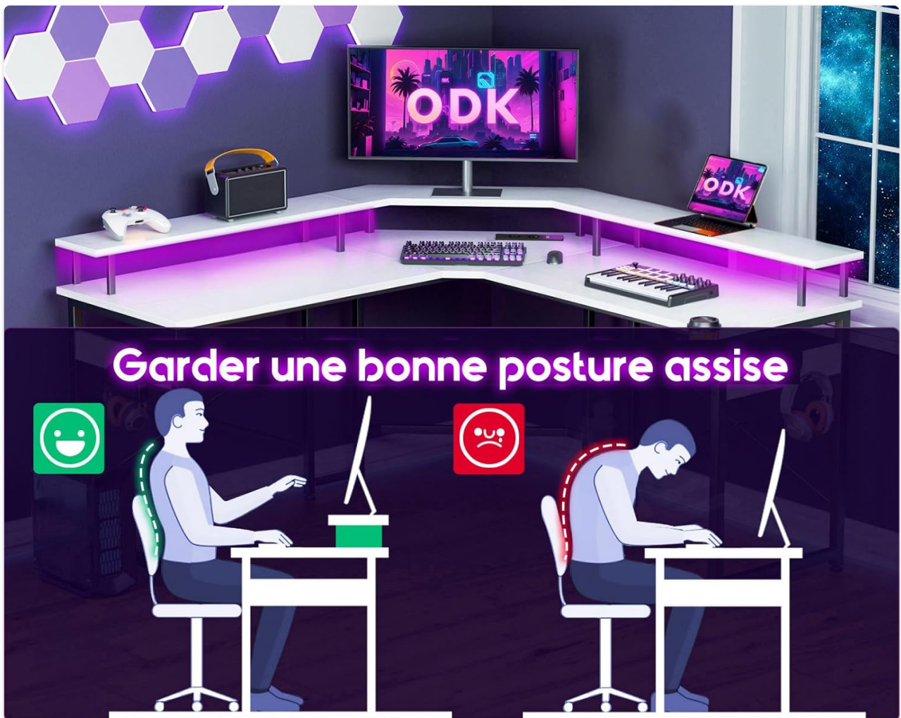
Image 3.4: Proper ergonomic posture facilitated by the monitor stand.