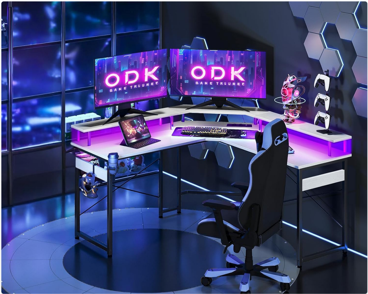
Image 1.1: ODK Gaming Corner Desk in a typical setup with dual monitors and LED lighting.