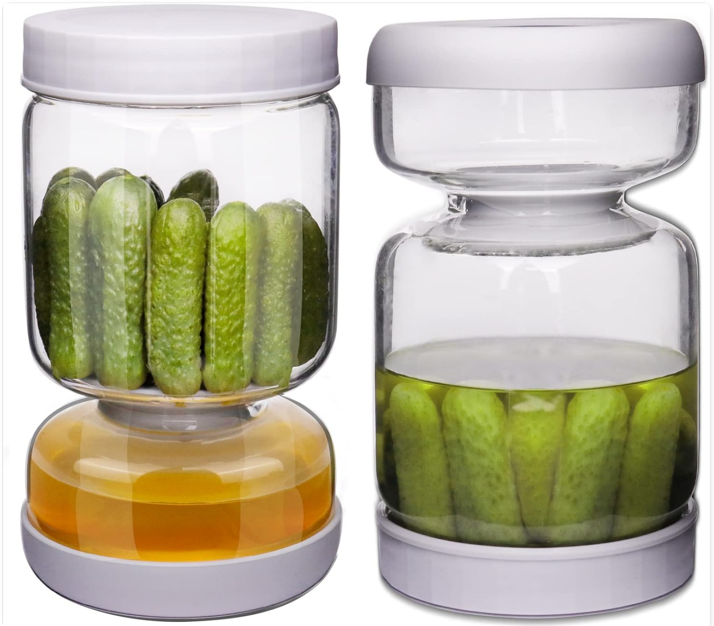
Image: Demonstrates the jar in both upright (storage) and inverted (serving) positions.