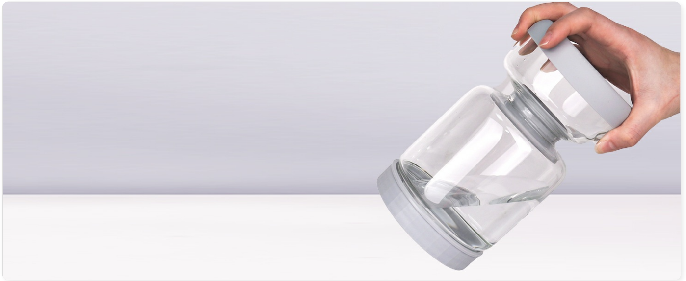
Image: Illustrates easy food retrieval after liquid separation.