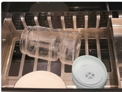
Image: The jar components are suitable for dishwasher cleaning.