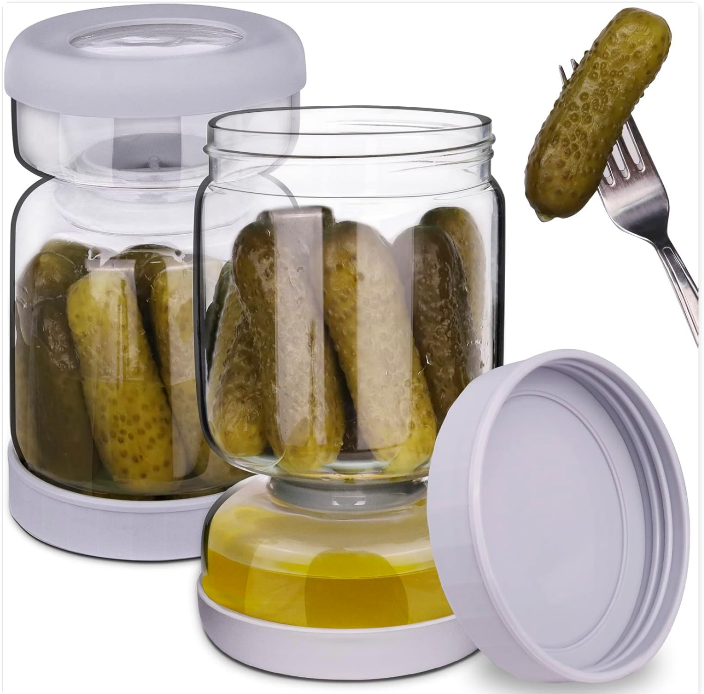
Image: The Homnoble Pickle Jar in use, demonstrating its dual-chamber design for separating solids from liquids.