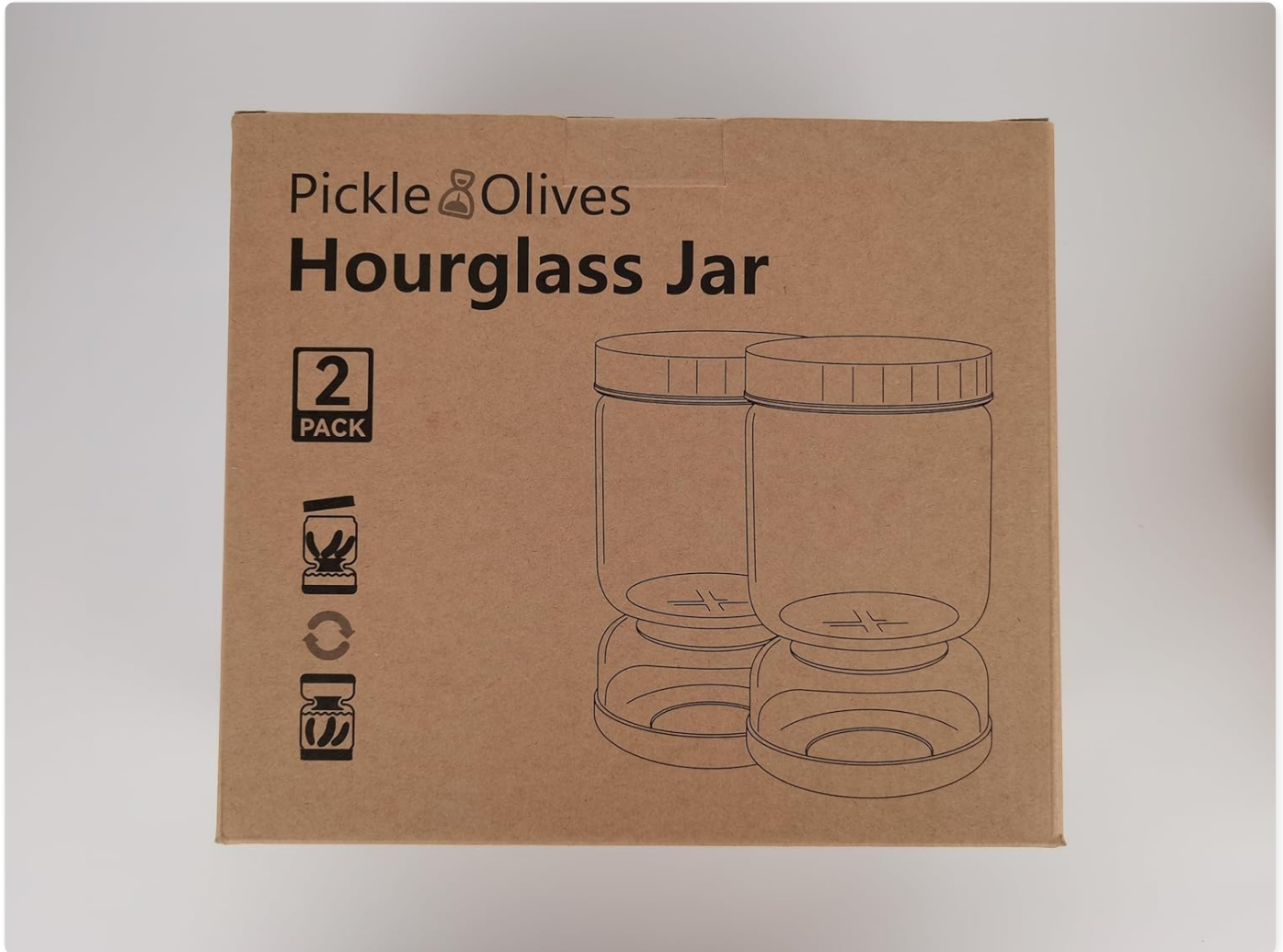
Image: The product packaging, indicating a 2-pack of jars.