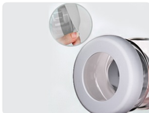
Image: Close-up view of the non-slip silicone pad on the jar's base.