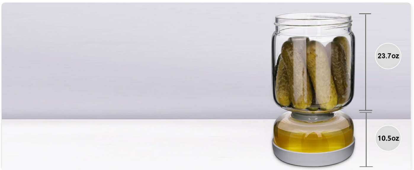
Image: Examples of various foods suitable for storage in the Homnoble Pickle Jar.

Your browser does not support the video tag.