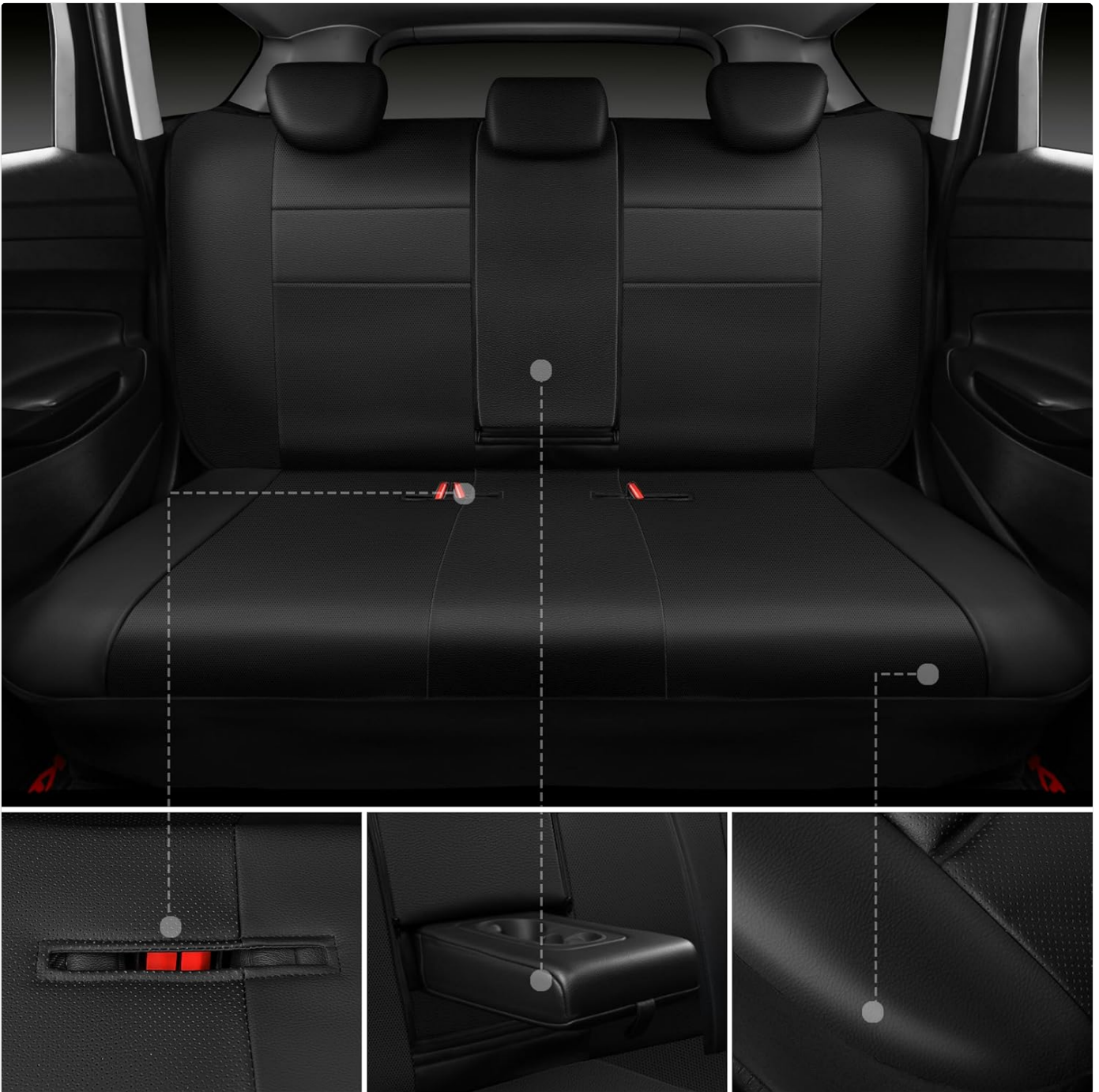
Figure 5: Close-up of the rear seat cover, highlighting the design for armrest access and secure fastening points.