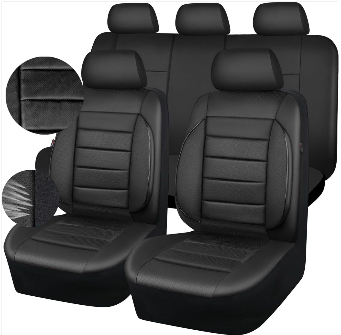
Figure 1: Complete set of CAR PASS Leather Seat Covers, showcasing the design and material.