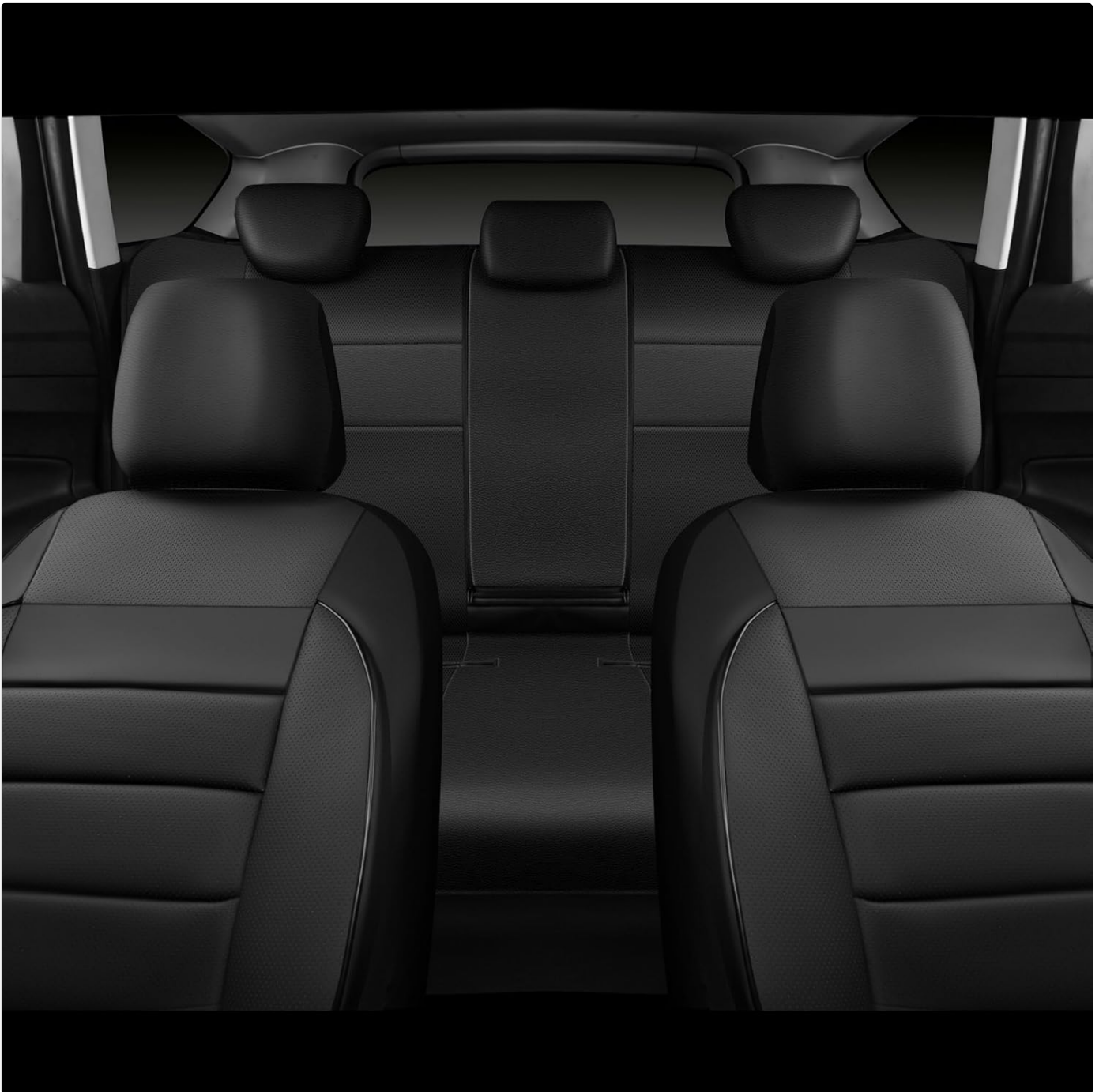
Figure 6: Full interior view with CAR PASS seat covers installed, demonstrating a complete transformation.