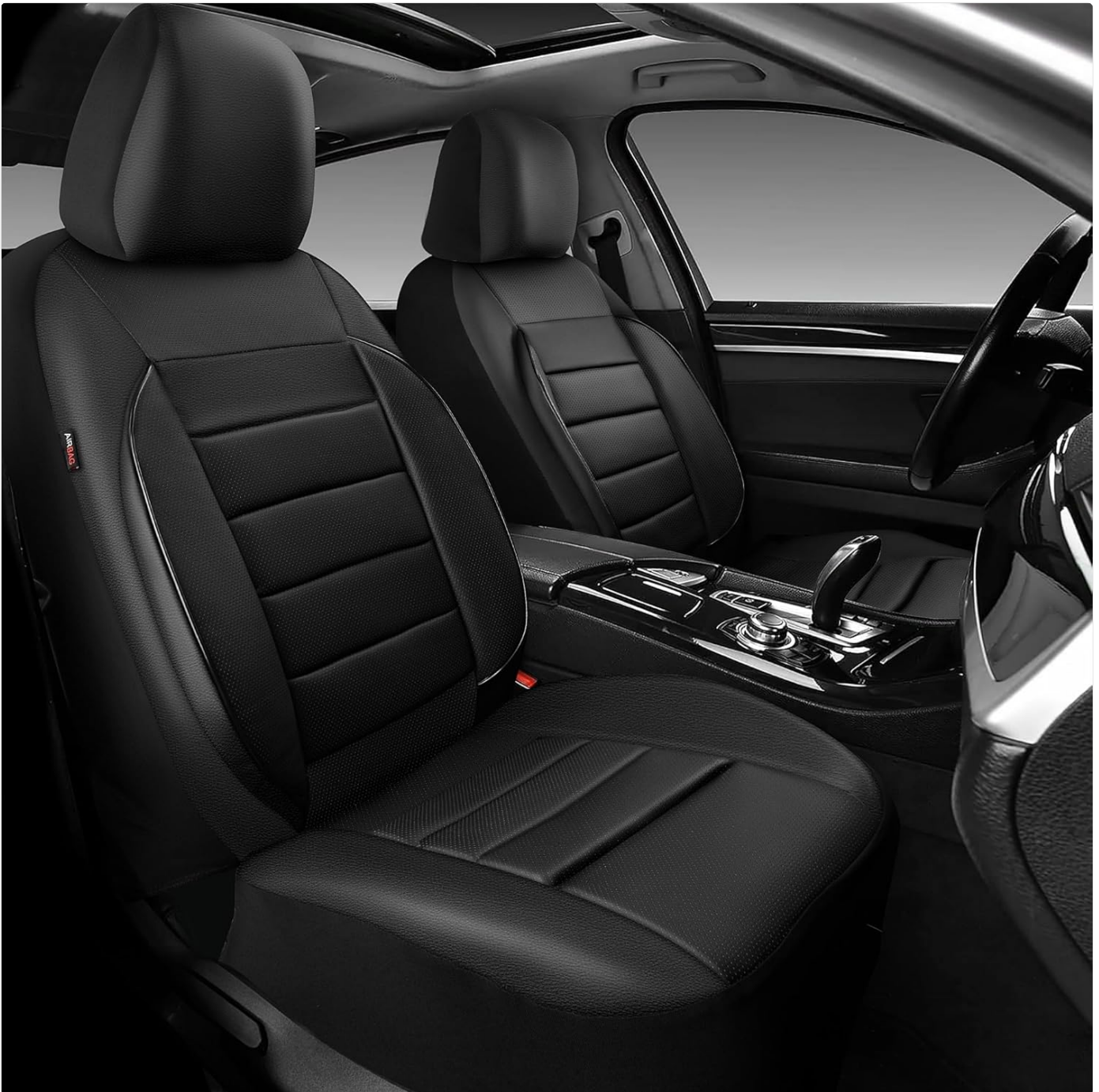
Figure 4: Front seat covers installed, demonstrating the fit and appearance.