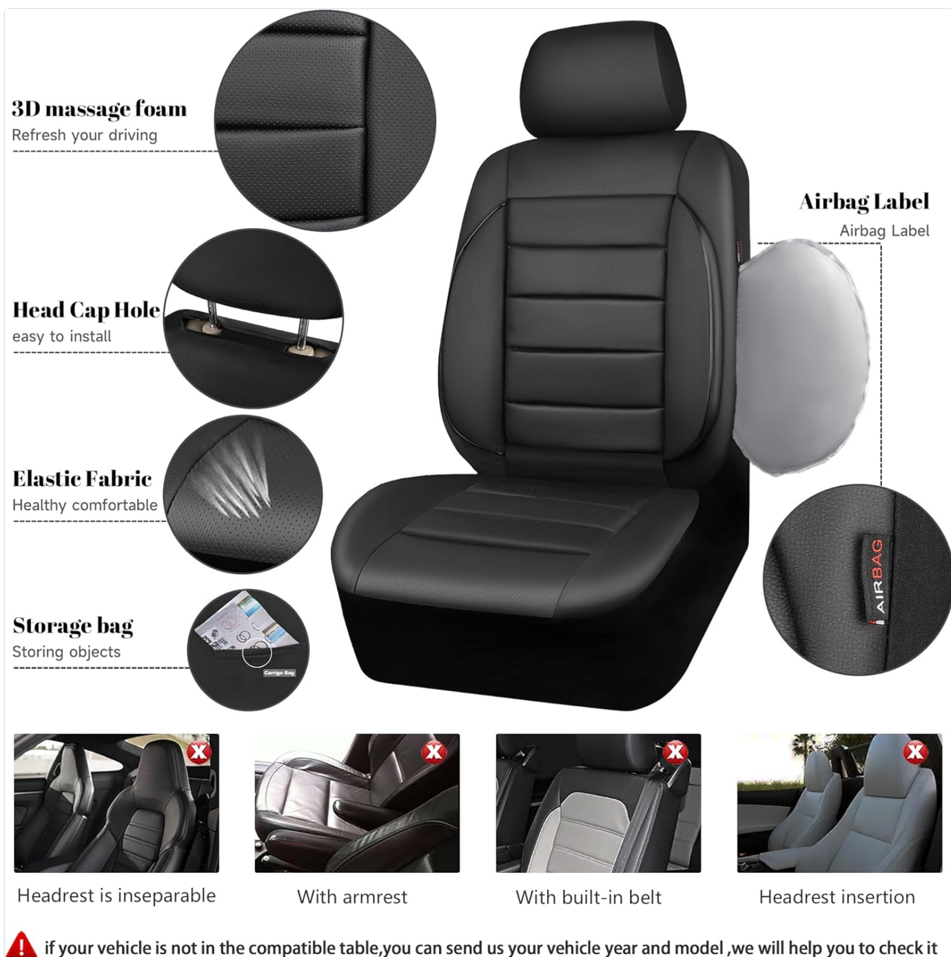
Figure 2: Detailed diagram highlighting key features such as 3D massage foam, airbag label, head cap hole, elastic fabric, and storage bag.