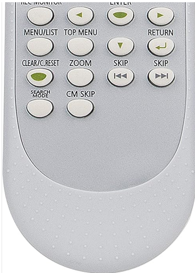
Image: Front view of the NB108UD NB108 remote control, displaying all buttons and their labels. The remote is light gray with white and red buttons.