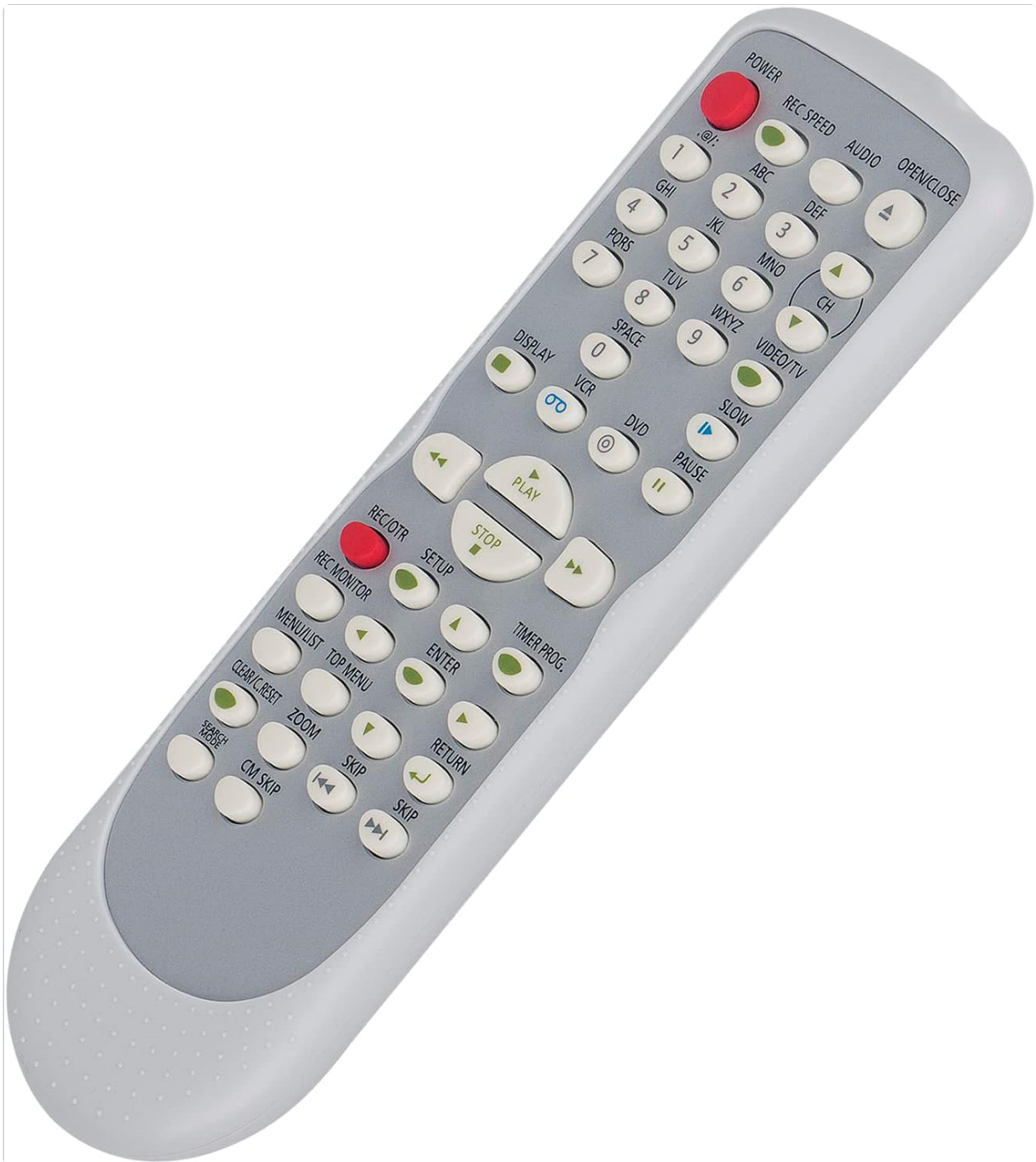
Image: An angled view of the NB108UD NB108 remote control, showing its ergonomic design and button layout from a side perspective.