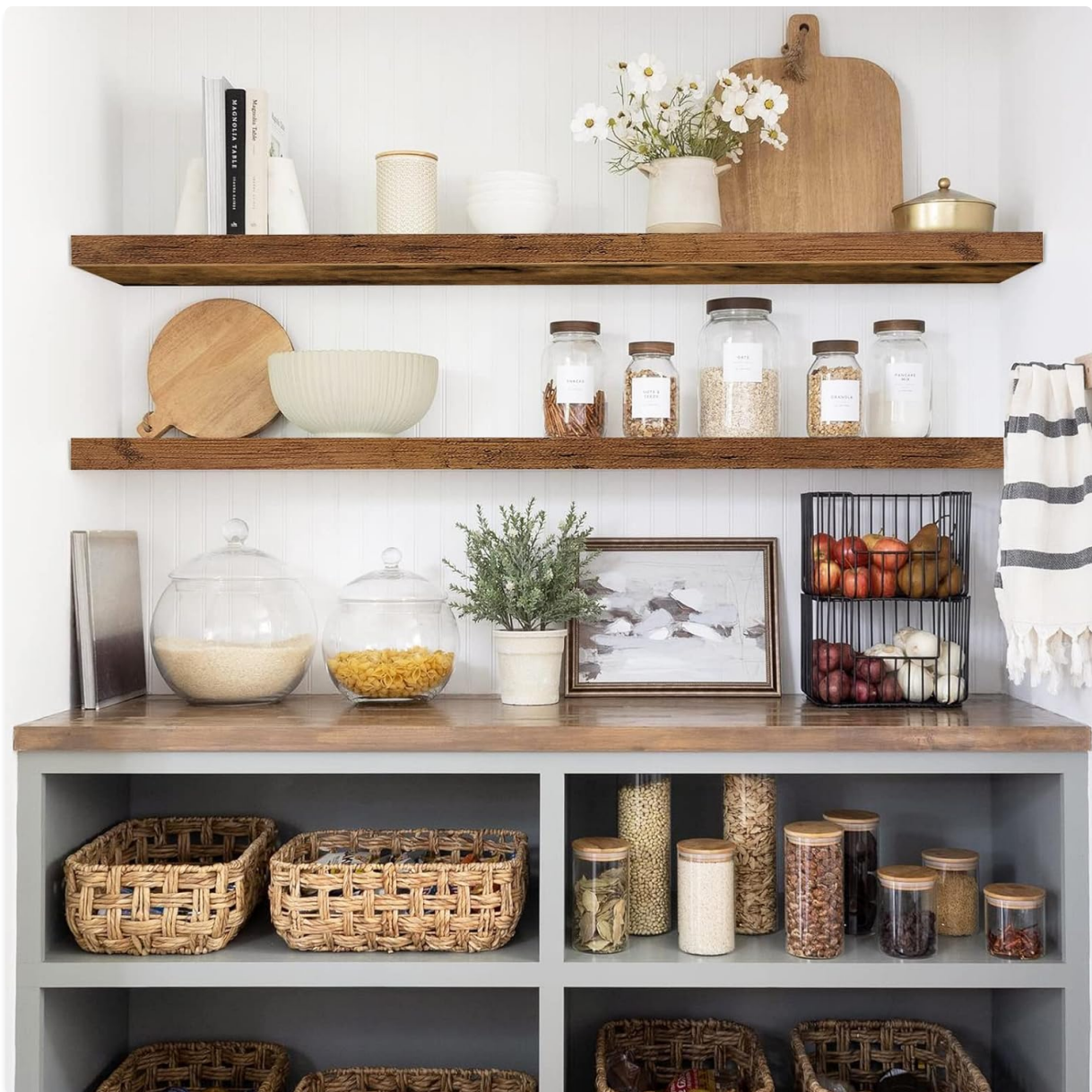
Image: QEEIG floating shelves showcasing various items in a kitchen setting.