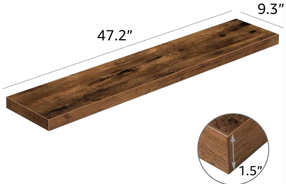
Image: Detailed product dimension diagram for the QEEIG floating shelf.