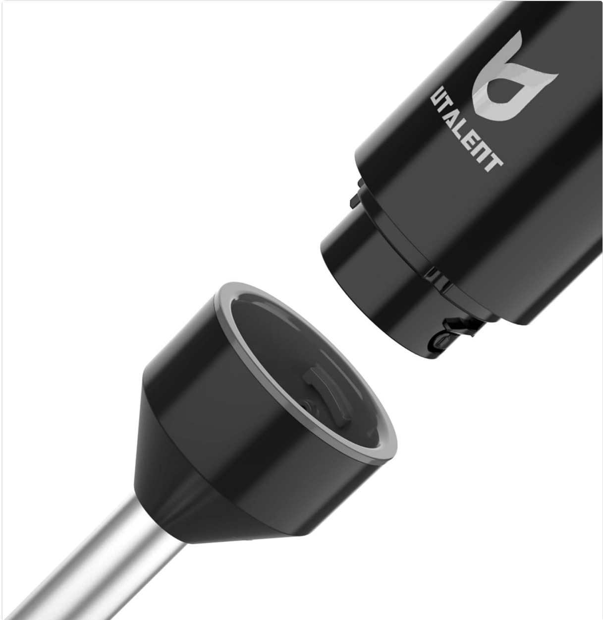
Image: Illustration showing how to detach the blender arm from the main motor unit by twisting.