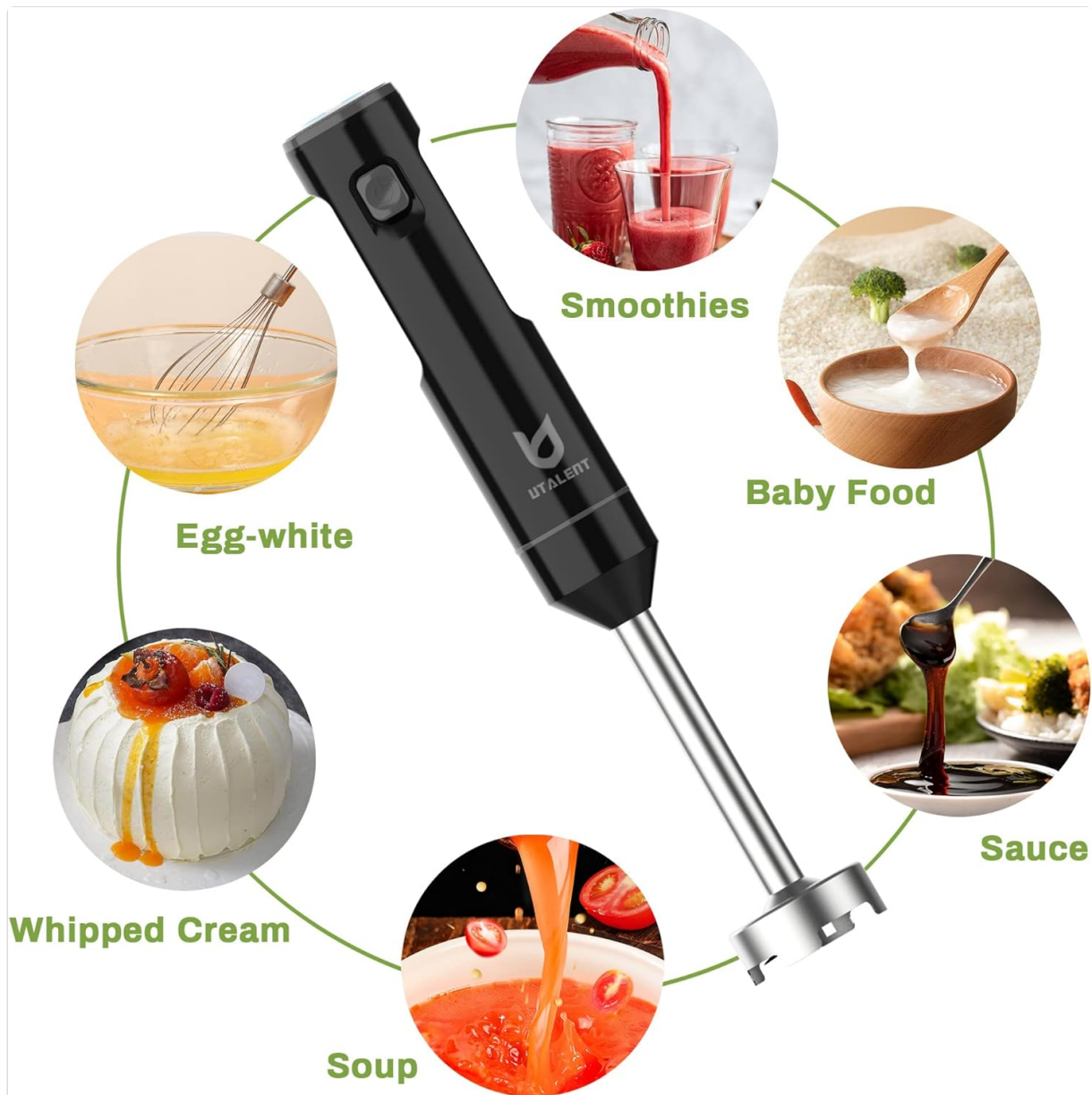
Image: Visual representation of the blender's versatility, showing its use for making smoothies, baby food, sauces, soups, whipped cream, and whisking egg whites.