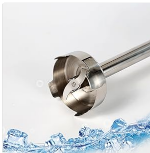
Image: A detailed view of the immersion blender's blade, designed for efficient blending and ice crushing.