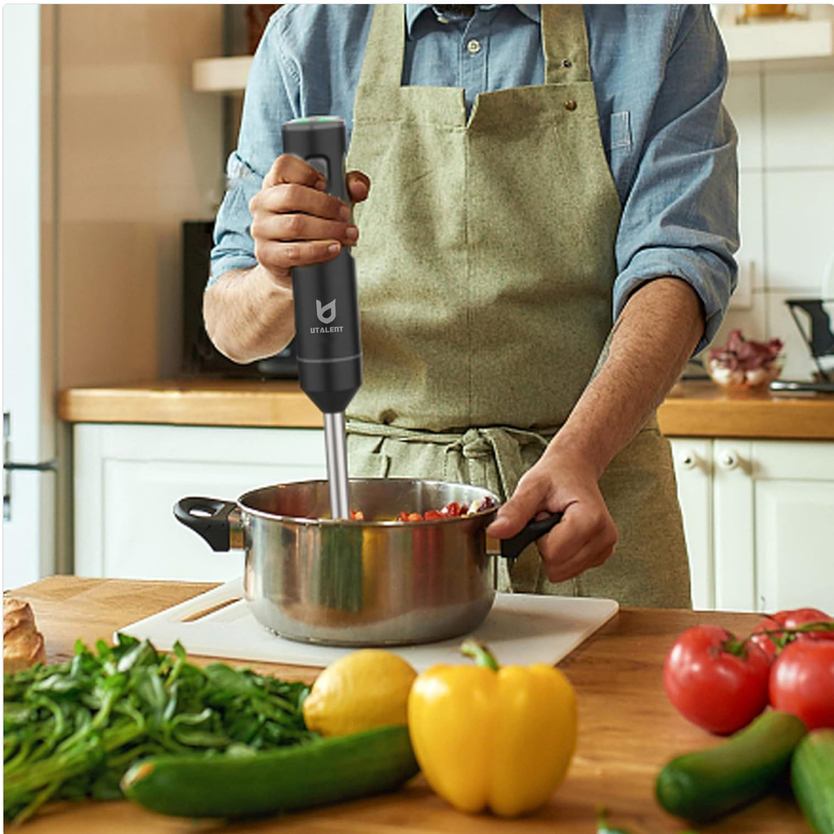
Image: A person demonstrating the use of the immersion blender directly in a cooking pot.

Your browser does not support the video tag.