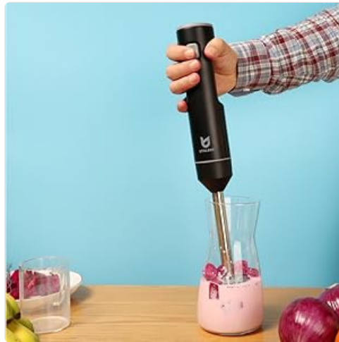
Image: Depiction of the blender's powerful blending capability.