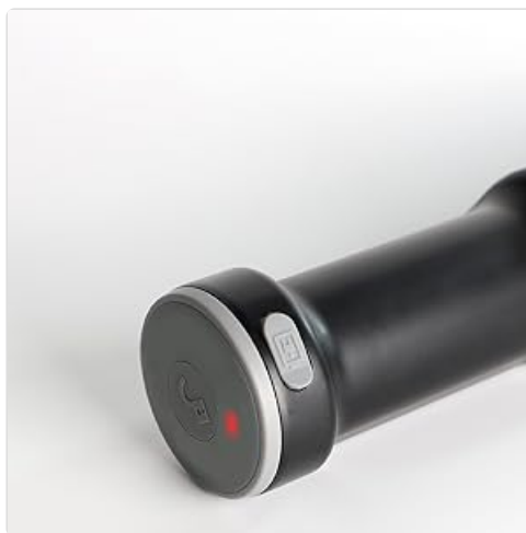
Image: A visual reminder to charge the cordless hand blender using the provided cable.