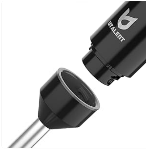
Image: Demonstrates the ease of disassembling and assembling the blender parts for use and cleaning.