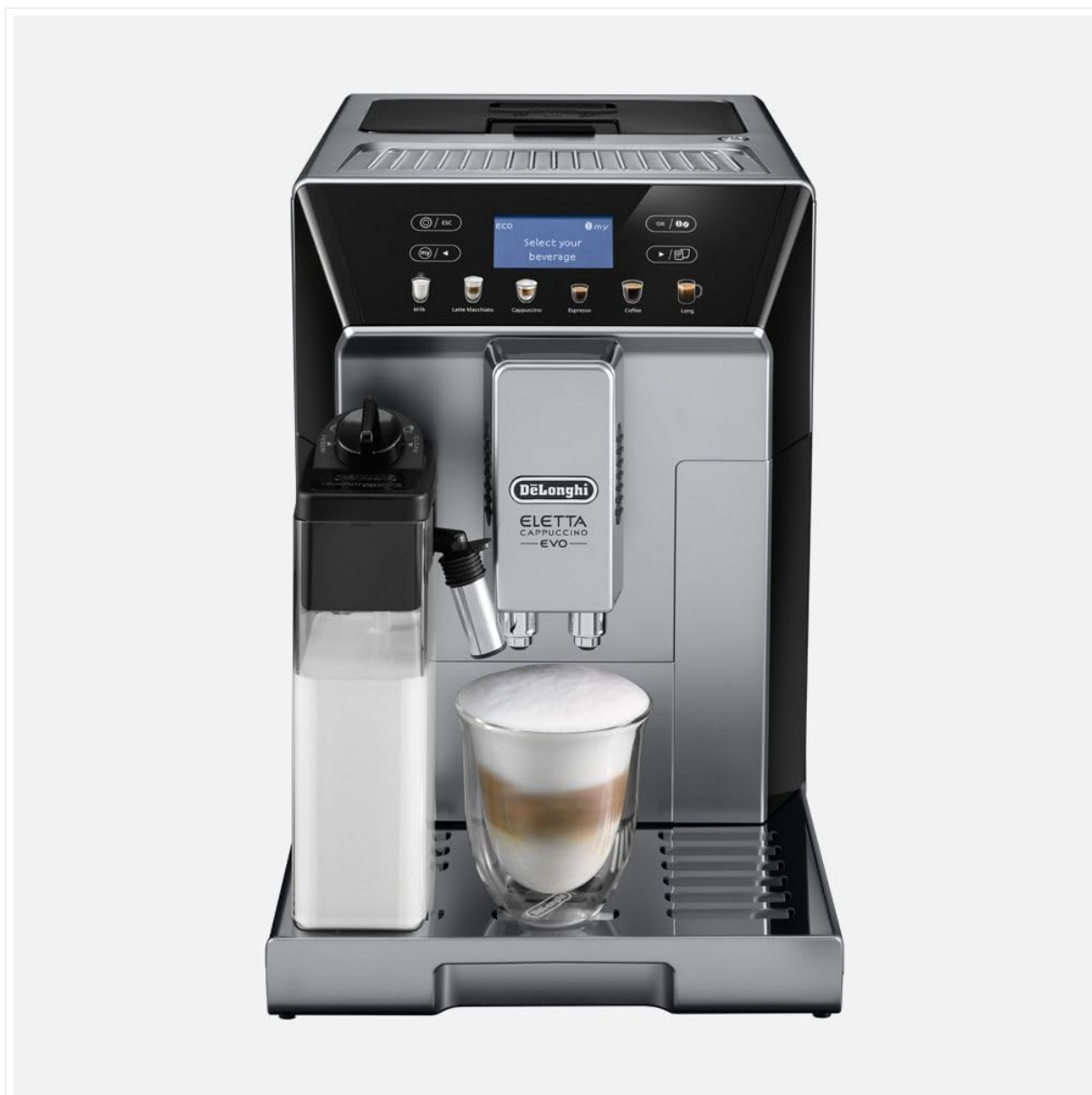
Image 1: Front view of the De'Longhi ECAM46860S Eletta Evo fully automatic espresso machine. It shows the main unit with a silver front panel, a black top, and a digital display. To the left, the LatteCrema milk carafe is attached, dispensing frothed milk into a glass containing a layered latte. The drip tray and cup support grid are visible at the base.

The De'Longhi Eletta Evo is a fully automatic espresso machine designed for convenience and quality. It features an integrated grinder, a LatteCrema system for milk-based beverages, and a user-friendly control panel.