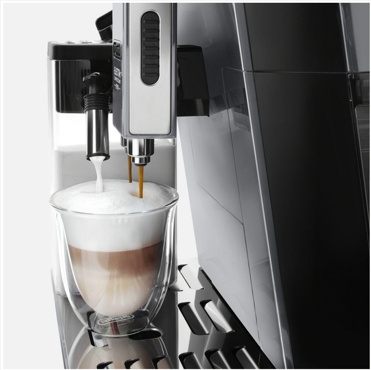
Image 3: A close-up shot of the De'Longhi ECAM46860S Eletta Evo in operation. The machine is simultaneously dispensing frothed milk from the LatteCrema system's spout and espresso from the coffee spout into a clear glass, creating a layered milk-based coffee drink. The rich foam layer is clearly visible at the top of the beverage.