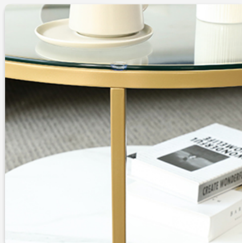
Image 4.2: Detail of the robust metal frame and the lower storage shelf, highlighting the stable connection points and firm bottom design.