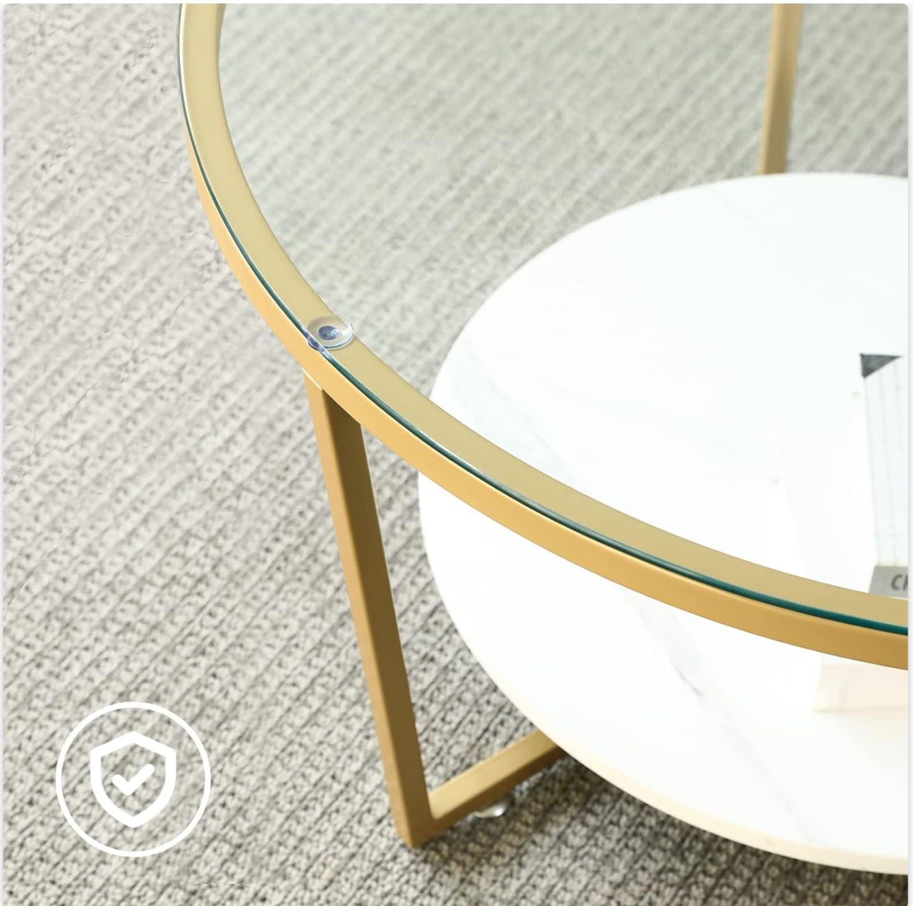
Image 4.1: Close-up view of the suction cup mechanism that secures the glass tabletop to the metal frame, ensuring stability.