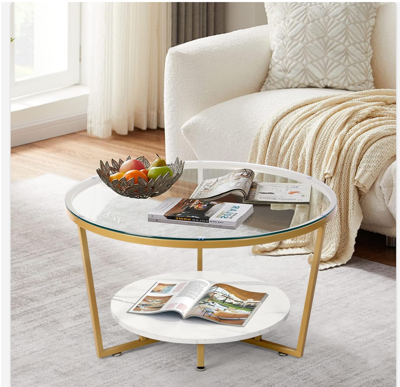
Image 1.1: The VOWNER Glass Round Coffee Table, showcasing its clear glass top, gold-finished metal frame, and lower marble-patterned storage shelf in a modern living room setting.