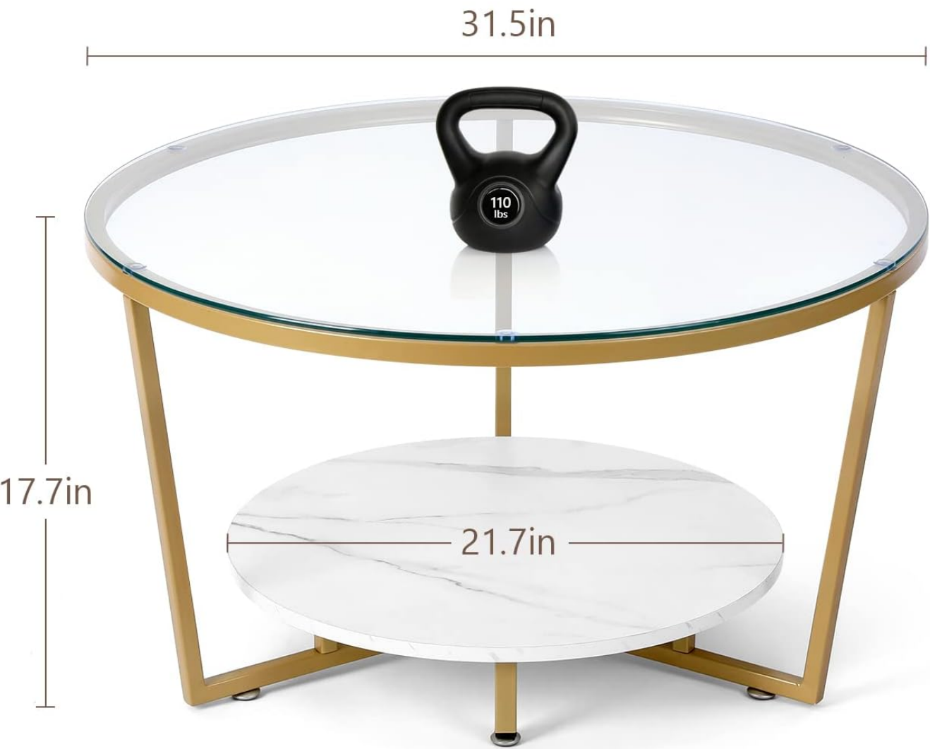
Image 8.1: Detailed product dimensions, including the overall diameter, height, and lower shelf diameter, along with the top surface weight capacity.