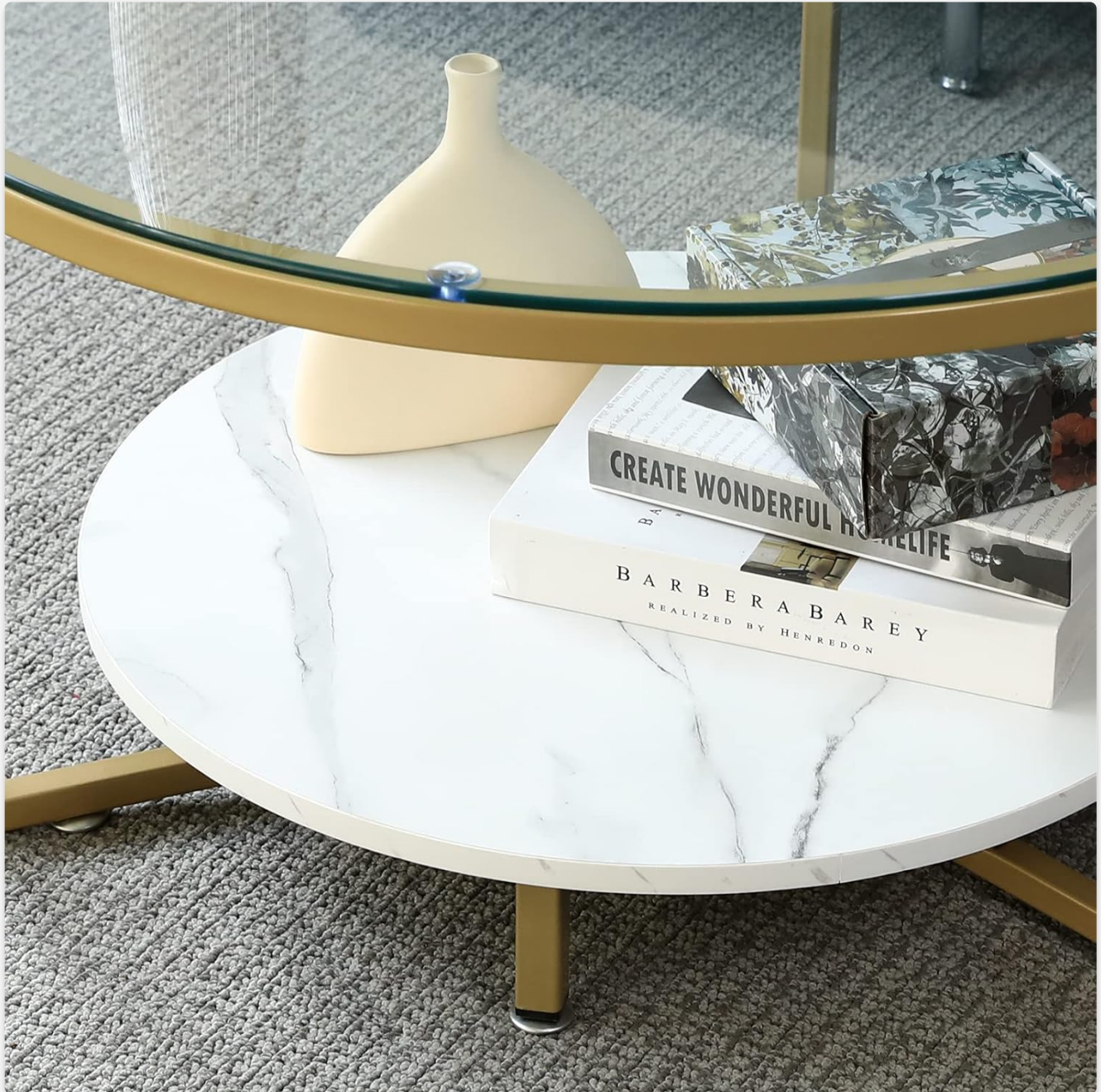
Image 5.1: The lower engineered wood shelf with a marble finish, providing practical storage for books and other items.

Your browser does not support the video tag.