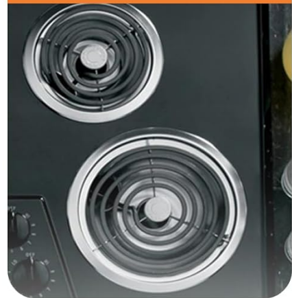
Image 5.1: Visual representation of symptoms indicating a faulty burner receptacle.