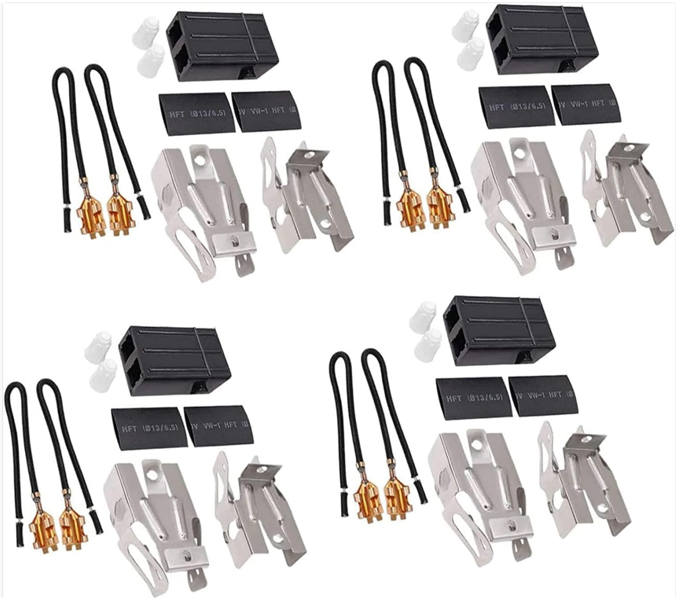
Image 1.1: Overview of the Beaquicy 330031 Range Burner Receptacle 4-Pack Kit.