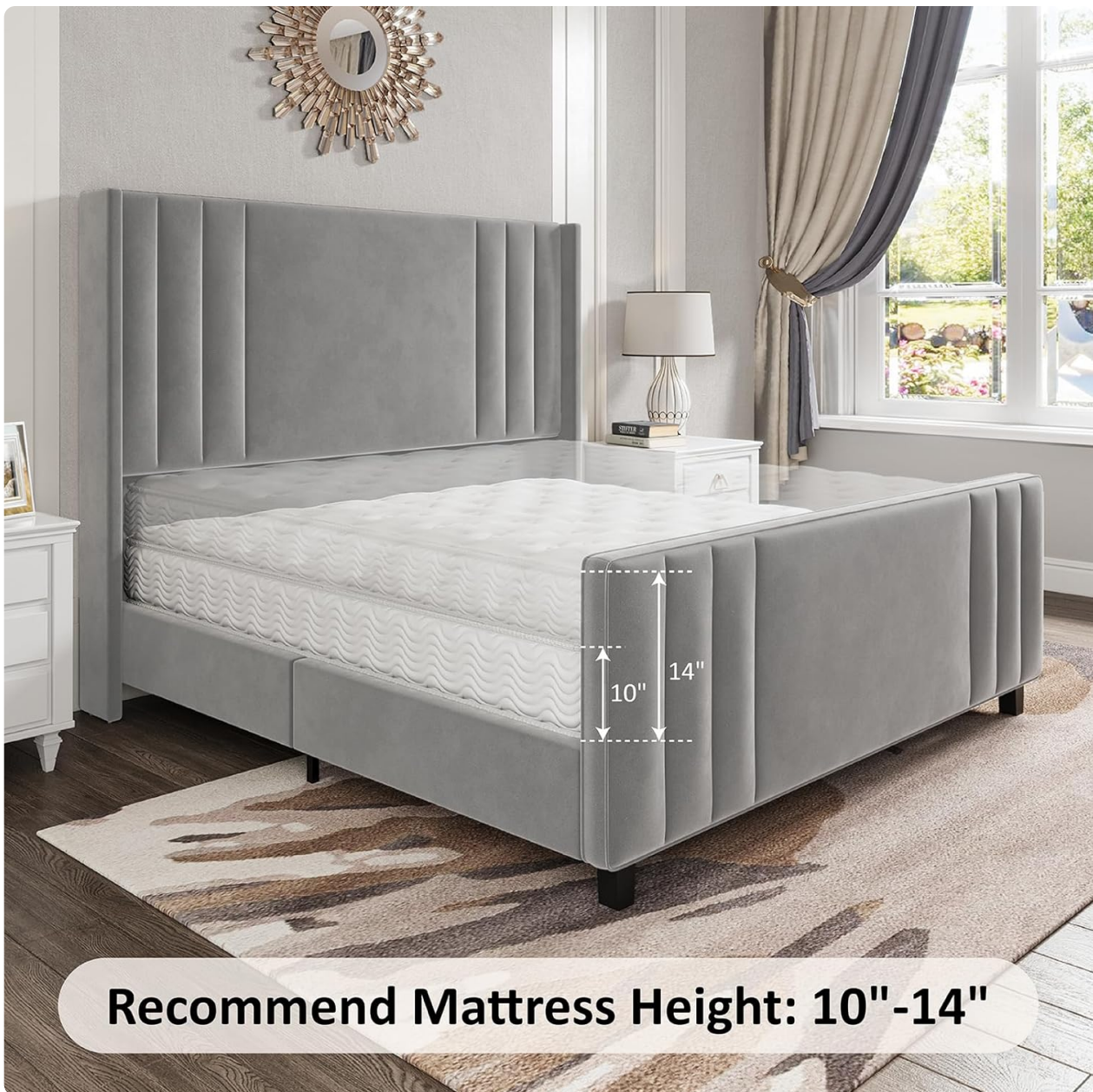
Figure 4: Recommended mattress height for optimal fit.