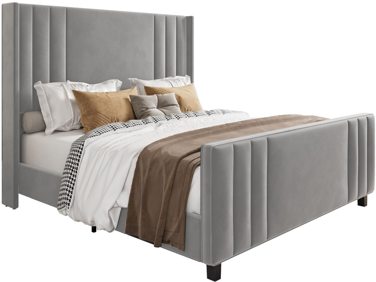
Figure 3: Details highlighting the tufted design, easy assembly, and sturdy construction.