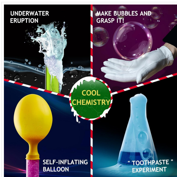
Image: Examples of "Cool Chemistry" experiments, such as an underwater eruption in a test tube, making bubbles, a self-inflating balloon, and a "toothpaste" experiment with foam overflowing from a flask.