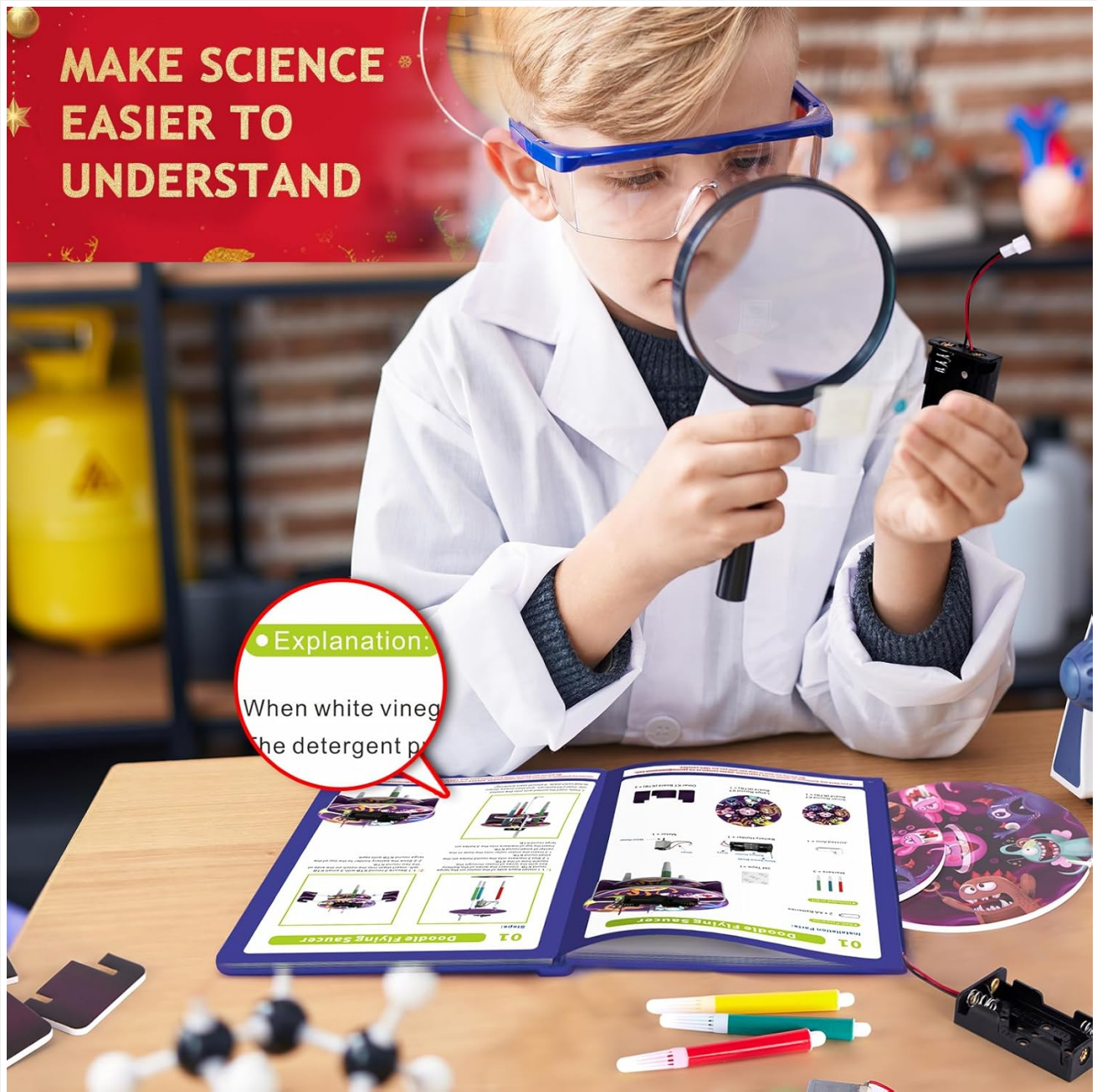
Image: A complete layout of the Japace Science Kit contents, including the instruction manual, various beakers, tubes, powders, and components for the building sets.