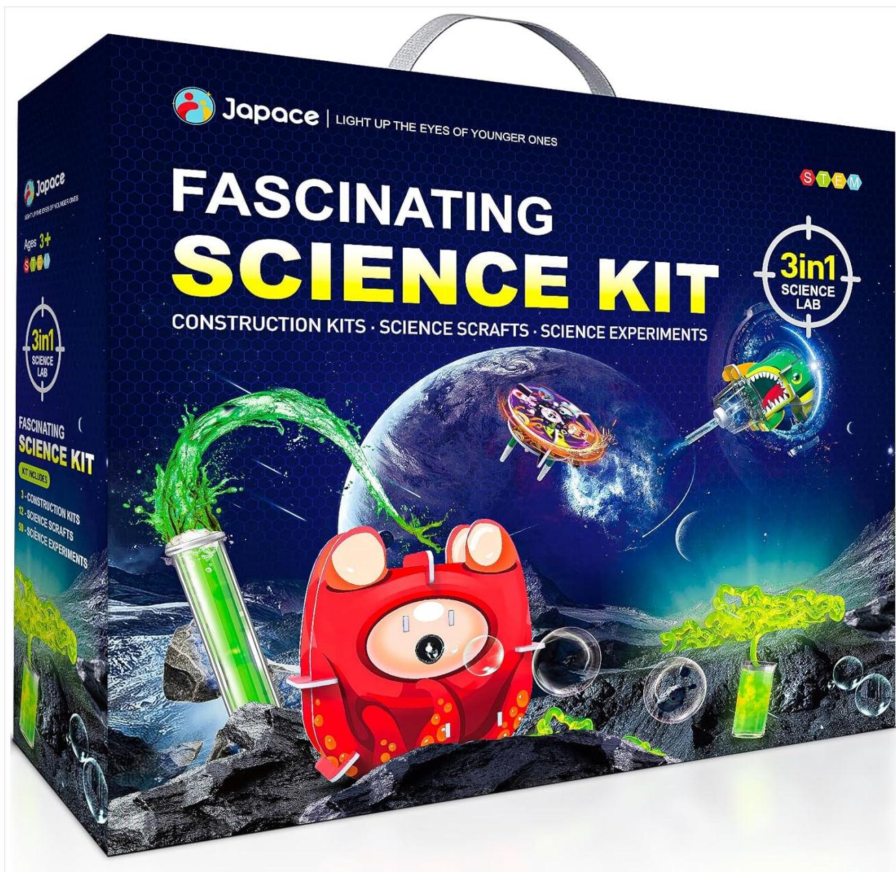
Image: The Japace Science Kit box, highlighting its "Fascinating Science Kit" title and "3in1 Science Lab" features, including construction kits, science crafts, and science experiments.