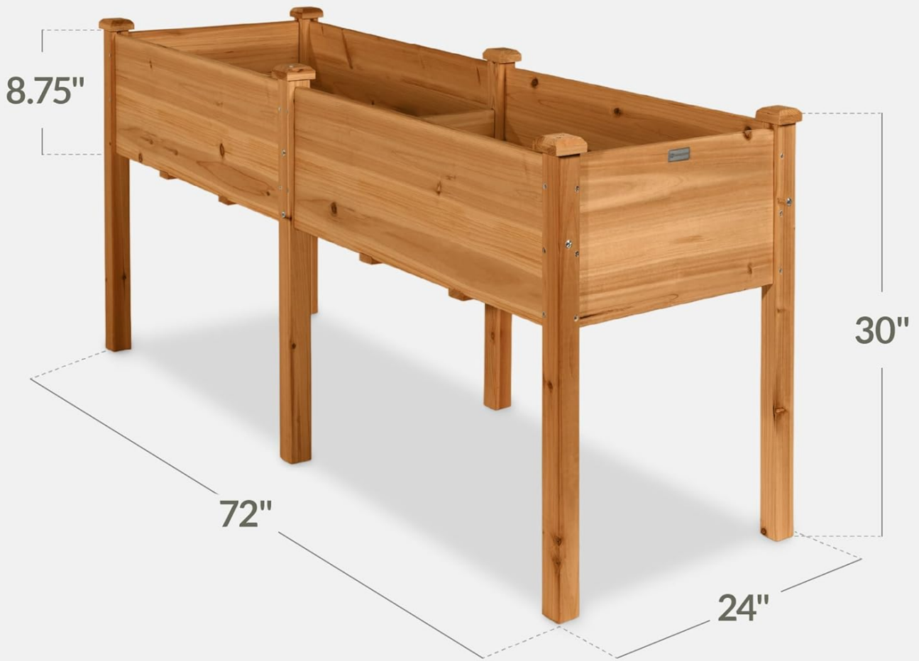
Figure 1: Product Dimensions. The raised garden bed measures 72 inches in length, 24 inches in width, and 30 inches in height, providing ample space for various plants.