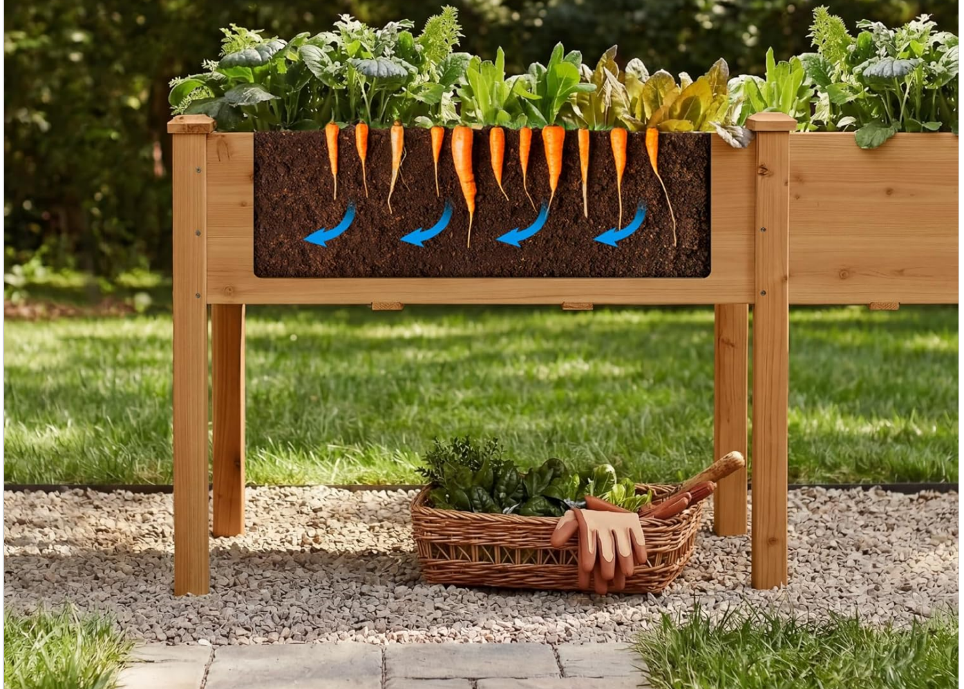
Figure 4: Built-In Drainage System. Six drainage holes facilitate proper water flow, preventing waterlogging and promoting healthy root development.

Six holes promote drainage by preventing root rot and salt buildup within soil