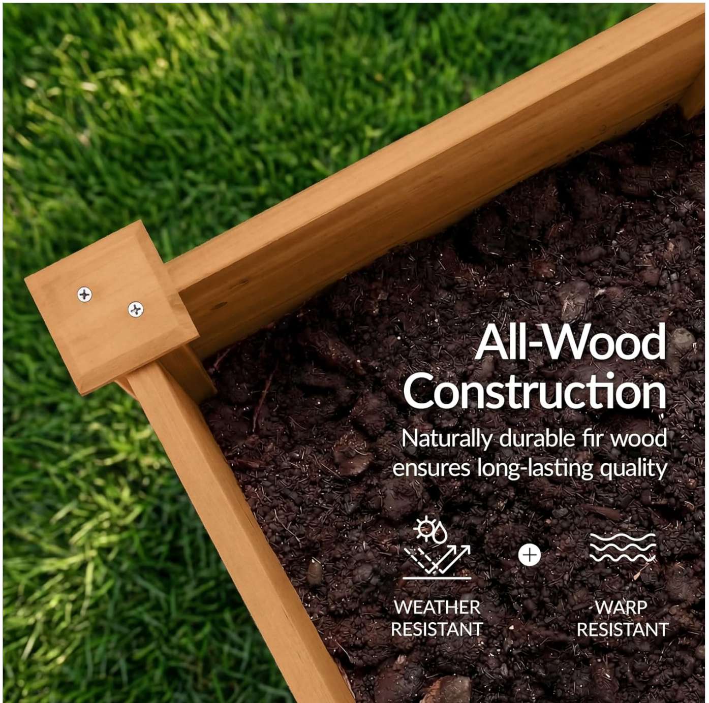
Figure 3: All-Wood Construction. The naturally durable fir wood ensures long-lasting quality, offering weather and warp resistance.