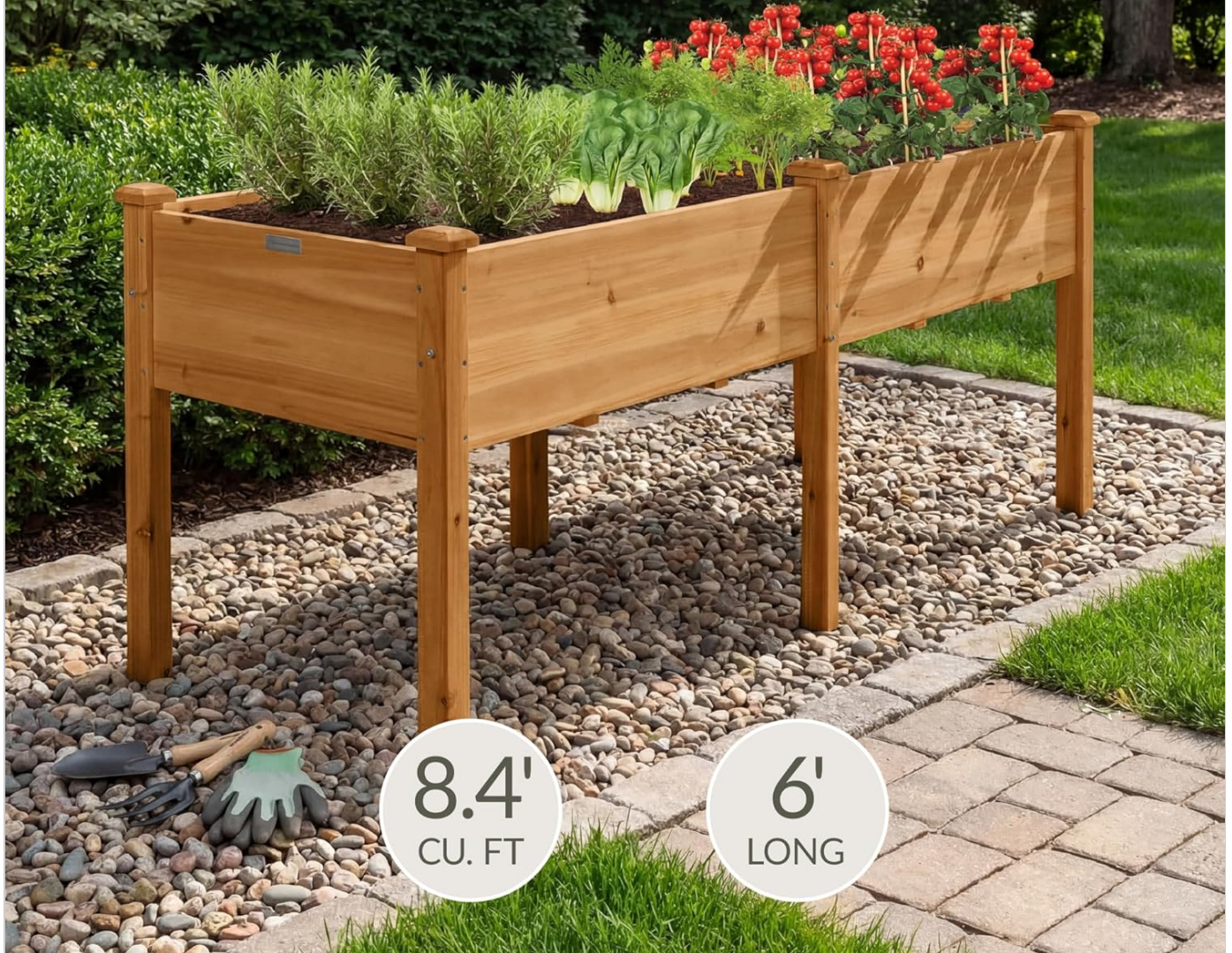
Figure 5: Large Planting Space. The bed provides 8.4 cubic feet of space, suitable for deep-rooted vegetables, flowers, and herbs.

Fill over 8.4 cubic ft of space with deep-rooted vegetables, flowers, succulents, and more