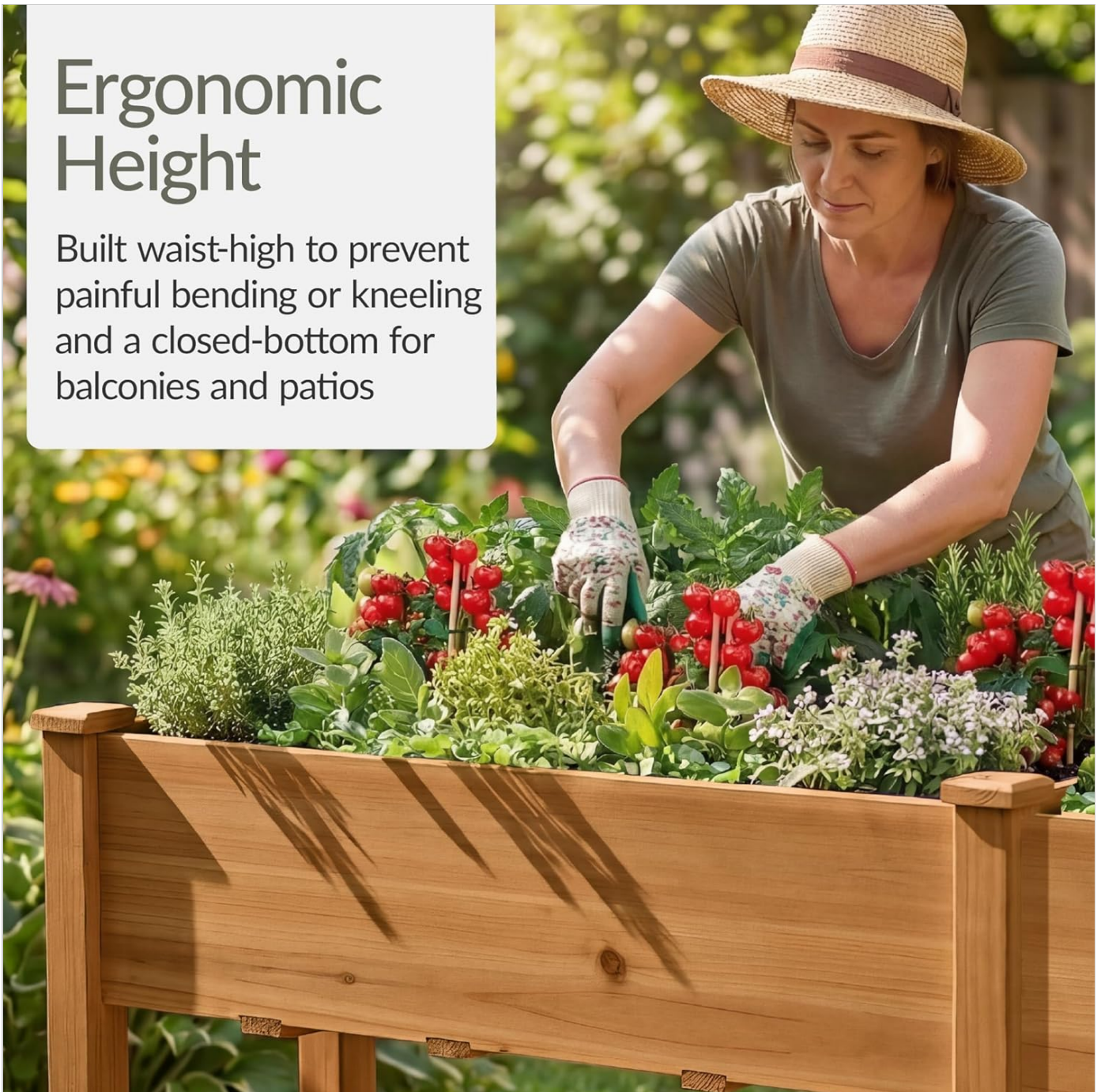
Figure 2: Ergonomic Height. The 30-inch tall design eliminates the need for excessive bending or kneeling, promoting comfortable gardening.

Built waist-high to prevent painful bending or kneeling and a closed-bottom for balconies and patios