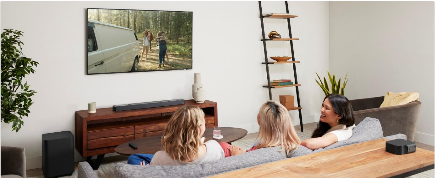
Image: Demonstrates music streaming capabilities via various wireless technologies.