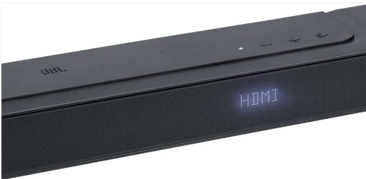
Image: Front display of the soundbar indicating the active input source.

The soundbar can be controlled using the included remote control or the buttons on the top panel of the soundbar. The display on the front of the soundbar provides visual feedback on the current input, volume level, and other settings.