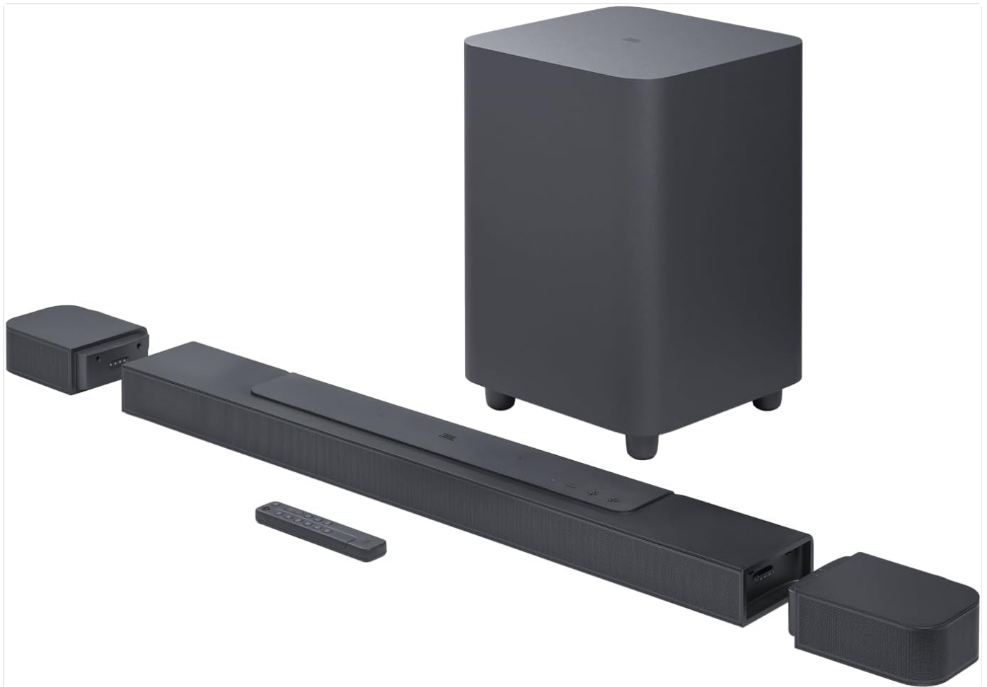
Image: All components of the JBL Bar 700 system, including the soundbar, detachable speakers, subwoofer, and remote.