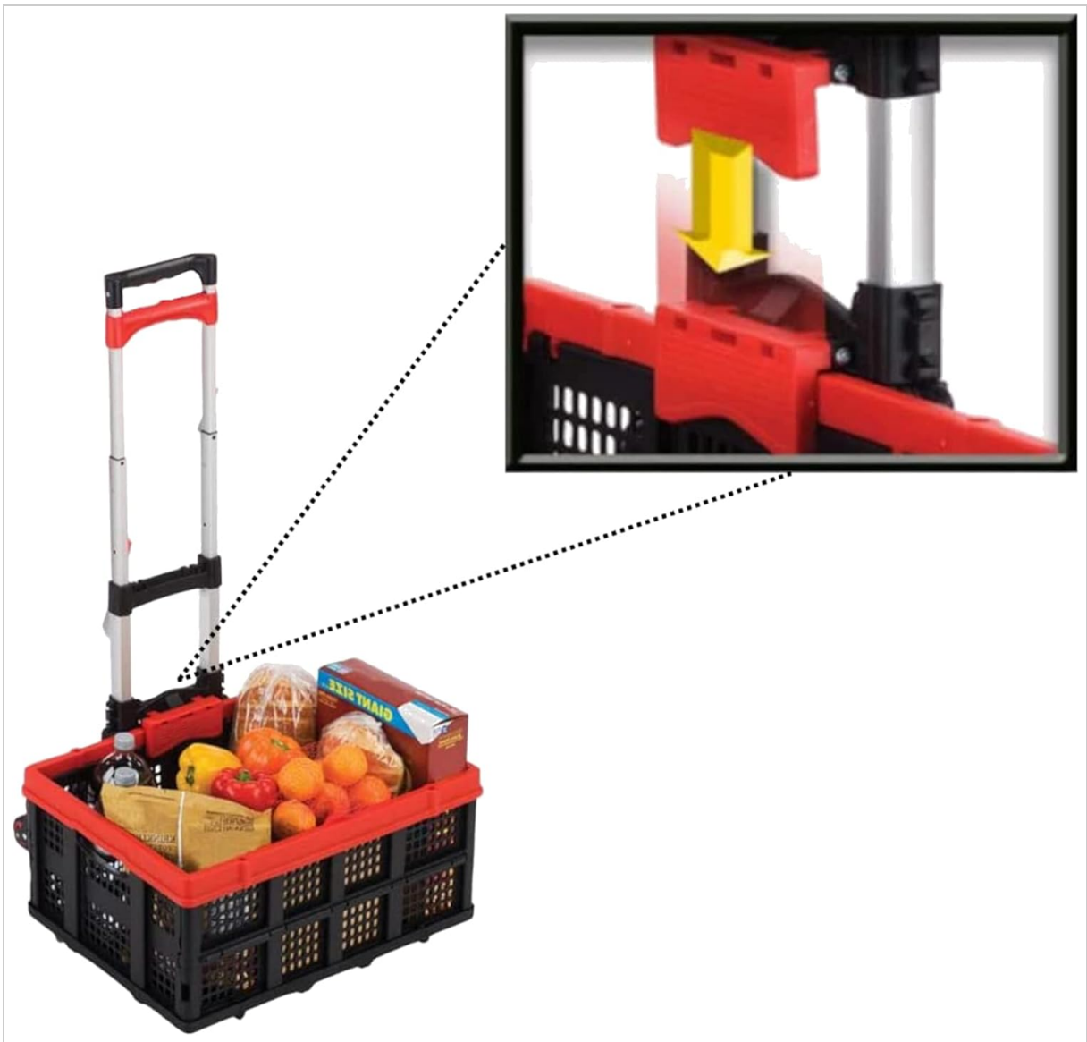
The adjustable latch mechanism securing a crate to the hand truck, demonstrating its tote attachment feature.