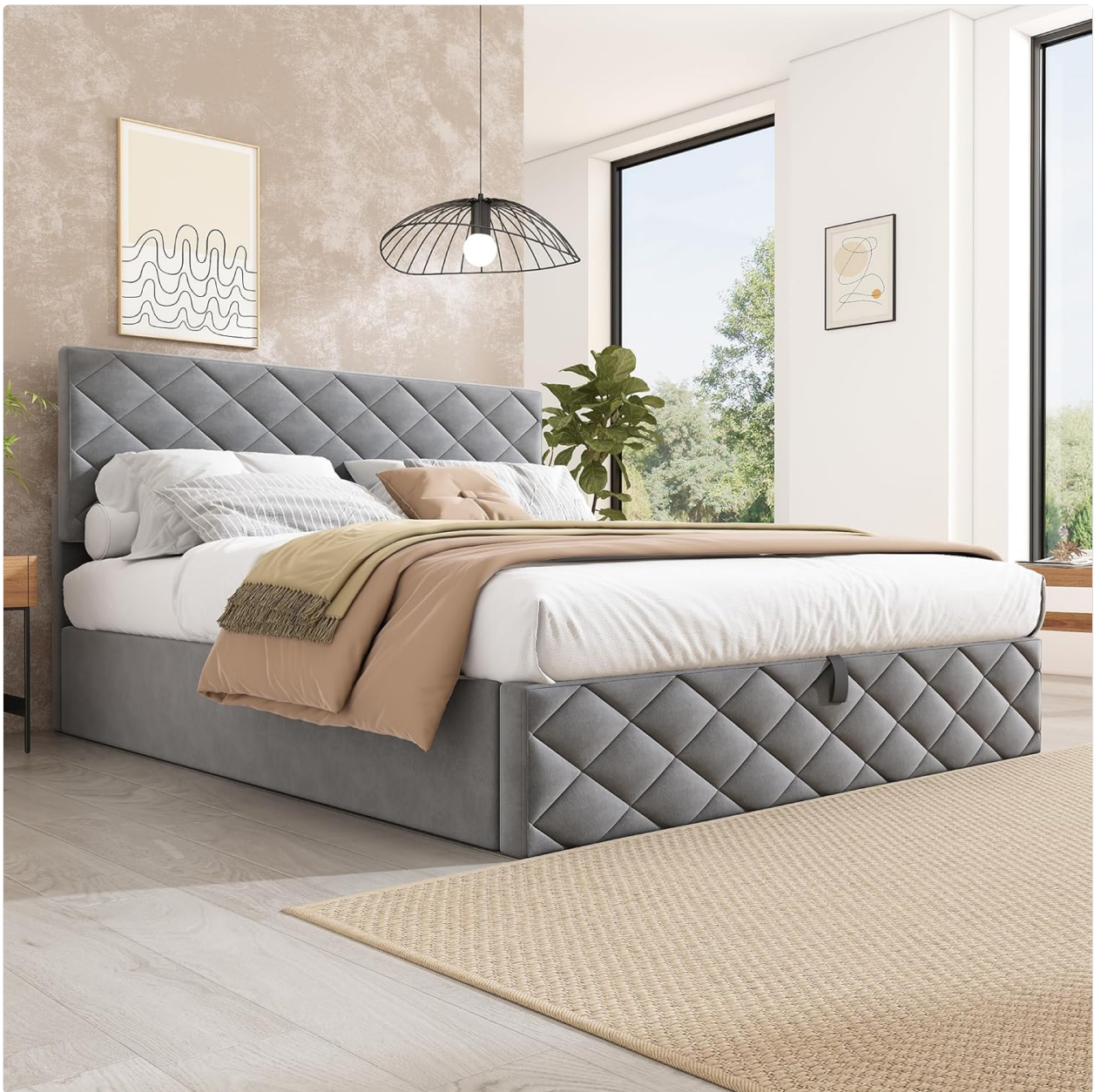
Image 1.1: The Moimhear Upholstered Bed 140 x 200, featuring a grey upholstered finish and a high headboard.