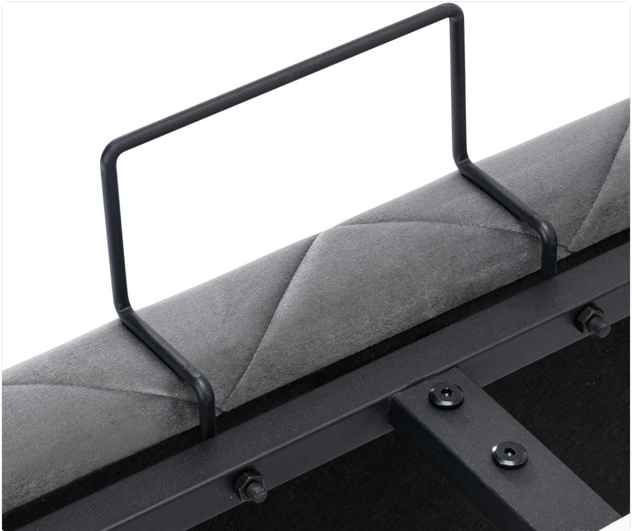
Image 5.2: Detail of the metal bar designed to retain the mattress when the bed base is lifted.