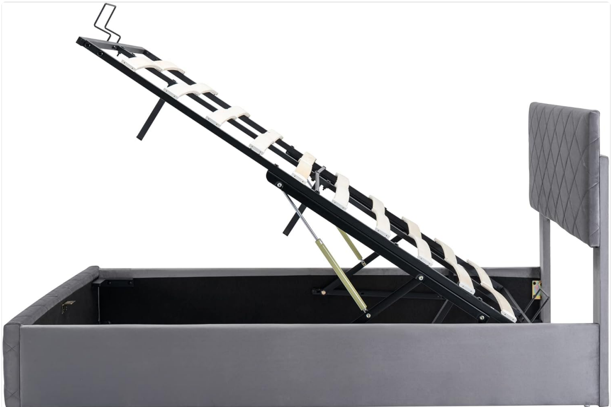
Image 4.2: Detailed view of the hydraulic lift mechanism and slatted base during assembly.