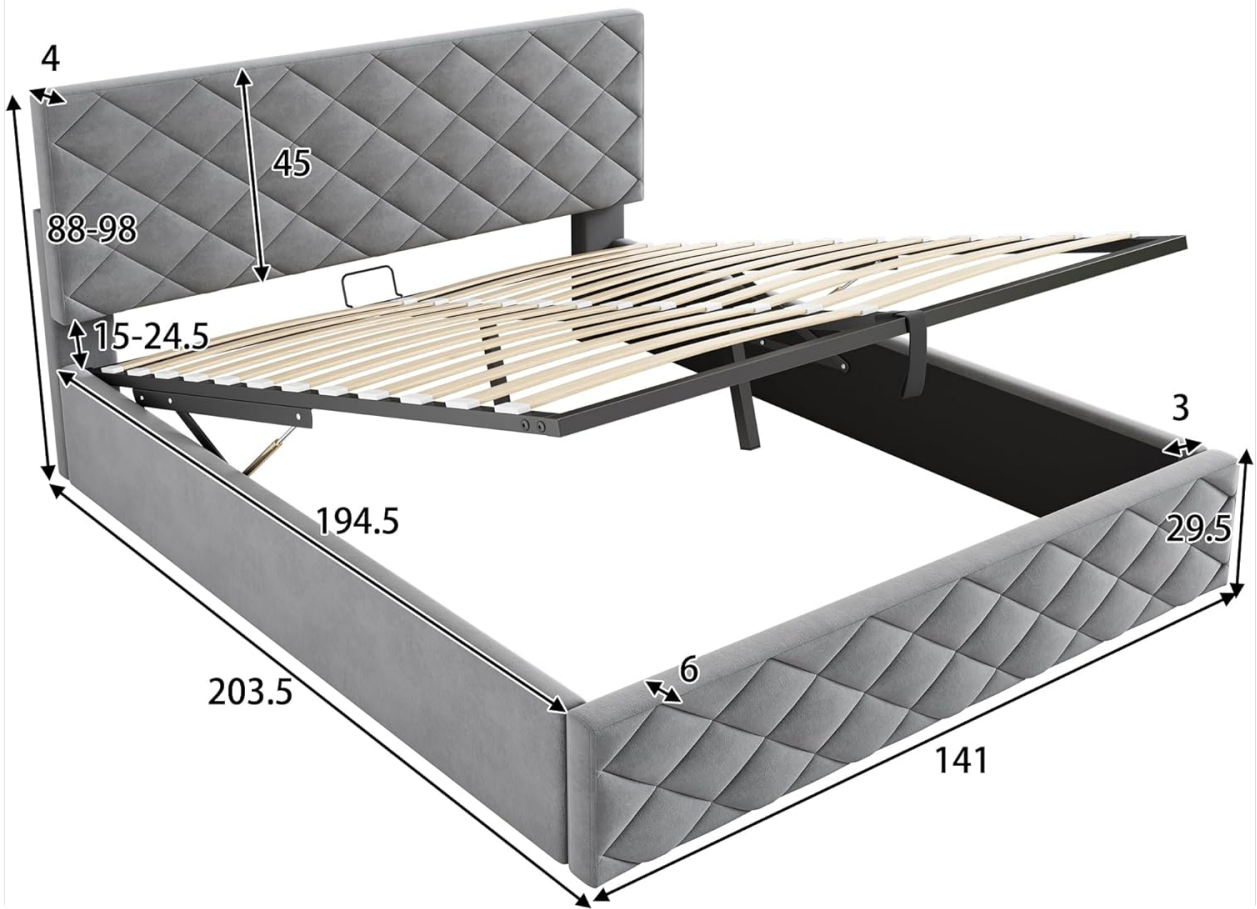
Image 4.1: Assembly diagram with key dimensions and components of the bed frame and hydraulic lift system.