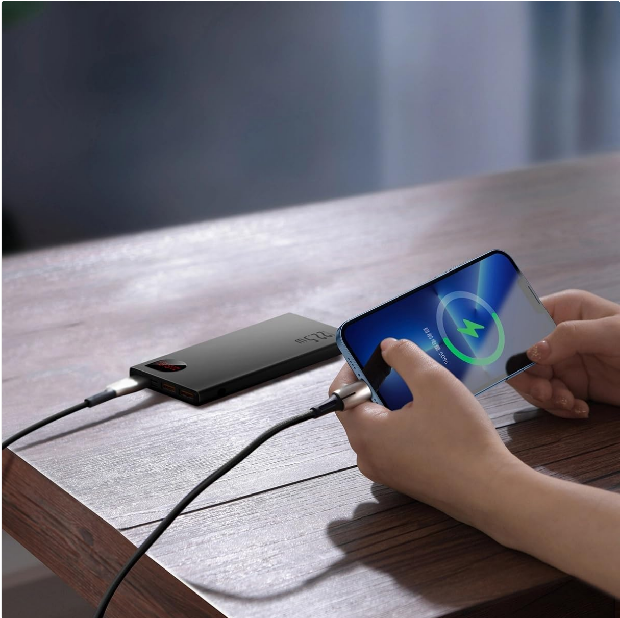
Image: A smartphone being charged by the Baseus Adaman Power Bank, demonstrating the device's charging capability for mobile phones.