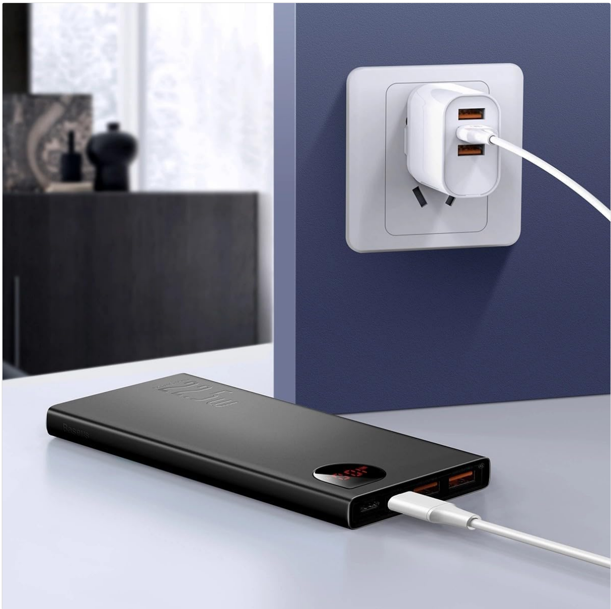
Image: The Baseus Adaman Power Bank connected to a wall charger via a USB cable, illustrating the process of recharging the power bank itself.