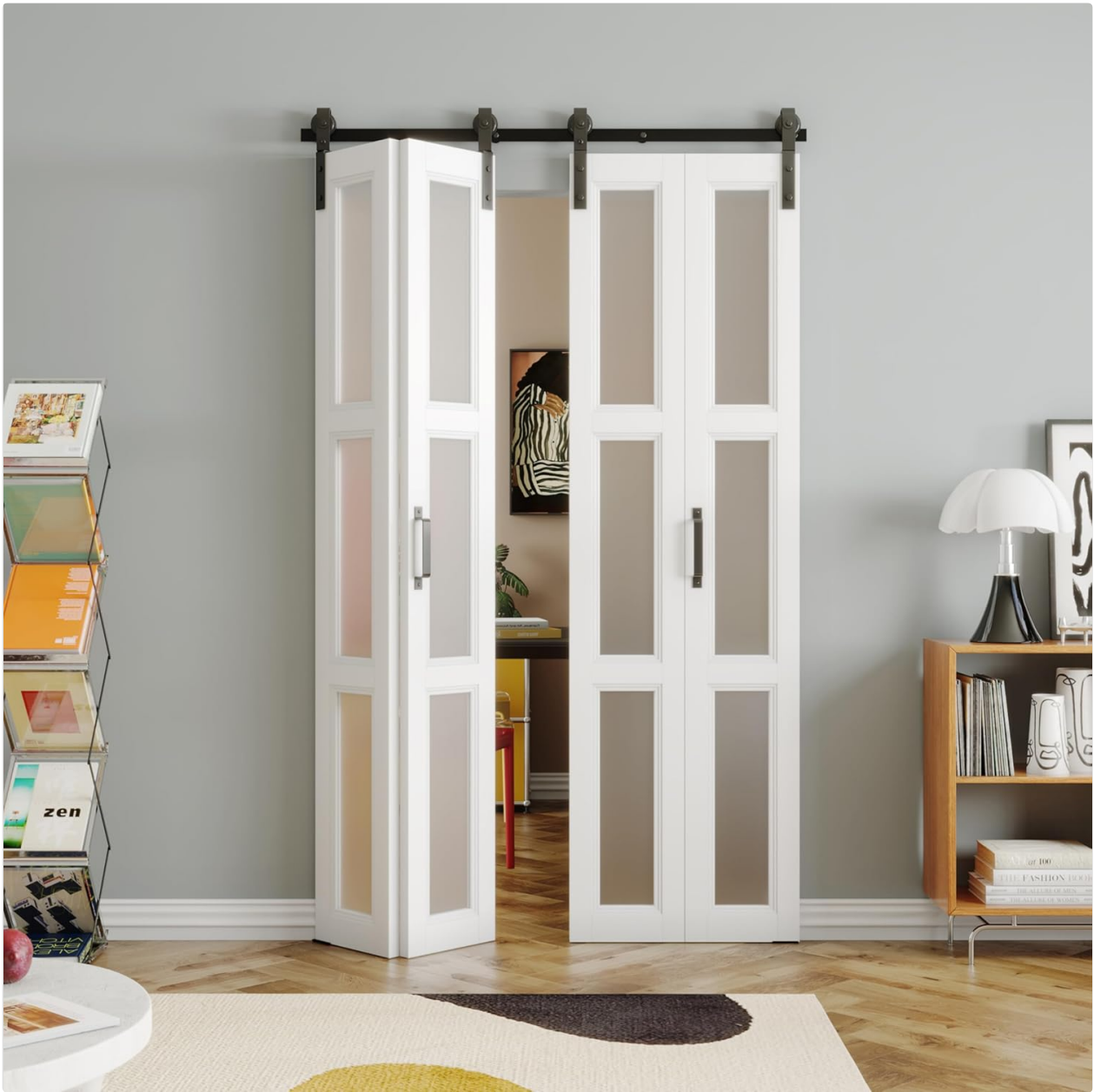
Figure 6.1: Door in partially open position