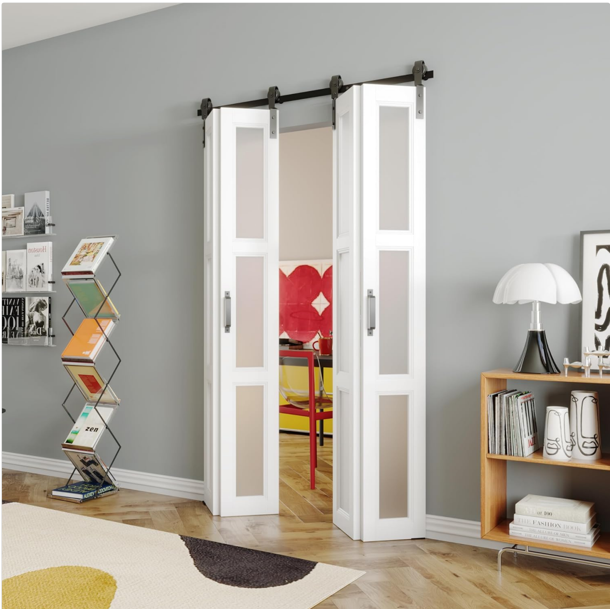
Figure 6.3: Roller Mechanism for Smooth Operation