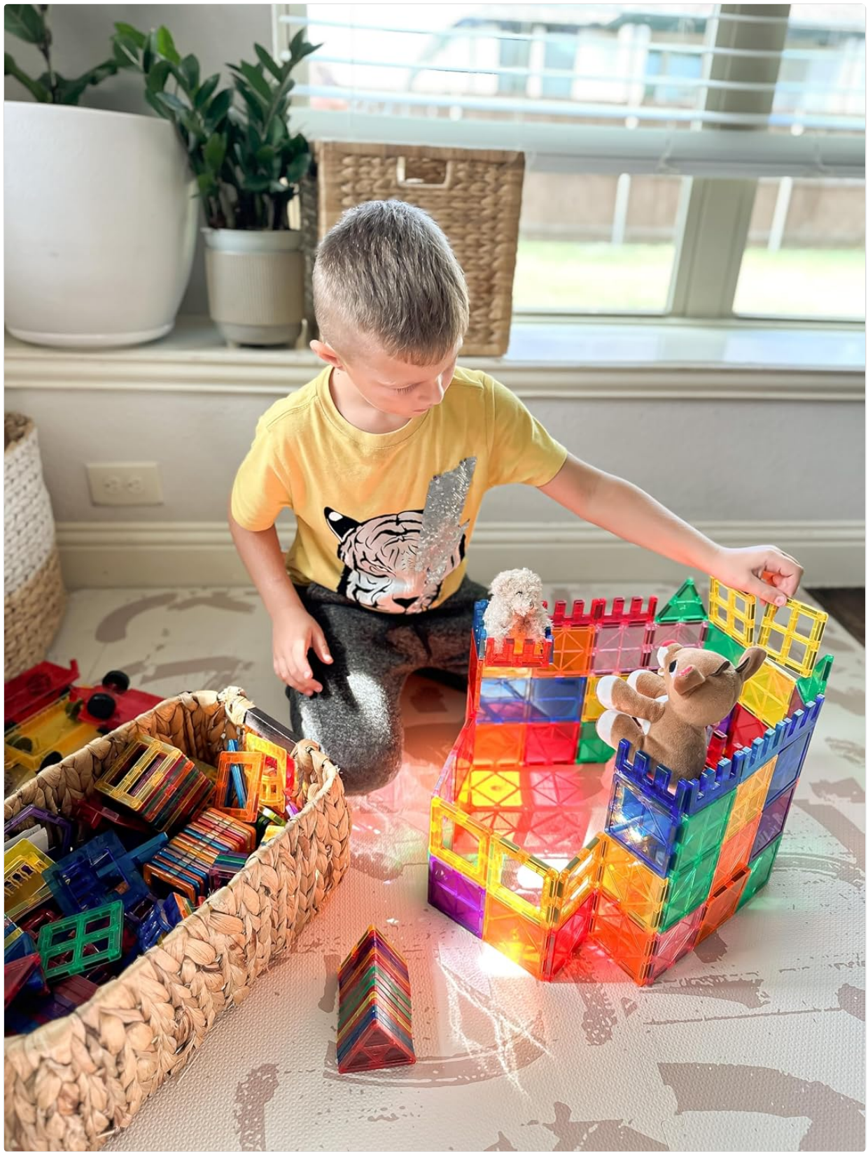
Figure 4: A child constructing a building with magnetic tiles, demonstrating imaginative play.