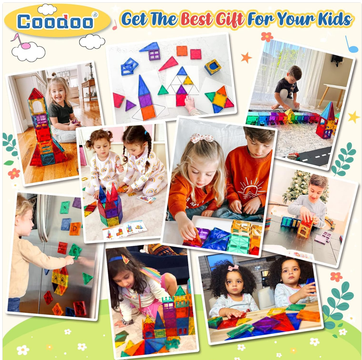
Figure 3: Children enjoying creative play with Coodoo Magnetic Building Tiles.