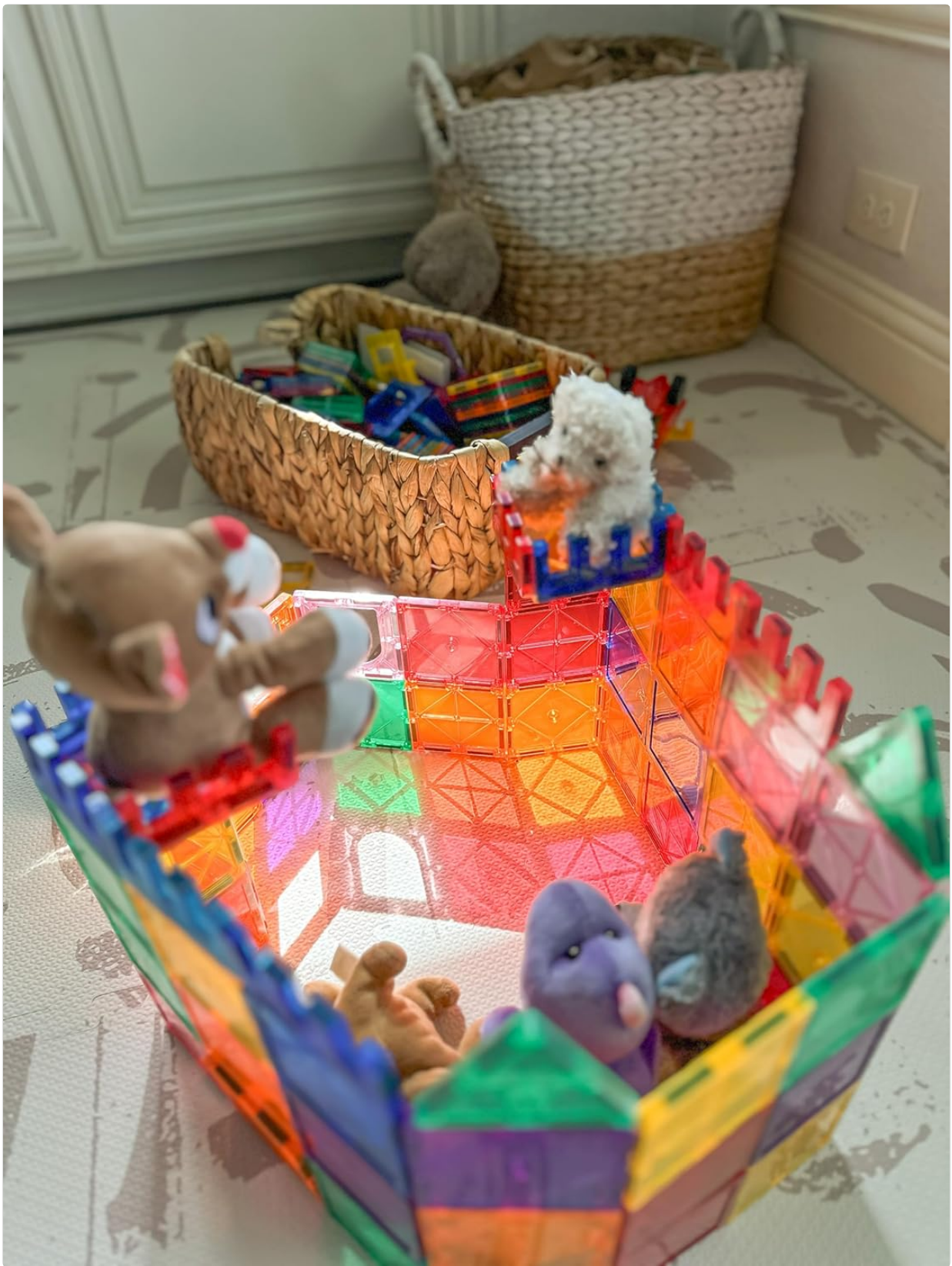
Figure 5: Magnetic tiles forming a boat, encouraging imaginative scenarios.