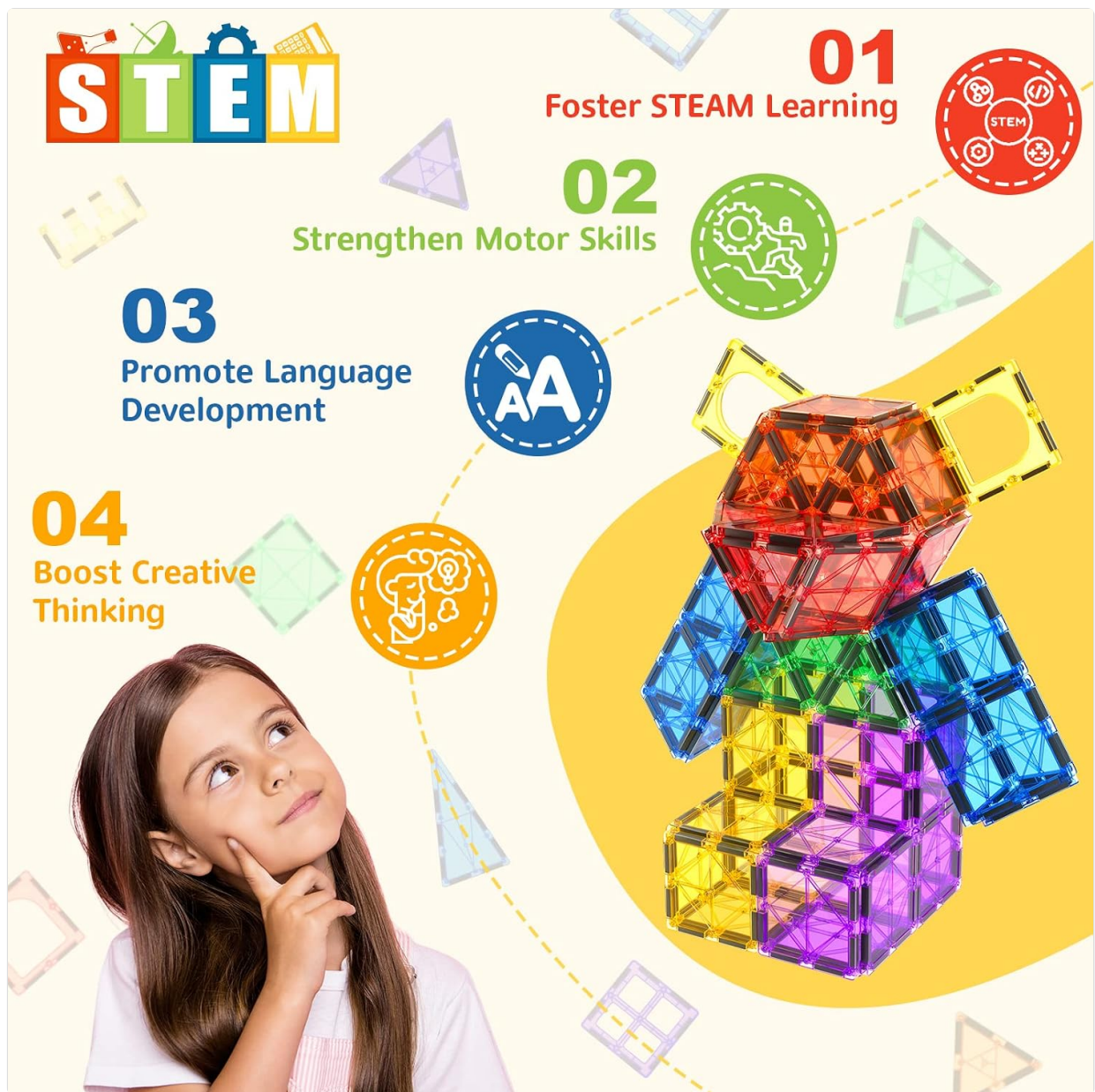
Figure 1: Coodoo Magnetic Tiles highlighting STEM learning benefits.