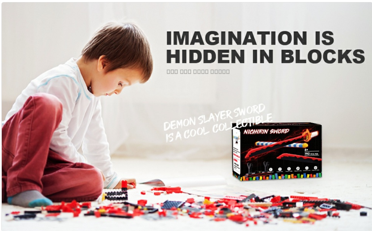
Image 5.1: The Tokitou Muichirou Sword displayed on its custom stand.