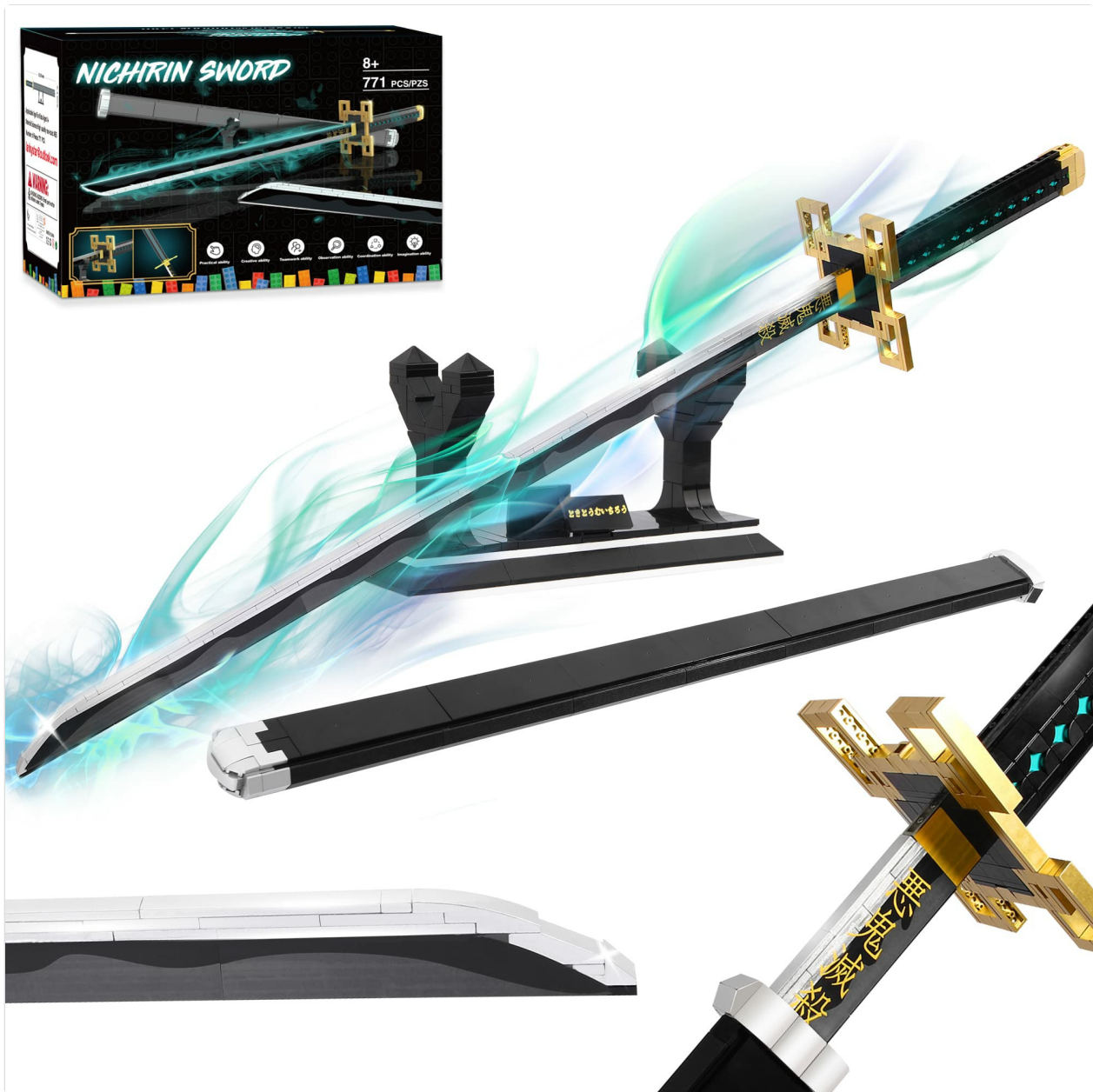
Image 1.1: The fully assembled Jorumo Tokitou Muichirou Sword with its scabbard and display stand.