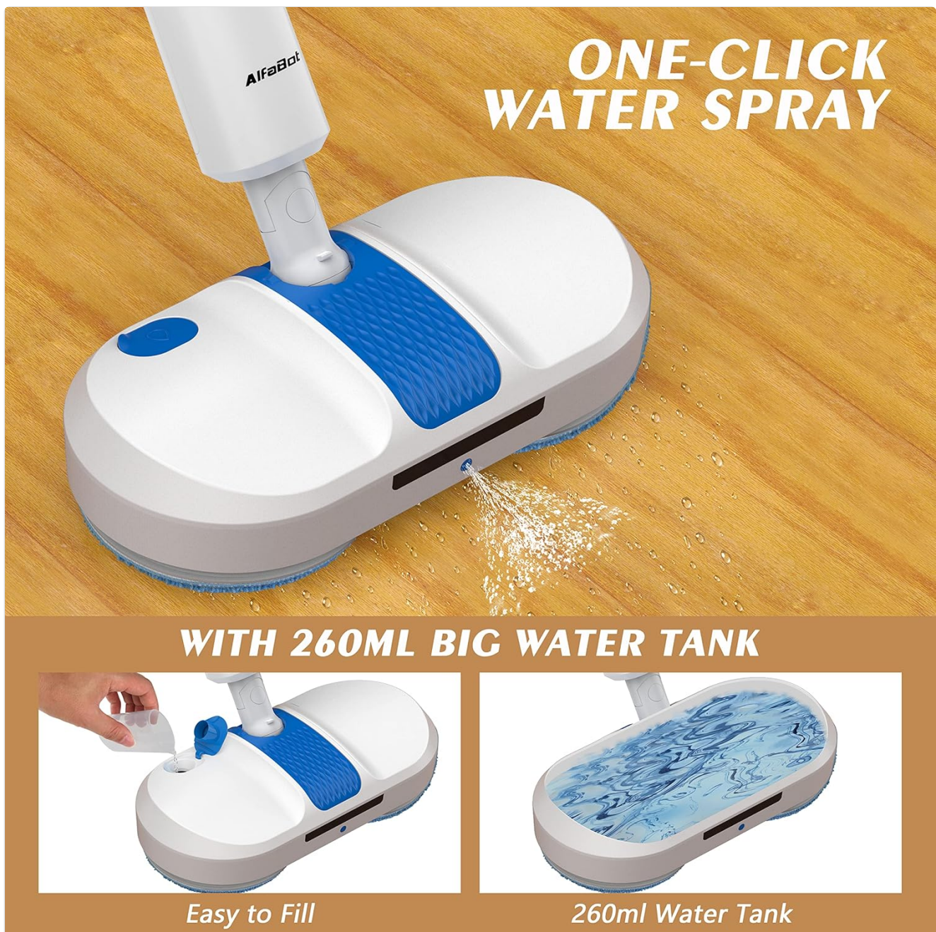
Figure 3: Filling the 260ml water tank for one-click water spray functionality.

Your browser does not support the video tag. Please update your browser to view this content.