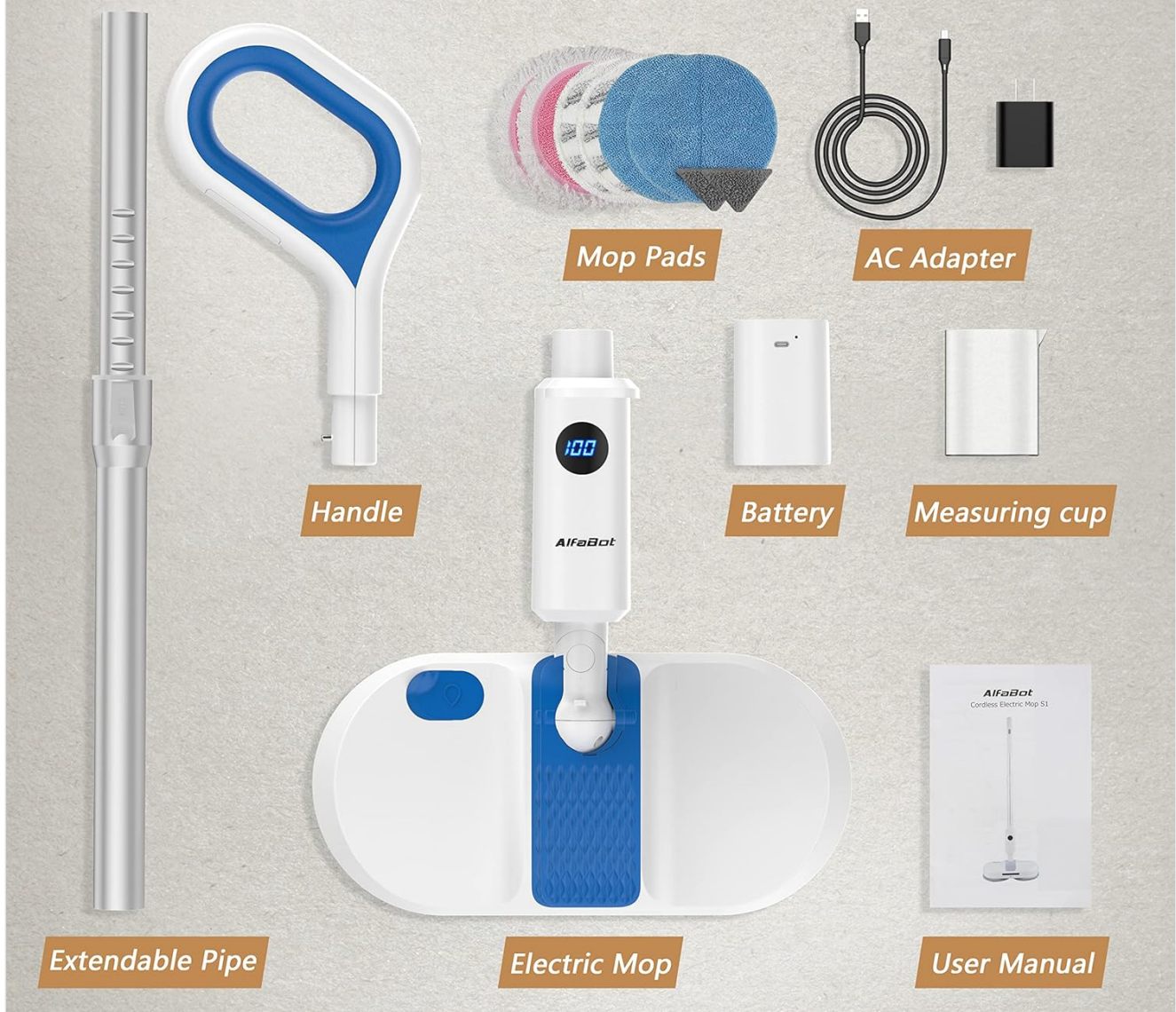
Figure 1: All components included in the AlfaBot S1 Cordless Spin Mop package.