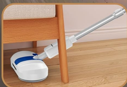
Figure 4: LED headlight for improved visibility in dark areas.