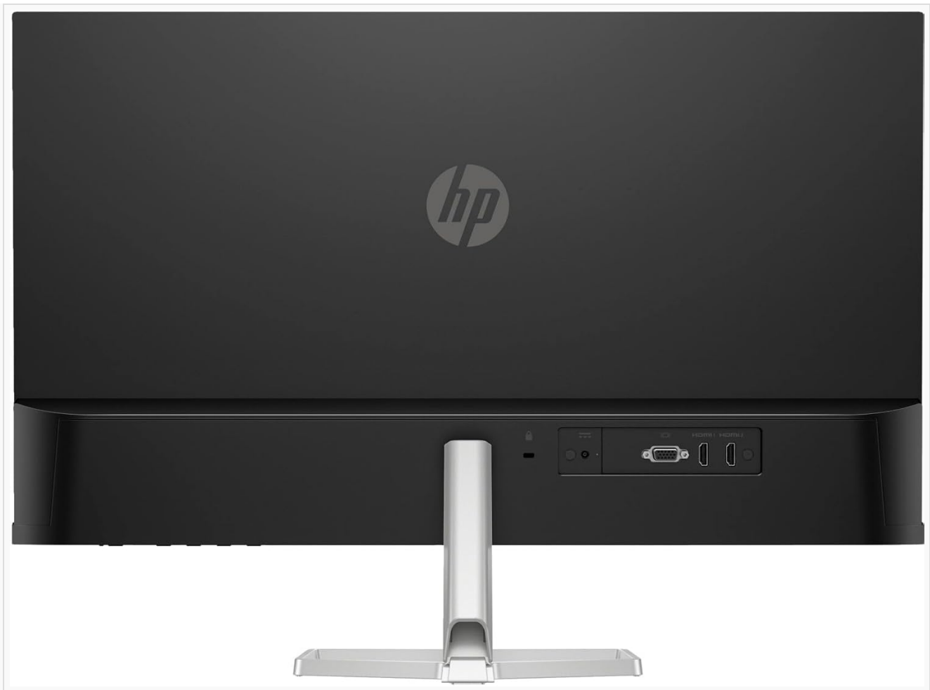
Image 3.2: Rear view of the monitor displaying the power, VGA, and HDMI ports.