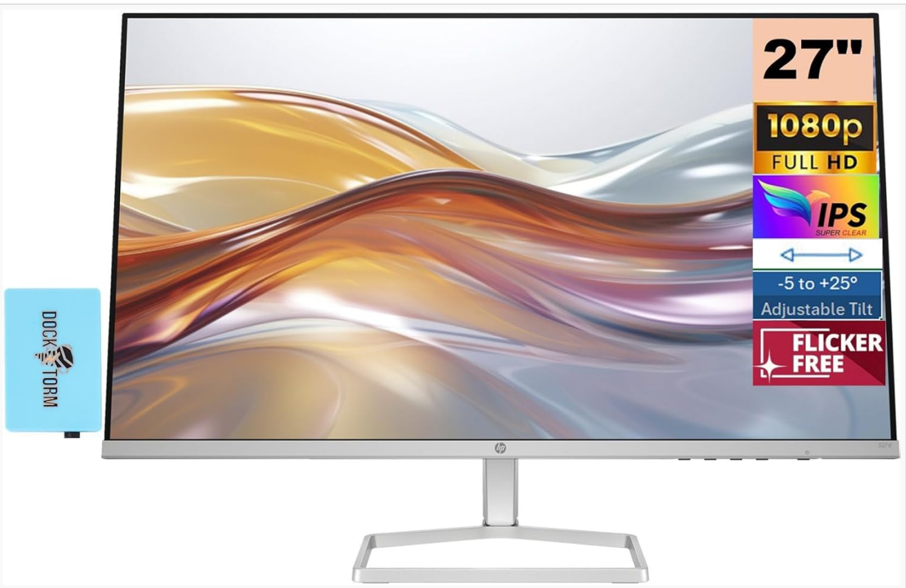
Image 2.1: Front view of the HP 27-inch monitor with the Doczform Dock.