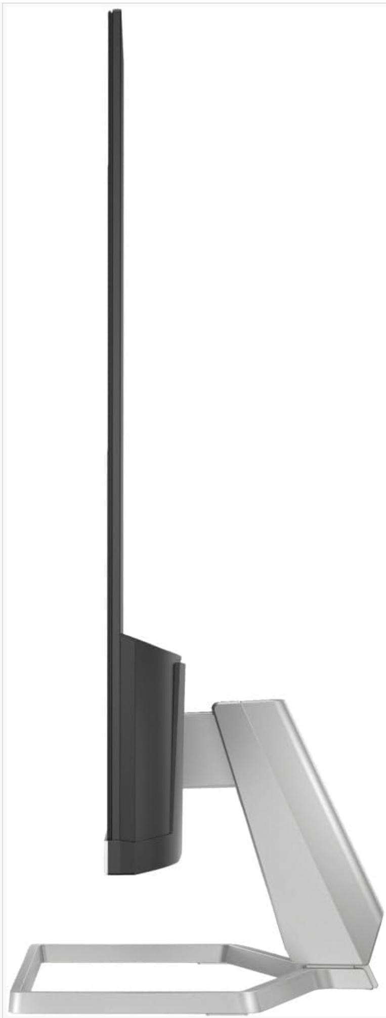
Image 4.1: Side profile of the monitor demonstrating its tilt adjustment range.