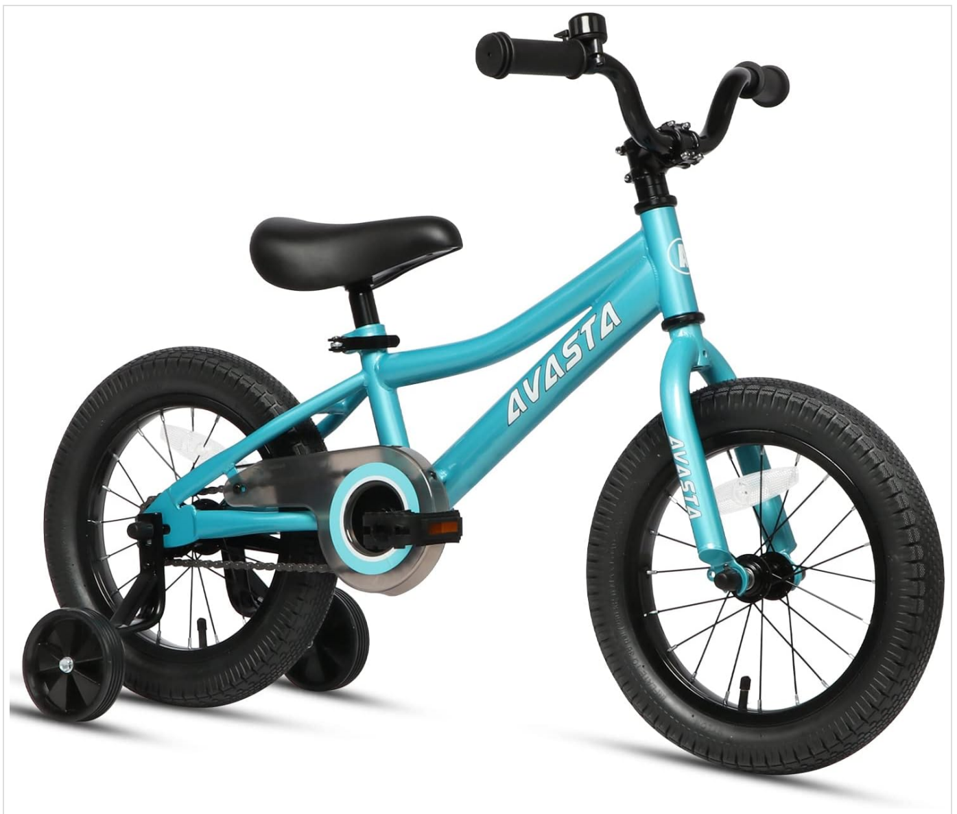
Image: The AVASTA 14-inch Kids Bike, featuring a durable frame and training wheels, in an arctic blue color.