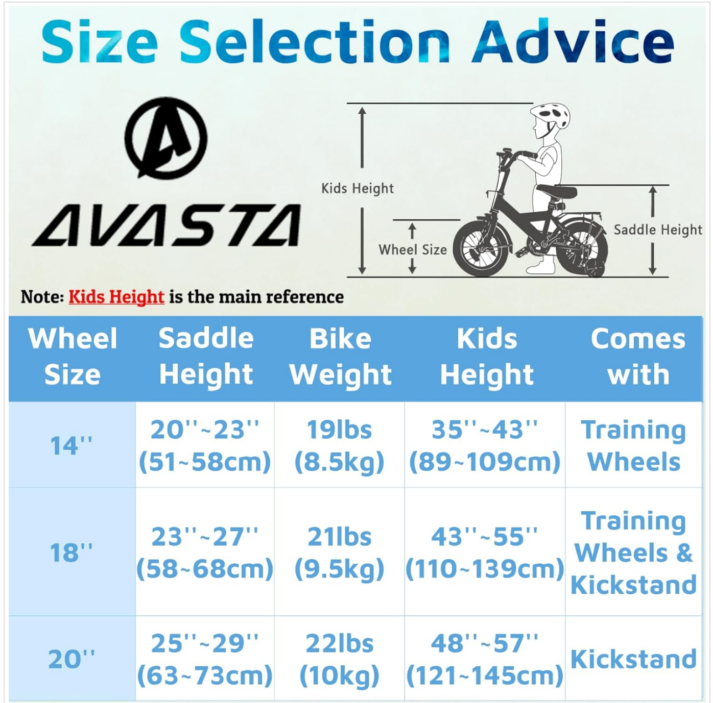
Image: A chart providing guidance on selecting the correct bike size based on wheel size, recommended saddle height, bike weight, and the child's height. Note: Kids Height is the main reference.