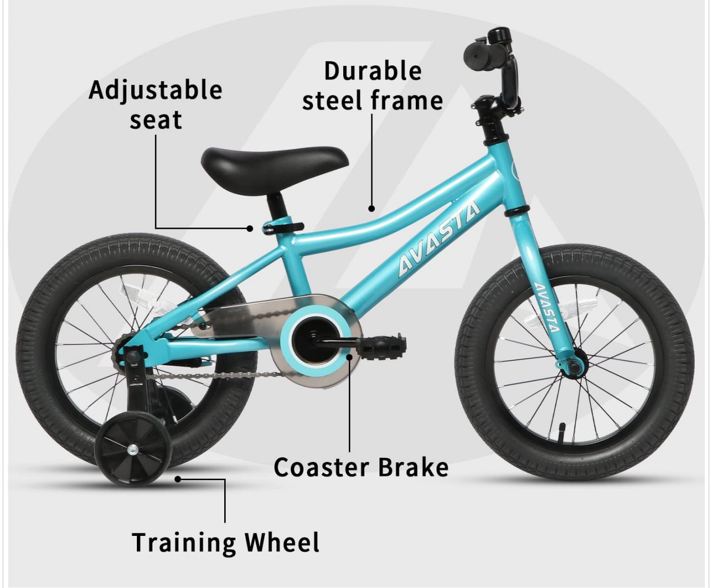
Image: The AVASTA Kids Bike with labels pointing to its adjustable seat, durable steel frame, coaster brake, and training wheels, illustrating features that allow the bike to grow with a child.