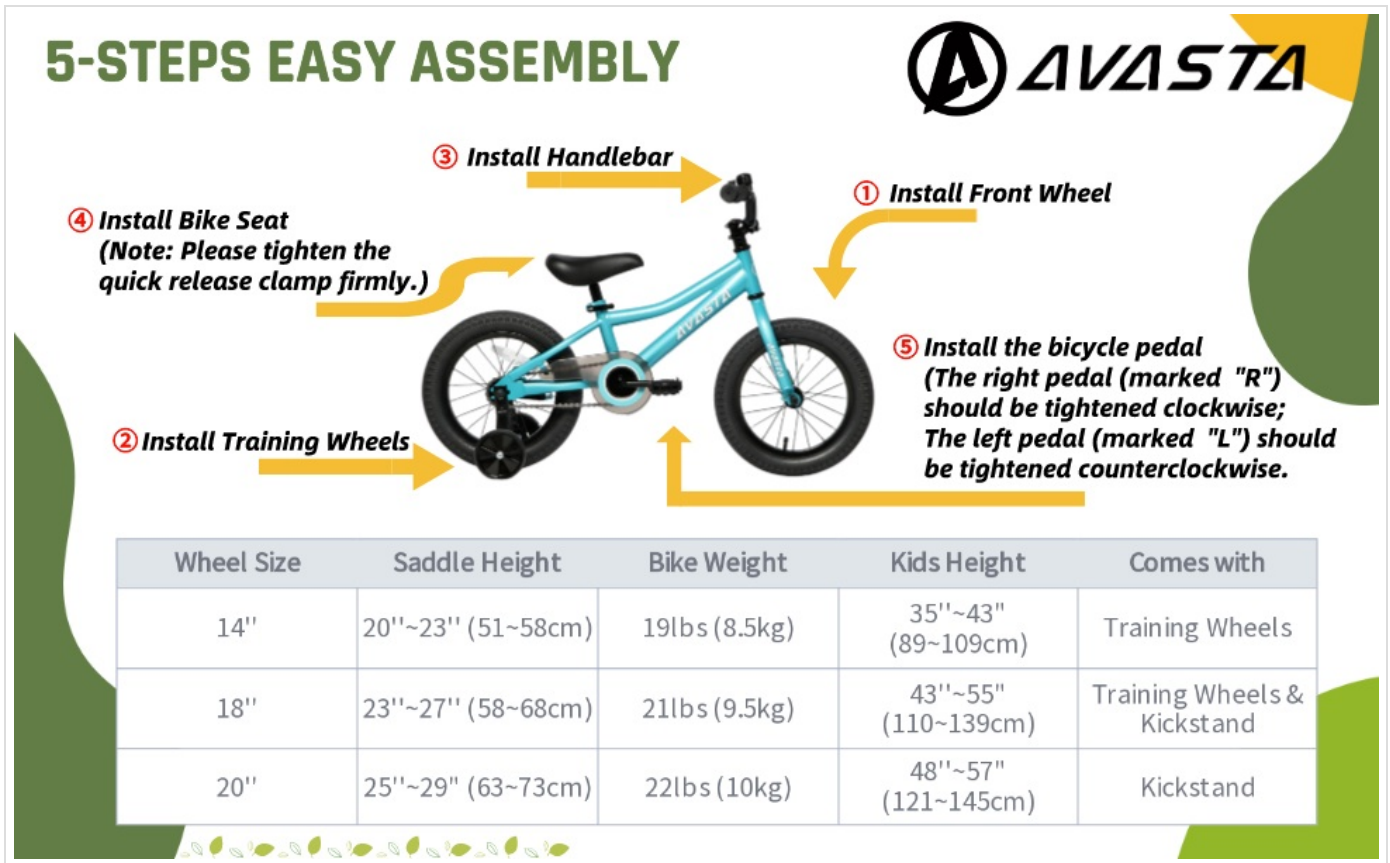
Image: A visual guide illustrating the five main assembly steps: 1) Install Front Wheel, 2) Install Training Wheels, 3) Install Handlebar, 4) Install Bike Seat, 5) Install Bicycle Pedals.