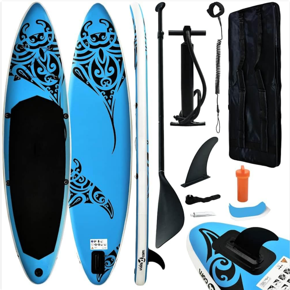
Image: The vidaXL Inflatable SUP board ready for use.

4. Falling Off: If you fall, try to fall away from the board. The leash will keep the board close. Climb back on by grabbing the handle and kicking your legs to propel yourself onto the board.