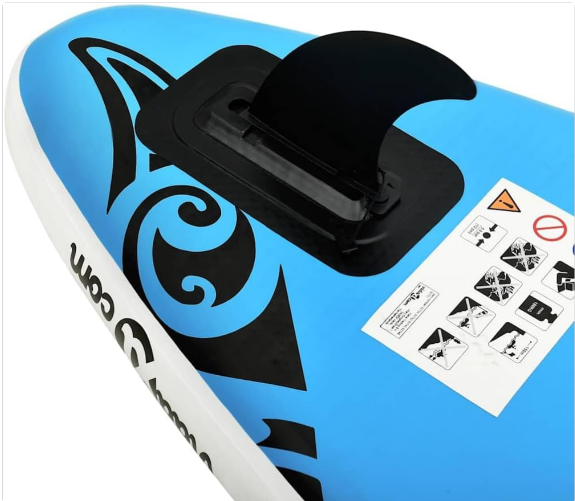
Image: Removable fin installation.