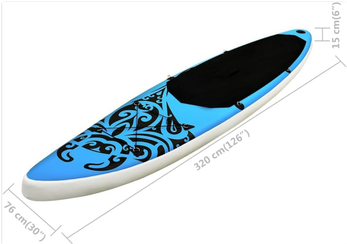
Image: Dimensions of the vidaXL Inflatable SUP board.