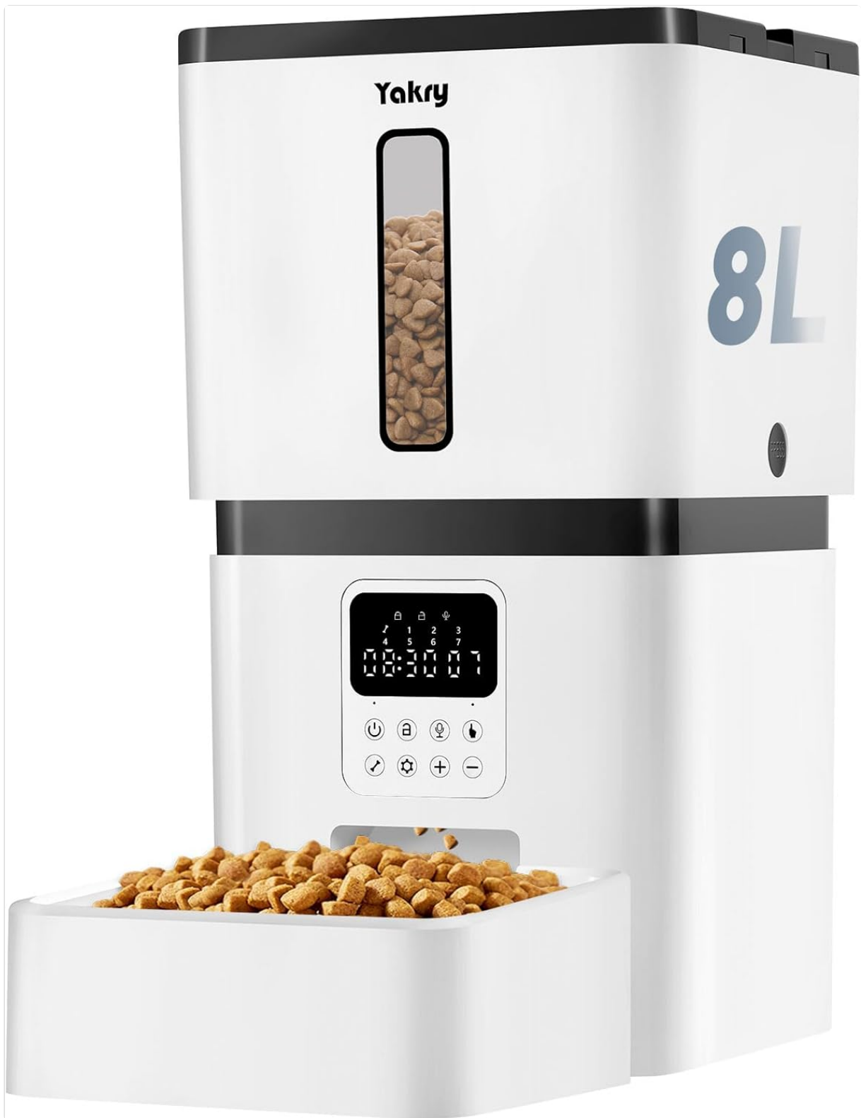
Figure 1: Yakry Automatic Pet Feeder