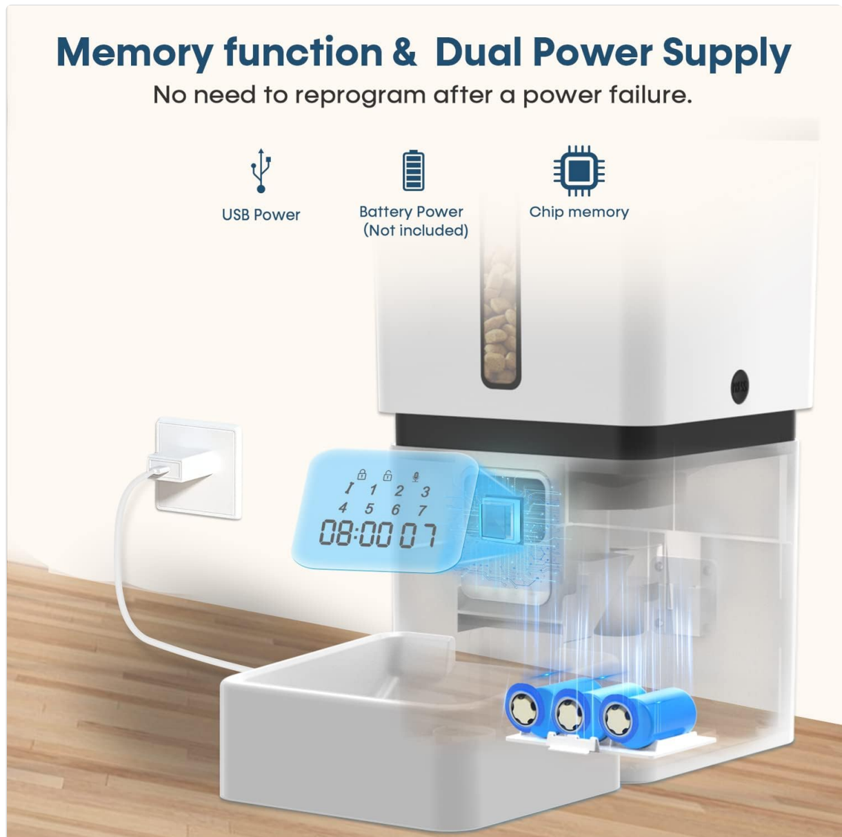
Figure 2: Dual Power Supply and Memory Function