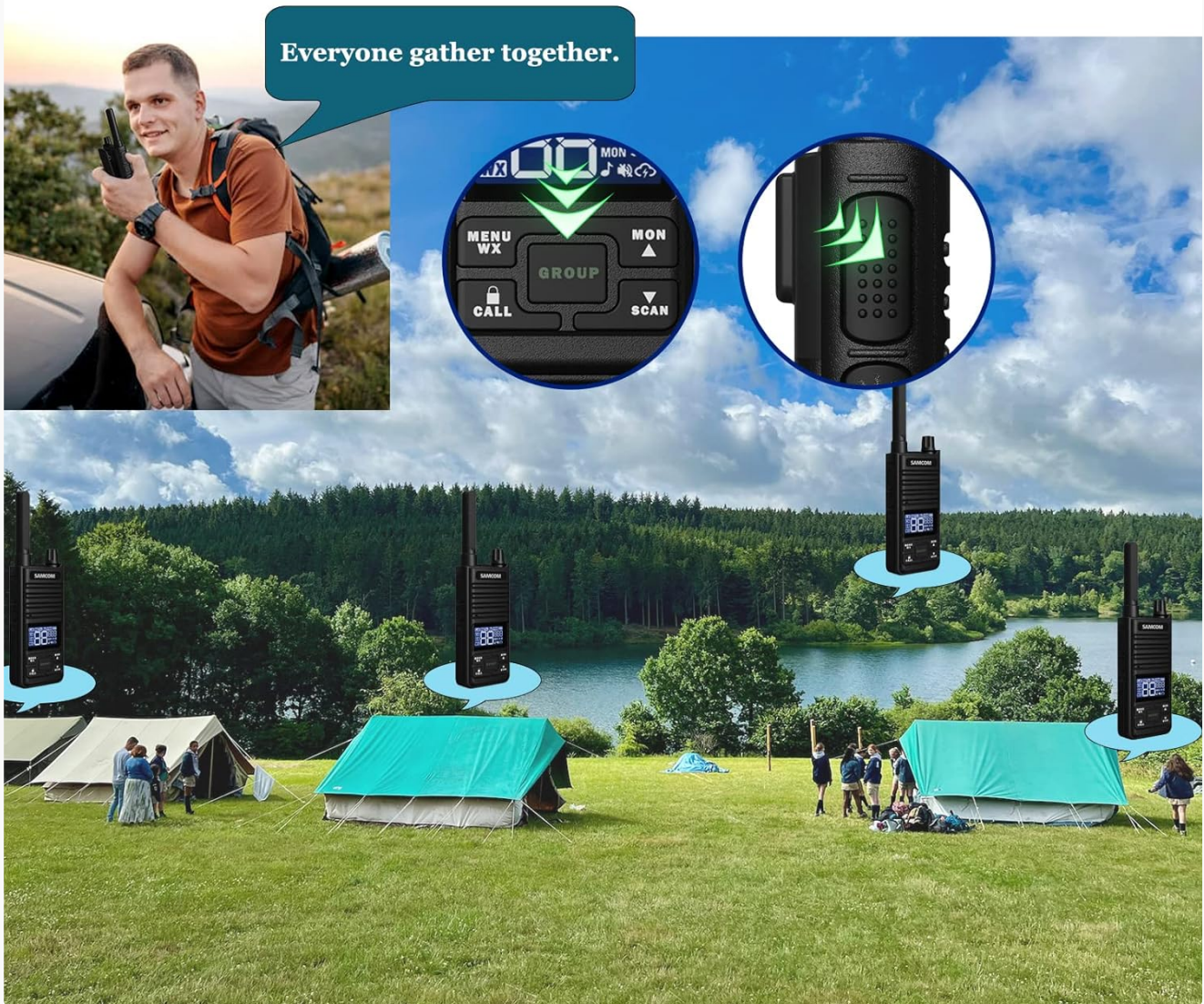
Image: Illustration of the Group function, enabling multiple users to communicate simultaneously across different channels, useful for team activities.