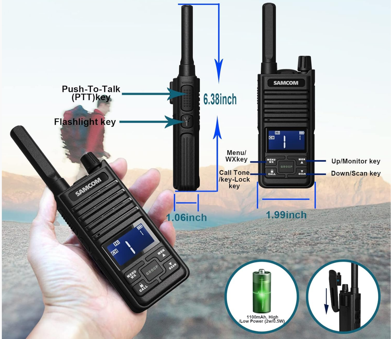
Image: The compact size of the walkie talkie, highlighting the location of the Push-To-Talk (PTT) button, flashlight key, and other control buttons.