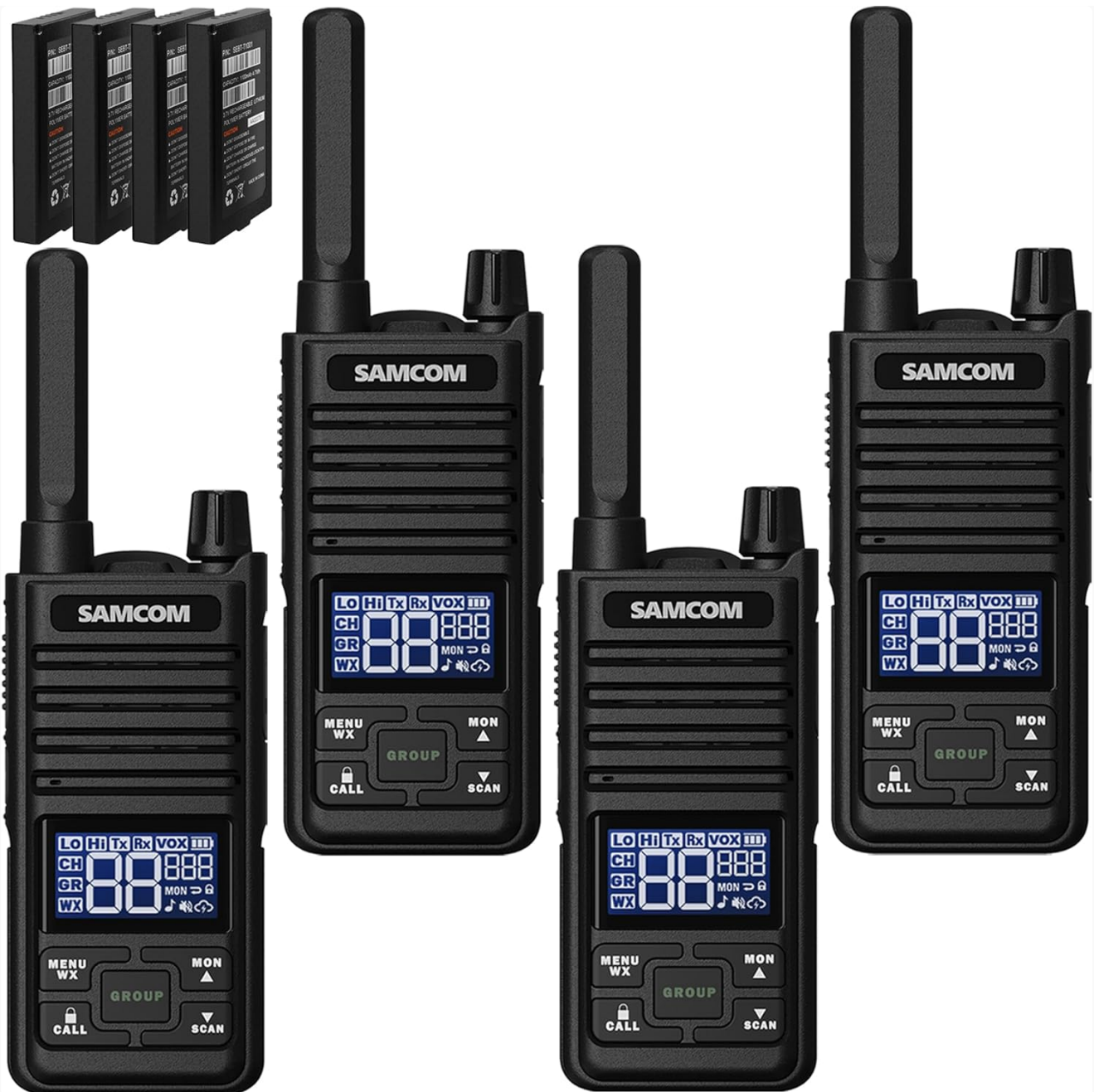
Image: Four SAMCOM T2 GMRS Walkie Talkies, showcasing the compact design and included batteries.