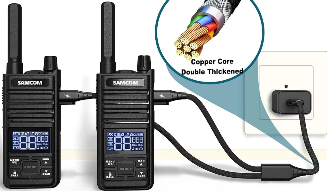
Image: Various charging options for the walkie talkies, including laptop, car charging, power bank, and wall charging, highlighting the durable USB-C cable.