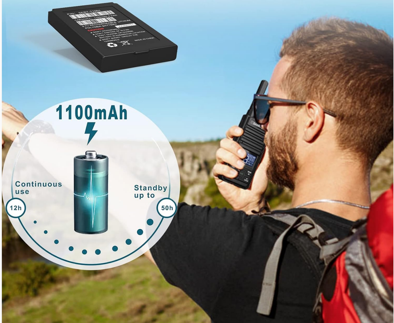
Image: The detachable 1100mAh Lithium Polymer battery, illustrating its capacity and estimated usage times for continuous operation and standby.