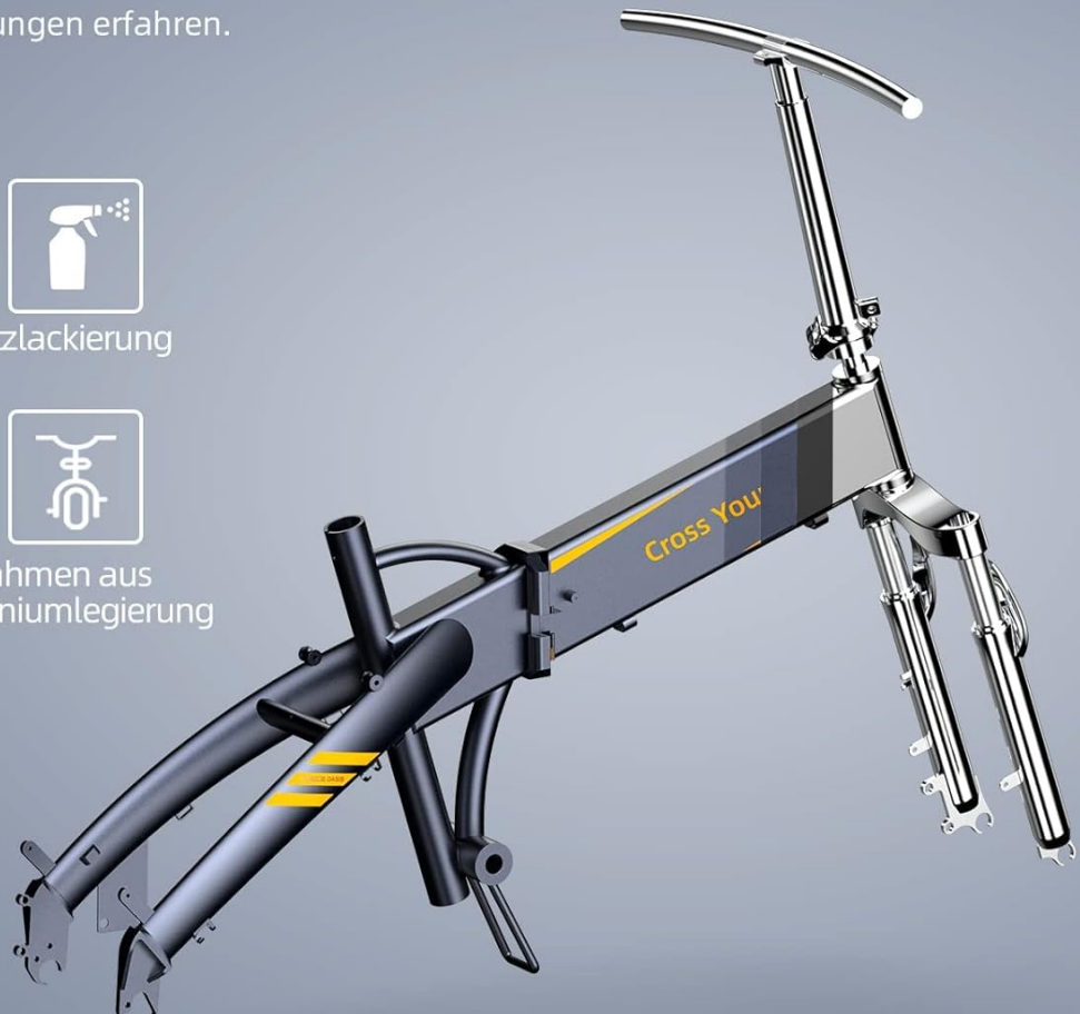
Figure 2.1: Illustration of the bike's aluminum alloy frame and the multi-layer paint process, emphasizing durability and quality.