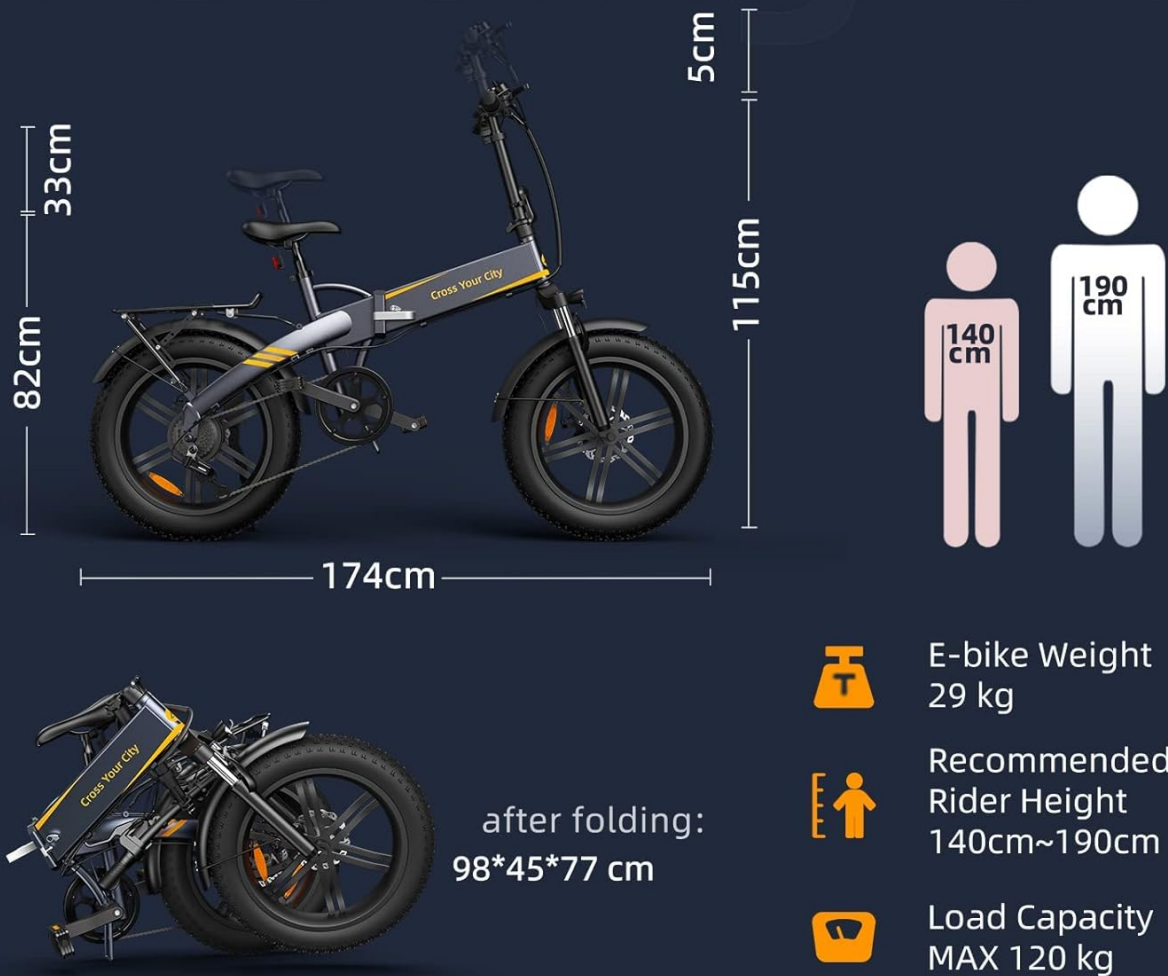
Figure 6.1: Product dimensions, including height and length, along with key specifications such as bike weight, recommended rider height range, and maximum load capacity.