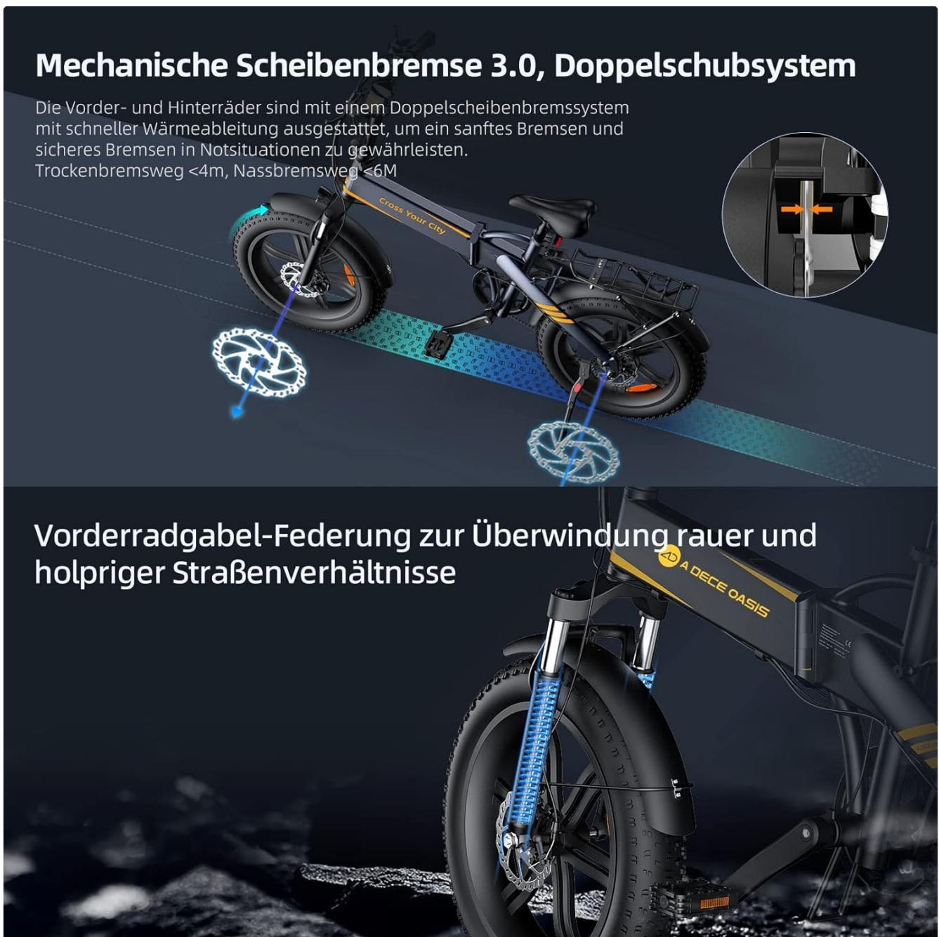
Figure 5.1: Illustration of the mechanical disc brake 3.0 with dual-push system and the front fork suspension, designed for effective braking and comfortable riding over rough terrain.