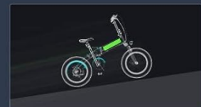
Figure 3.1: Detailed view of the 250W powerful motor and the Shimano 7-speed gearbox, illustrating the bike's propulsion system.