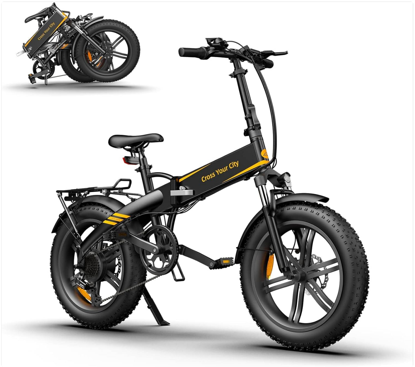
Figure 1.1: The ADO A20F XE electric bike shown in both its unfolded and compact folded states, highlighting its portability.