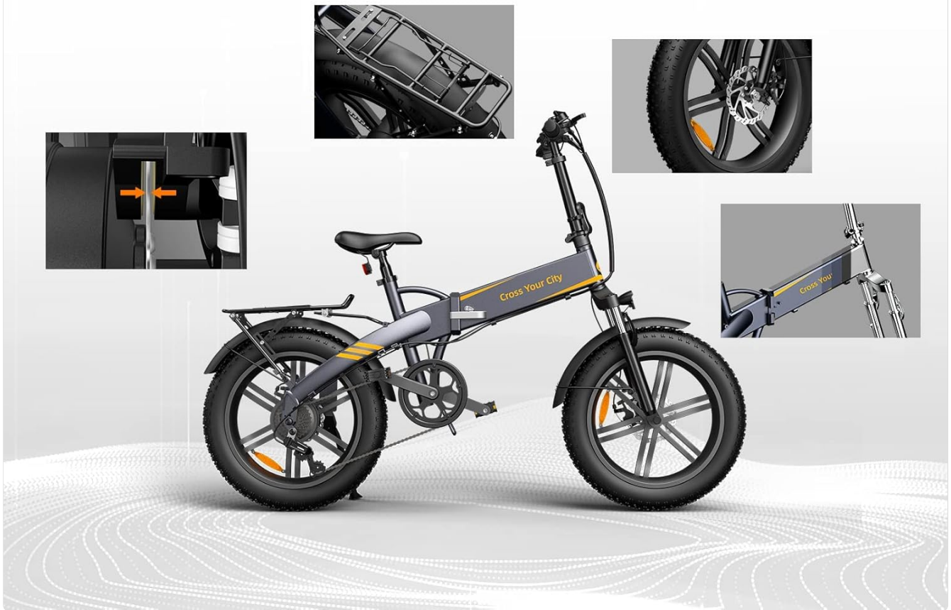
Figure 1.2: Key features of the ADO A20F XE, including its upgraded paint finish, 20x4.0-inch fat tires, iron fenders, rear rack, and mechanical disc brake system.