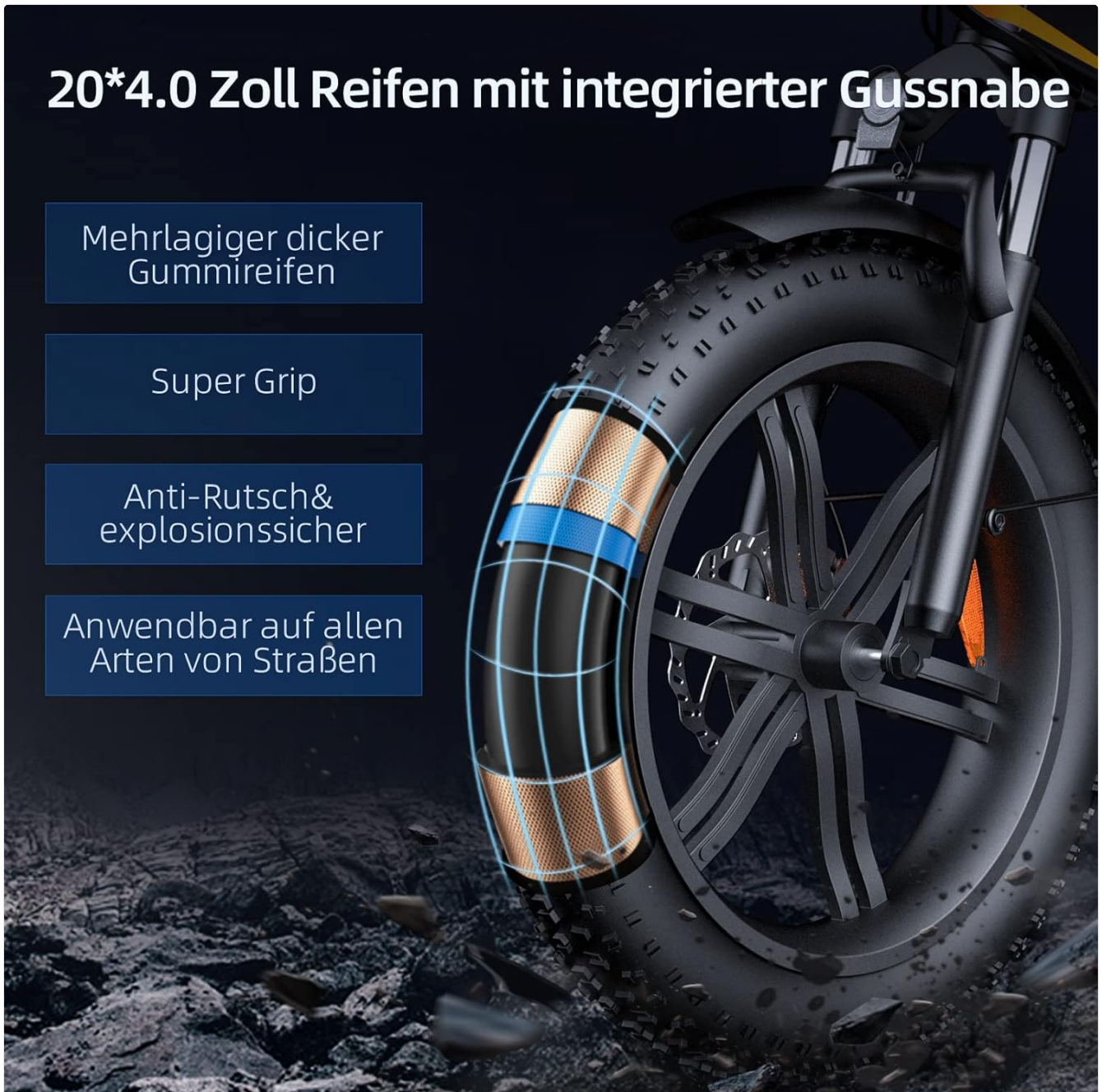
Figure 4.1: Close-up of the 20x4.0 inch multi-layer thick rubber fat tire with integrated cast hub, highlighting its super grip and anti-slip, explosion-proof features suitable for all road types.