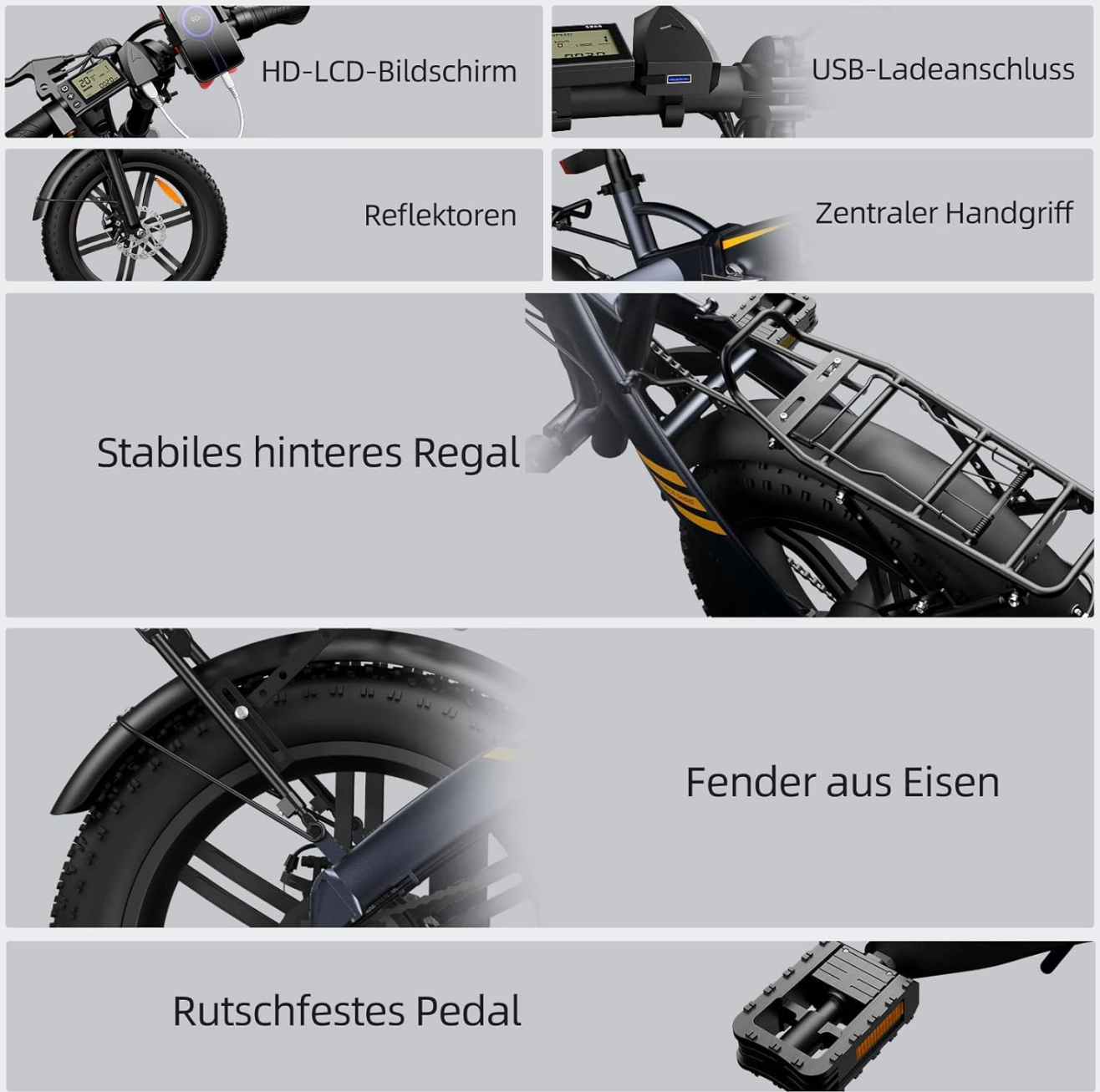
Figure 3.2: Various components including the HD-LCD display, USB charging port, stable rear rack, iron fenders, and anti-slip pedals.