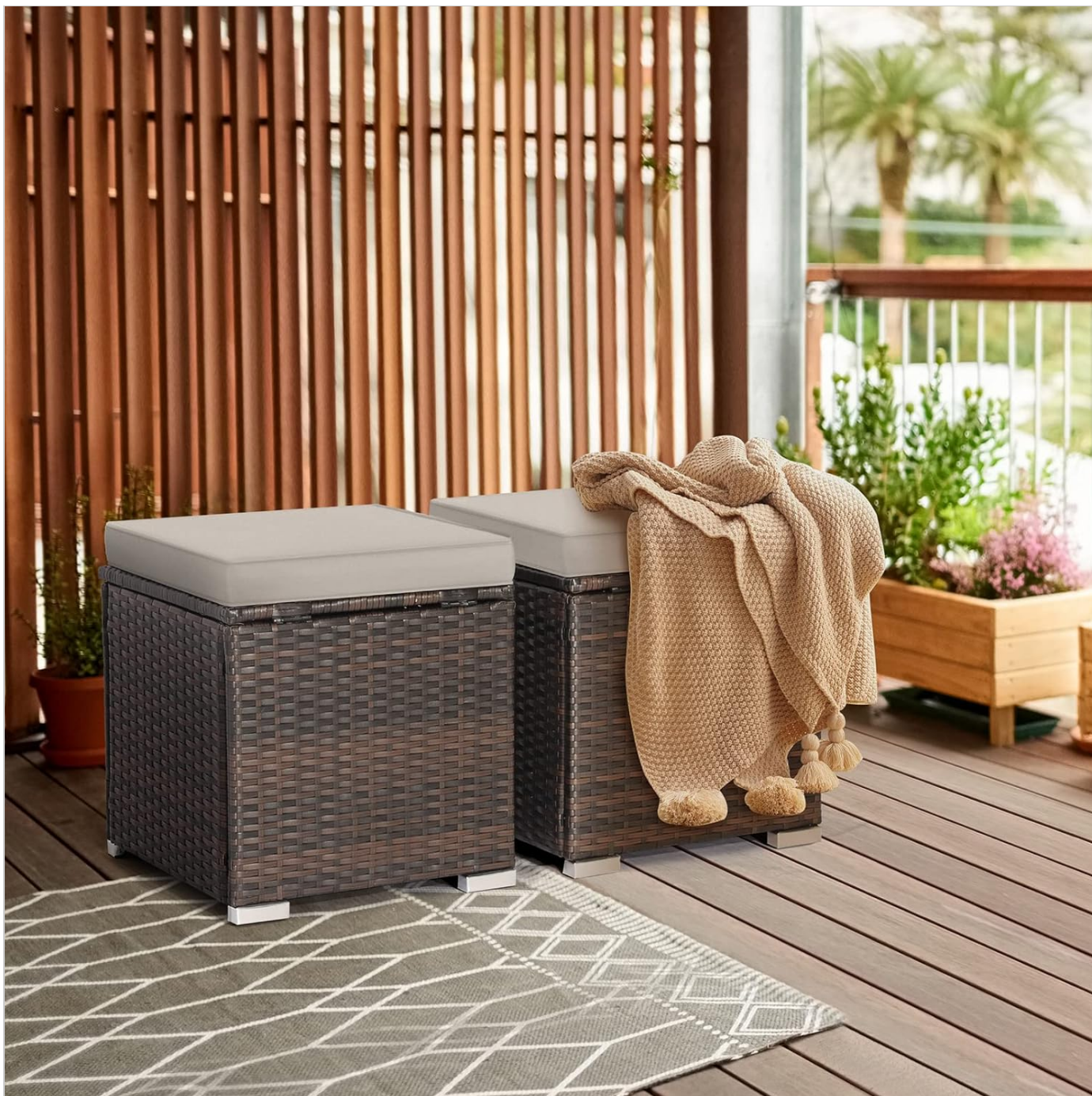
Image: Two RELAX4LIFE wicker outdoor storage ottomans with beige cushions are shown on a wooden patio deck, accompanied by a knitted blanket. The setting suggests outdoor use and comfort.