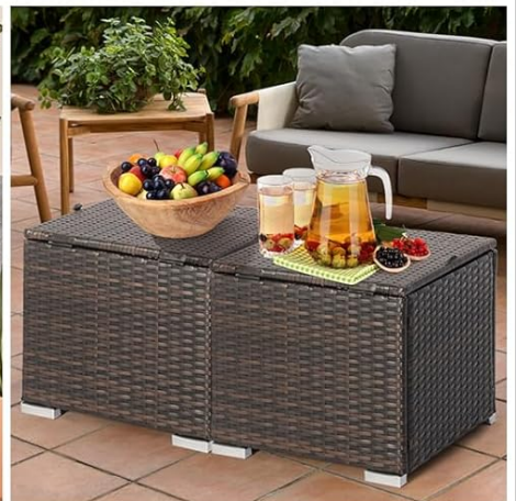
Extra Side Tables

Image: A collage demonstrating the versatile uses of the ottoman, including its function as additional seating, a comfortable footrest, and an extra side table when the cushion is removed.