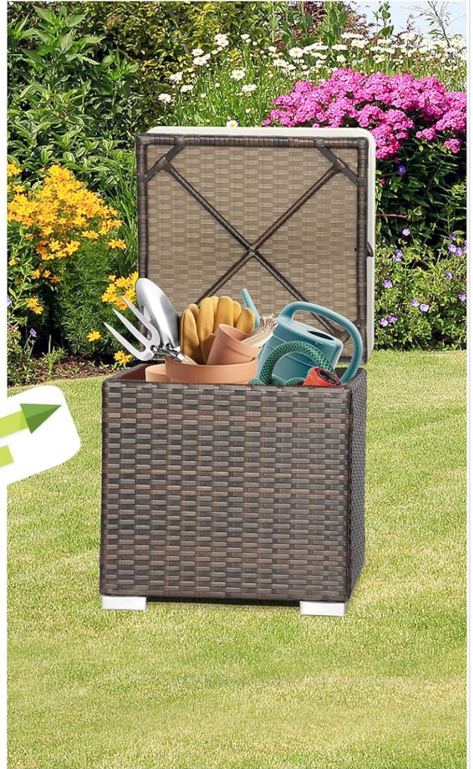
Image: An ottoman with its top lid open, showcasing the hidden storage compartment. The compartment contains various items like gardening tools, demonstrating its utility for organizing outdoor essentials.