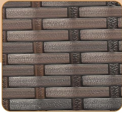
Fade-resistant Mix Brown PE Wicker