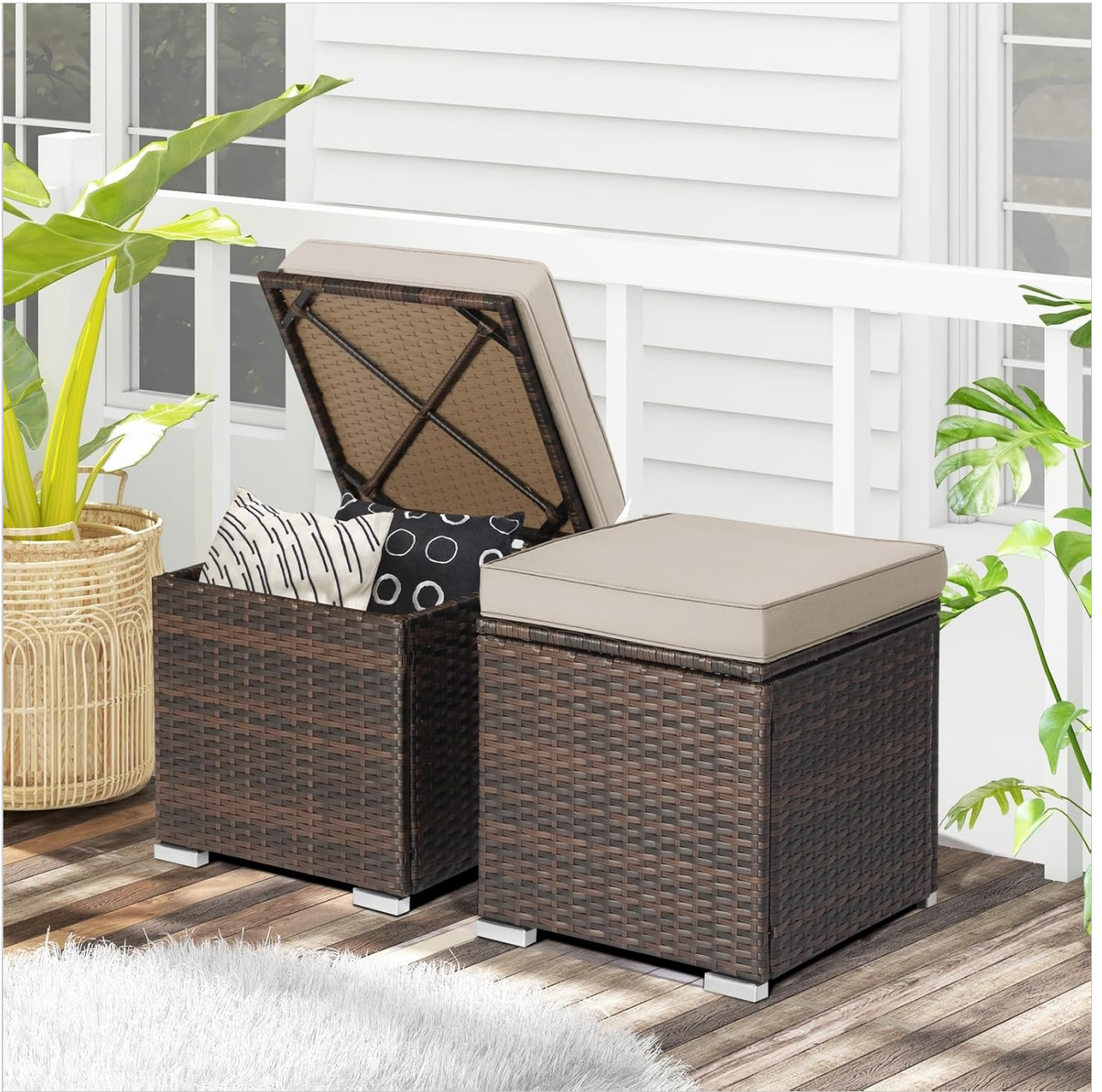
Image: Two wicker ottomans positioned on an outdoor deck. One ottoman is closed with its cushion, while the other is open, revealing stored pillows inside, illustrating the hidden storage feature.