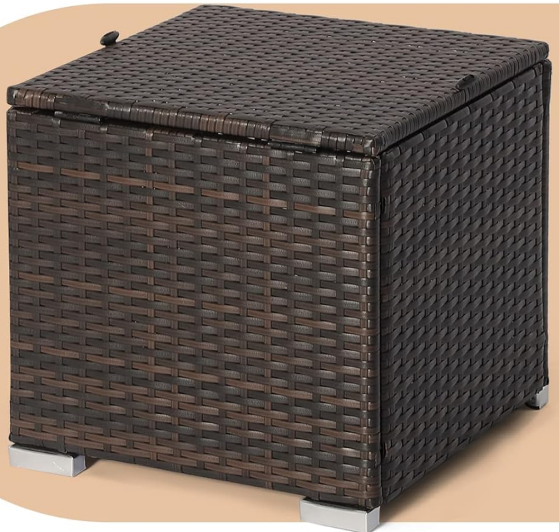
Image: Detailed views of the ottoman's construction, showing the fade-resistant mix brown PE wicker, the flexible hinge mechanism for the lid, and the raised feet designed to prevent direct ground contact.