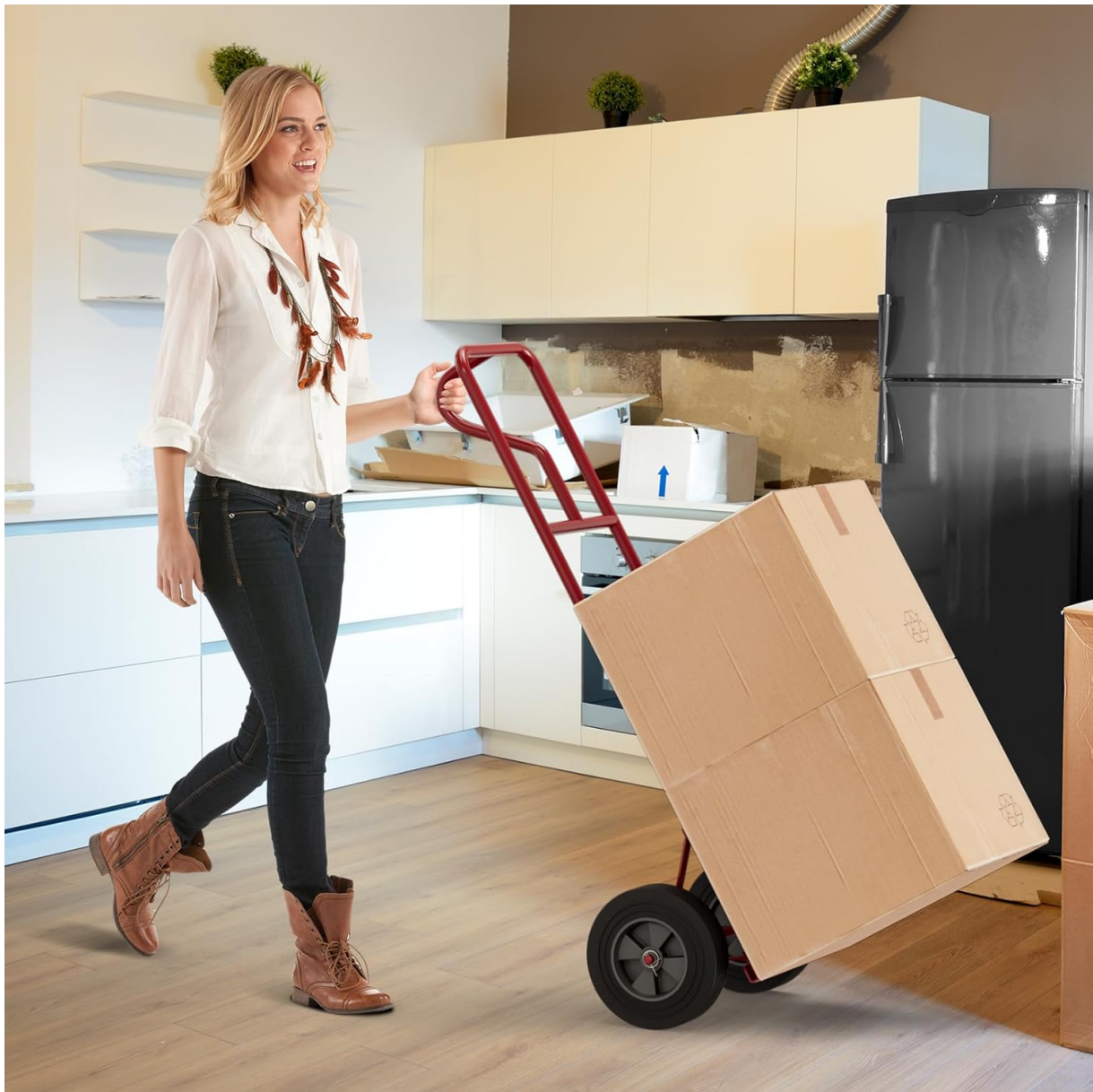
Figure 4: Moving items with the hand truck.