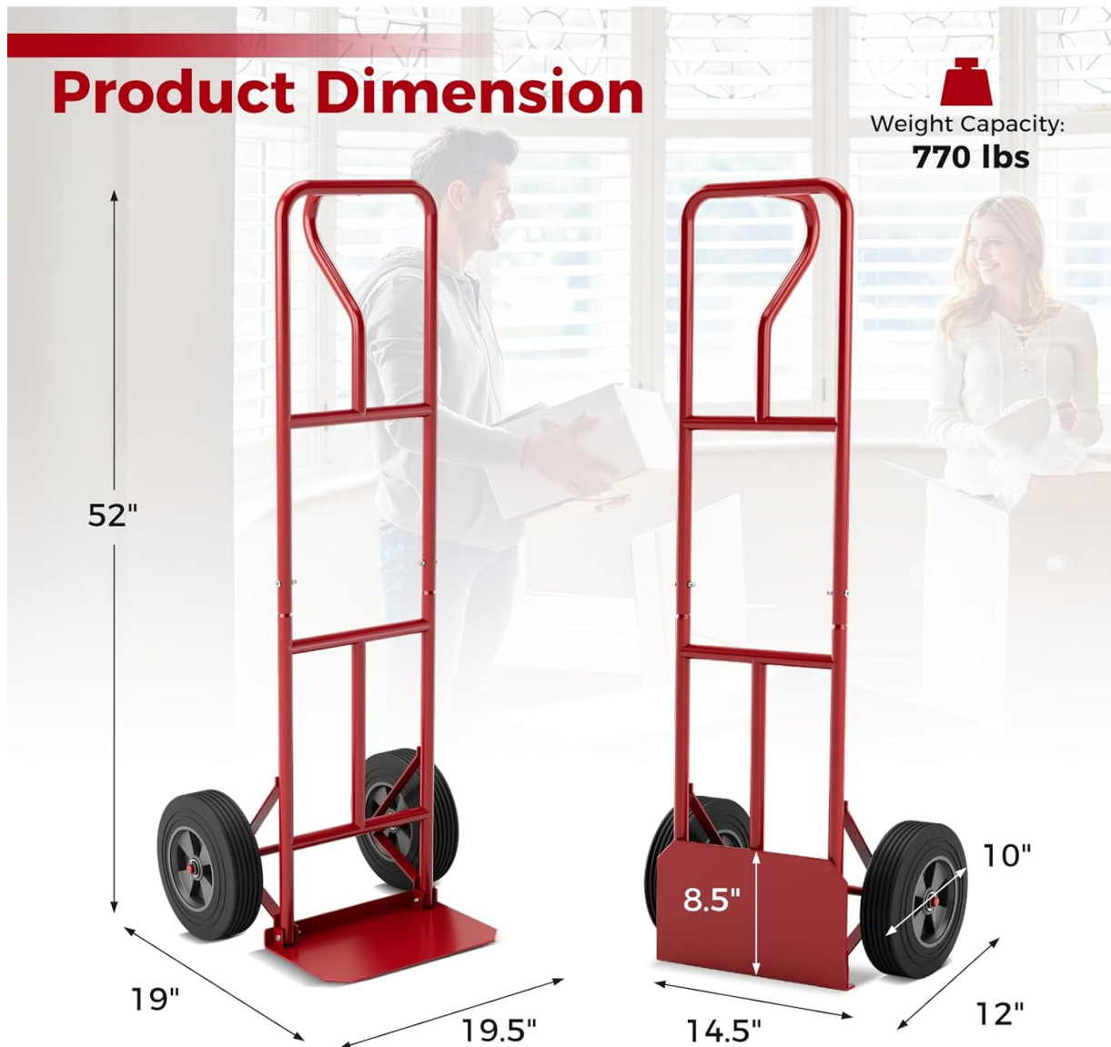
Figure 1: Key components and dimensions of the Goplus P-Handle Hand Truck.