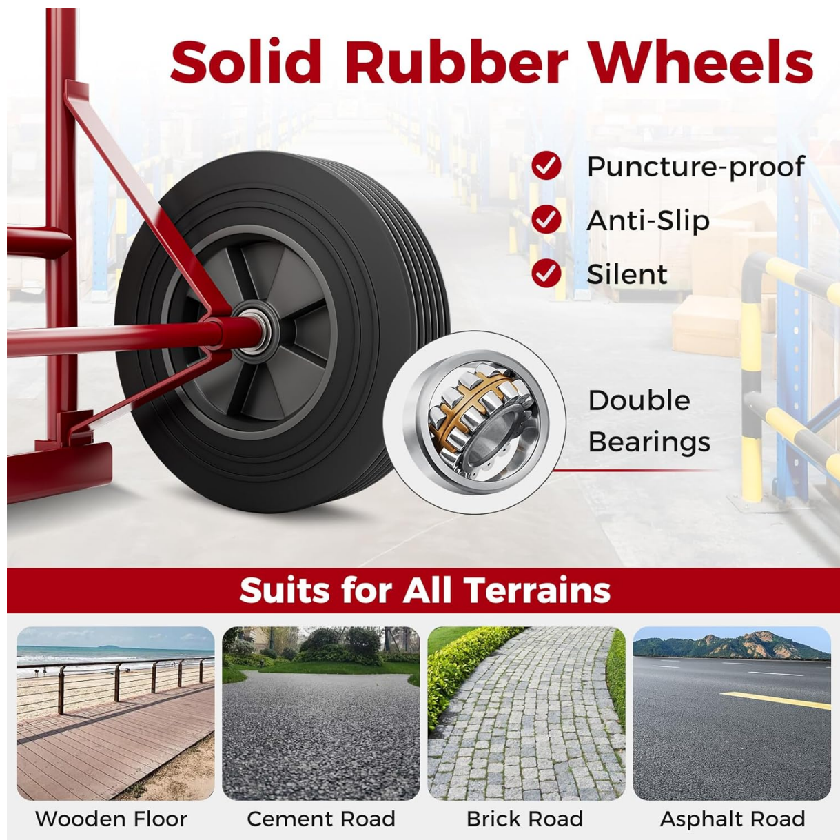
Figure 5: Features of the durable rubber wheels.