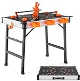
Figure 6: Detailed product specifications.