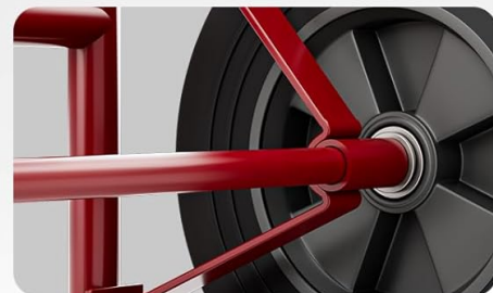
Galvanized Axle Pipe