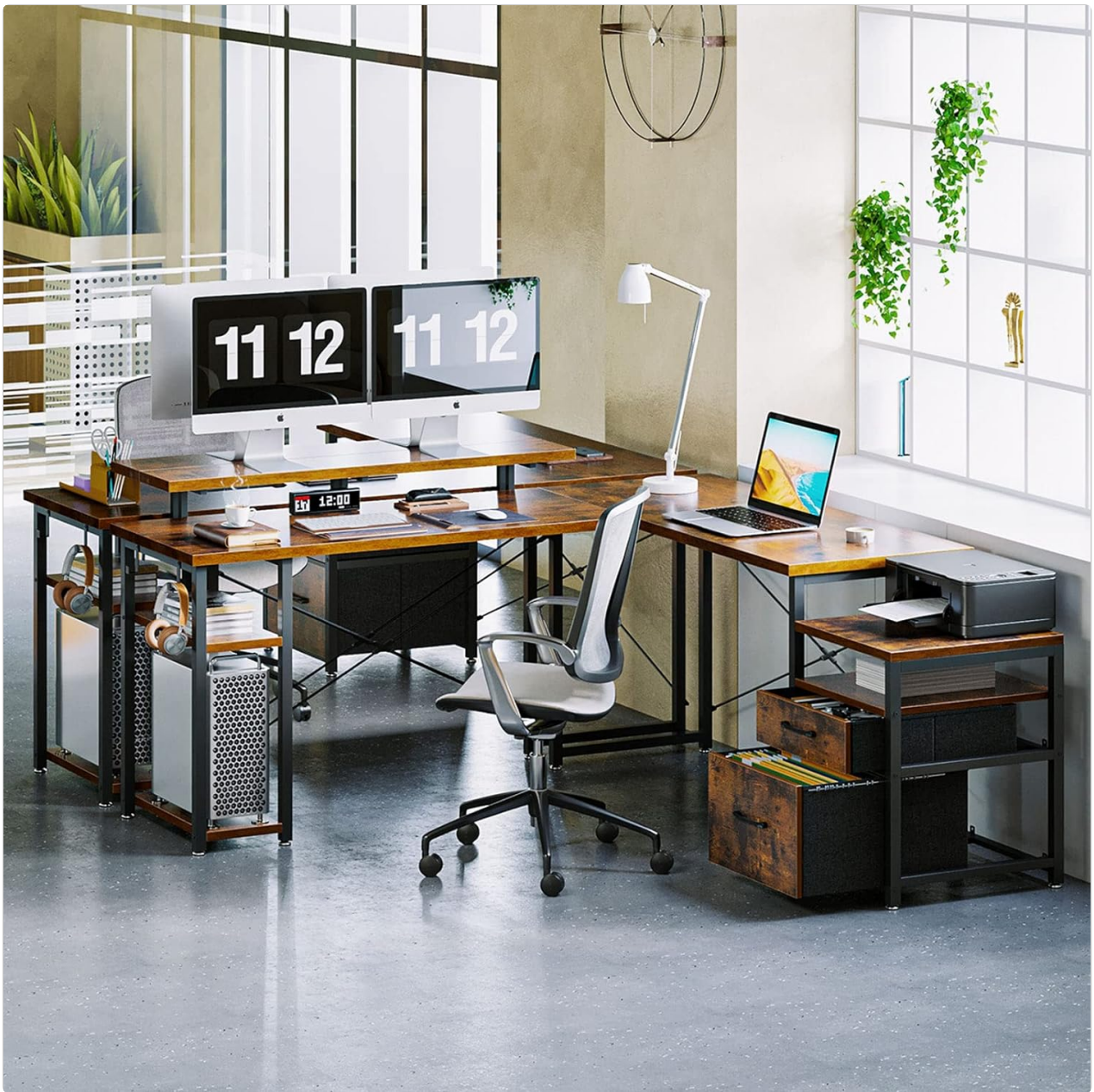
Figure 1: Fully assembled ODK L Shaped Desk with integrated storage and monitor stand.