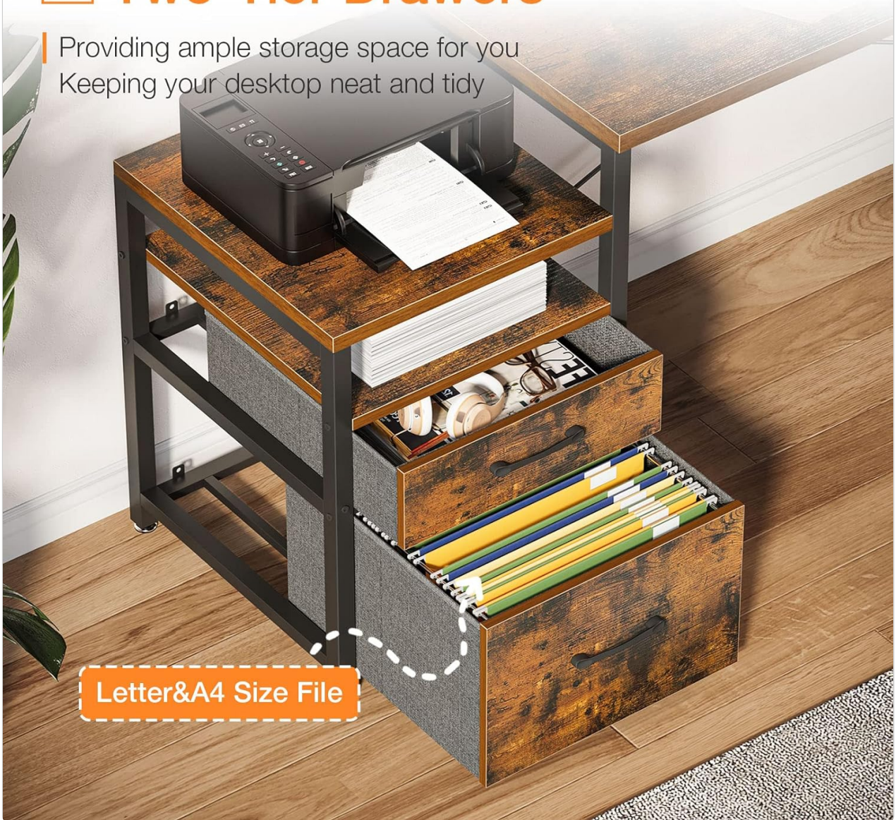
Figure 5: Two-tier drawers for organized storage.

Providing ample storage space for you Keeping your desktop neat and tidy