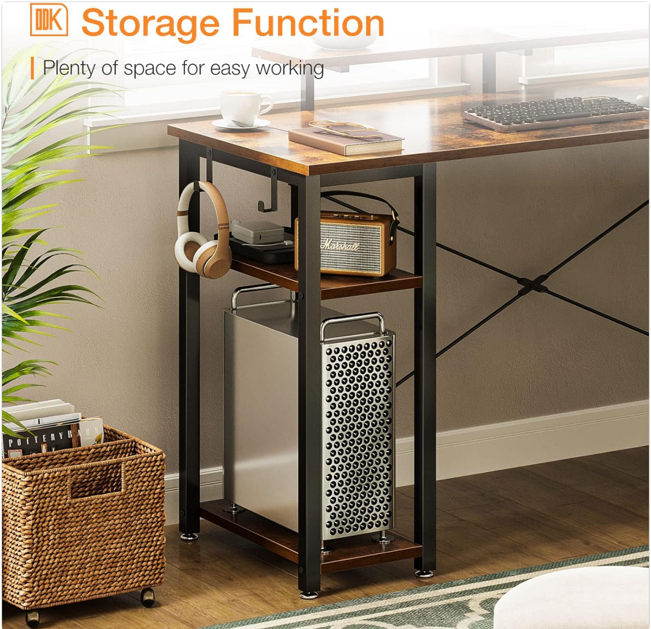
Figure 6: Integrated storage shelves and headphone hook.