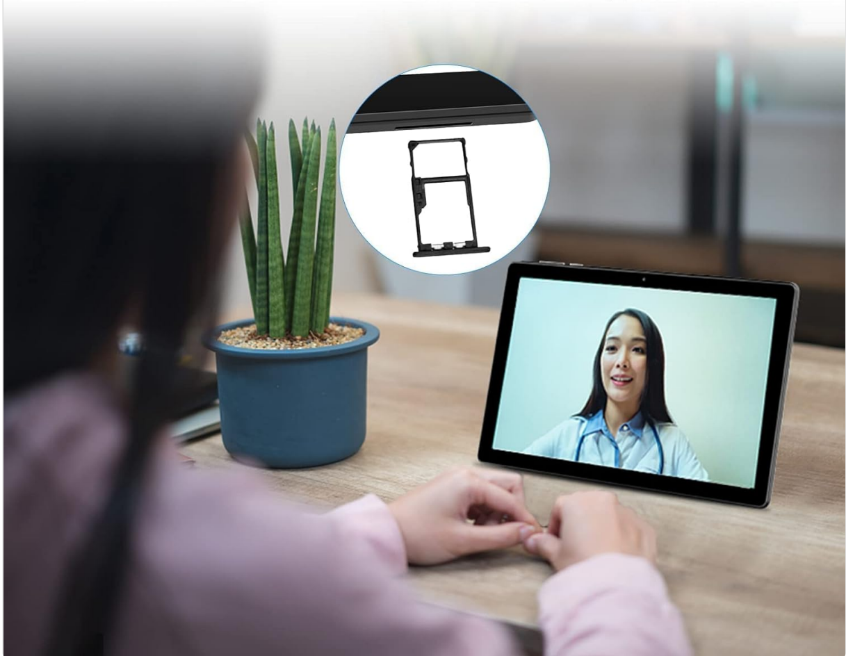
Image: The tablet being used for a video call, demonstrating its camera capabilities.