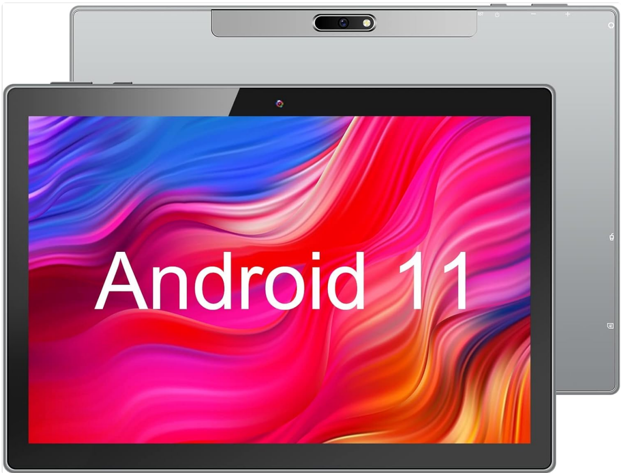
Image: The MARVUE Pad M11 tablet, showcasing its display with "Android 11" text.