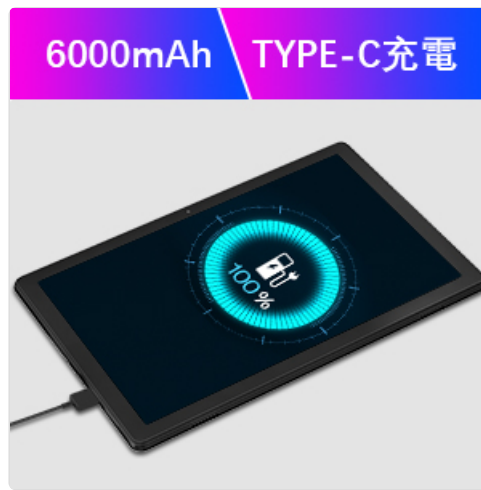
Image: The tablet being charged via its Type-C port, indicating a full battery.