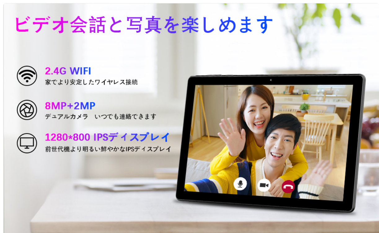
Image: The tablet displaying a video call, emphasizing stable 2.4G Wi-Fi connectivity.