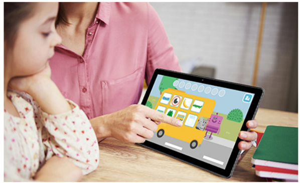
Image: Users engaging with the tablet for various activities like online shopping and educational content.