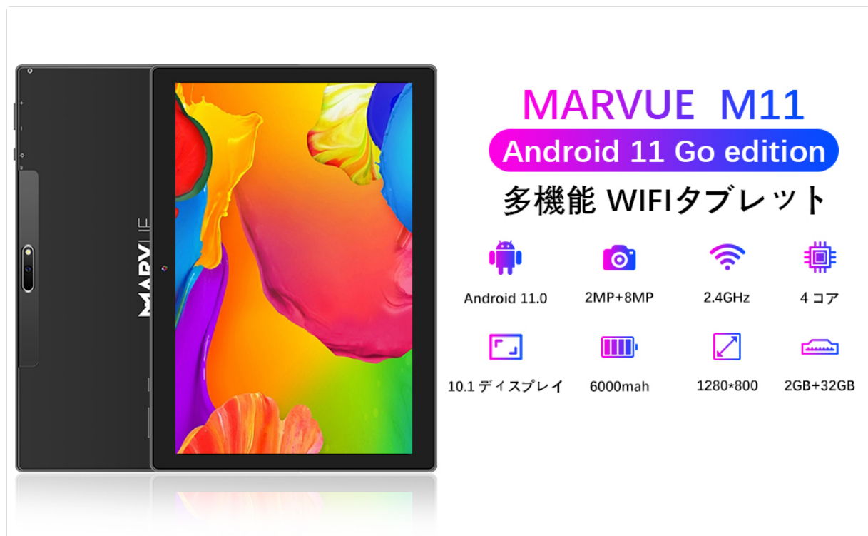
Image: An overview of the MARVUE M11 tablet's key features and specifications.