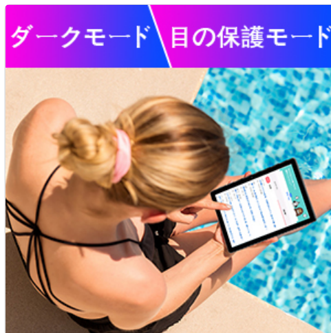
Image: The tablet in use, highlighting features like Dark Mode and Eye Protection Mode.