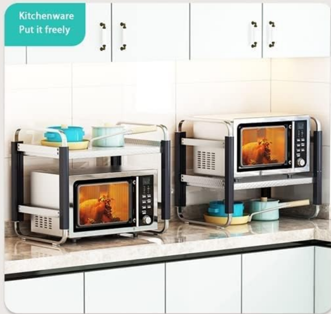
Image highlighting the adjustable height feature of the shelf, showing how the upper layer can be moved up or down.