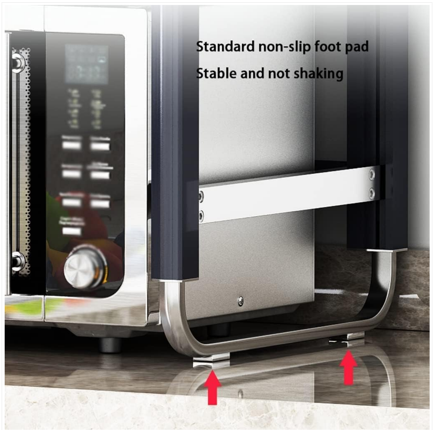
Image detailing the standard non-slip foot pads at the base of the shelf, designed for stability.