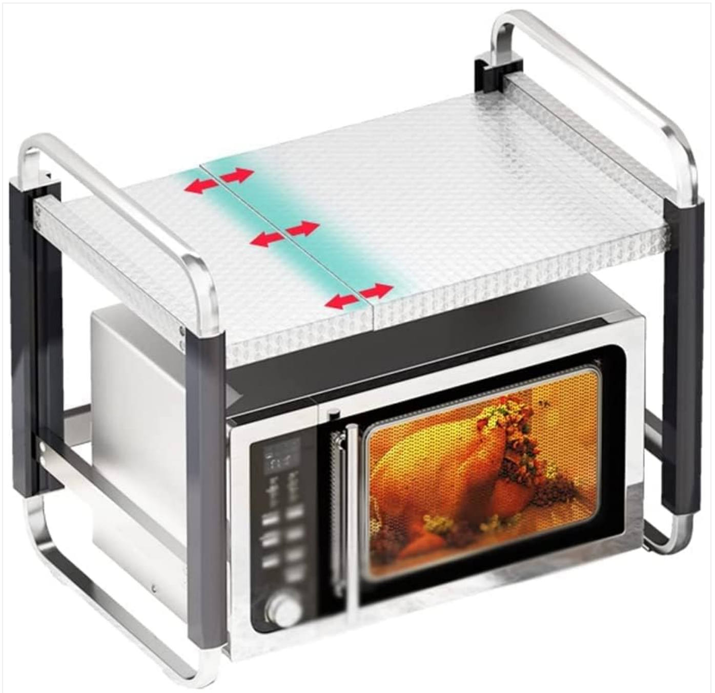
Close-up view of the retractable mechanism, showing the thickened double-row telescopic rods for stability.