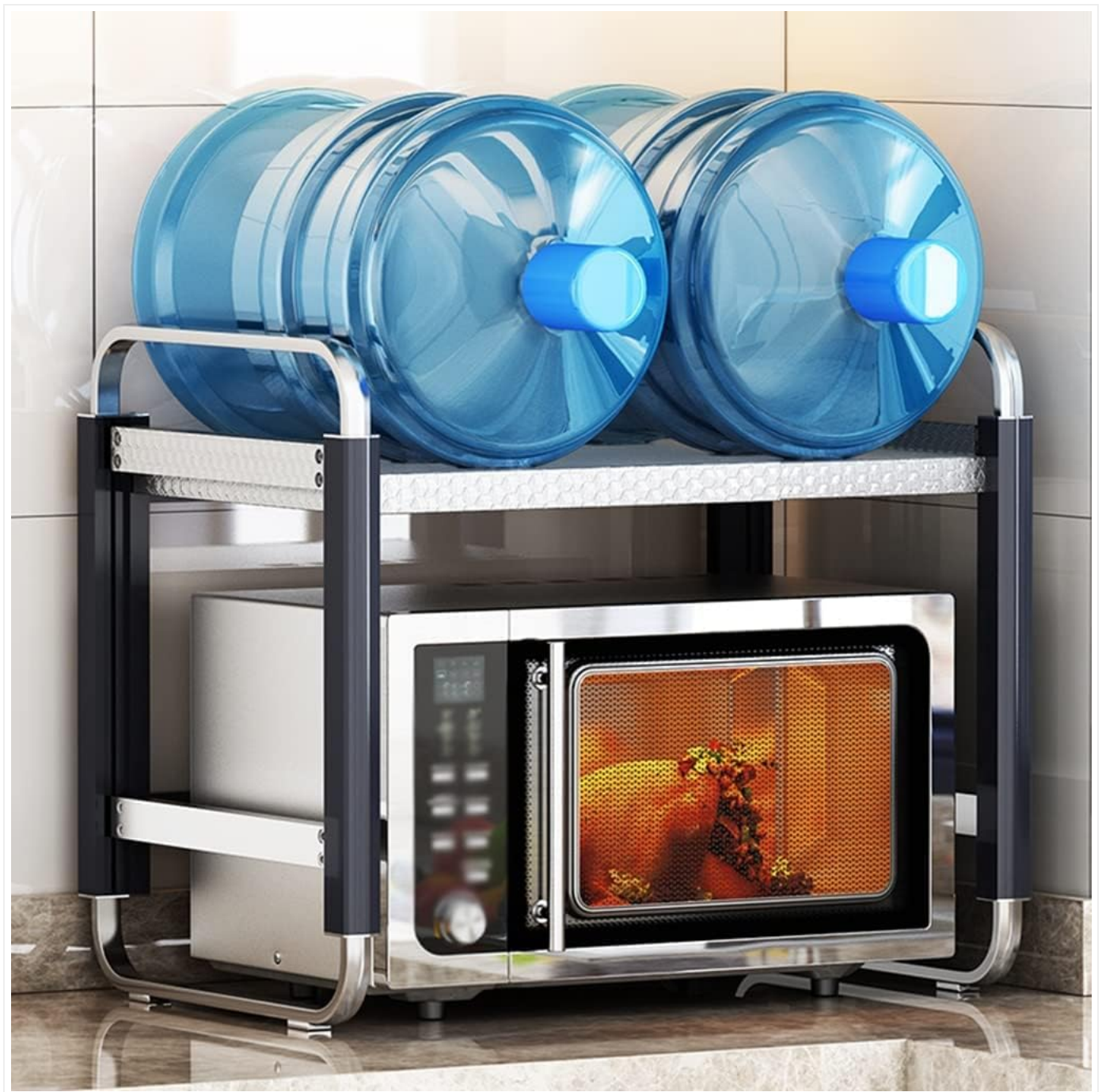
Image showing the OLOTU Adjustable Microwave Shelf in use, holding a microwave oven and water bottles.