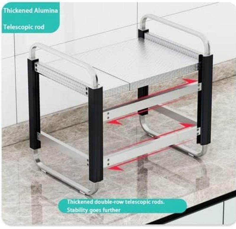
Image demonstrating the retractable inner and total length of the shelf, with measurements.

The total length is retractable: 45-65cm/17.7-25.6 inches