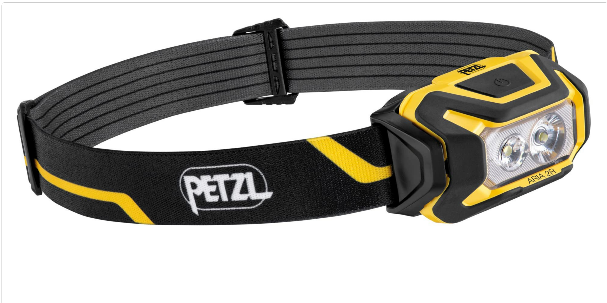
Figure 1: PETZL ARIA 2R Headlamp, showcasing its black and yellow design with an adjustable headband.

The PETZL ARIA 2R is a compact, waterproof, and durable headlamp designed for professionals and frequent use. Featuring a powerful 600 lumen output, it offers mixed beam versatility for both proximity work and long-range vision. This headlamp is powered by a rechargeable Petzl CORE Lithium-Ion battery and is also compatible with 3 AAA batteries, providing flexible power options. Its robust construction ensures reliability in demanding environments.