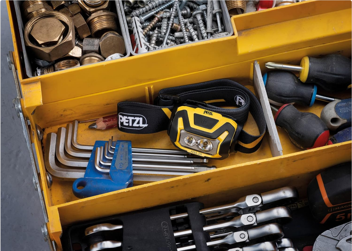
Figure 2: The headlamp can be stored compactly, indicating its suitability for various environments and easy battery access.

The ARIA 2R headlamp is designed with a HYBRID CONCEPT, allowing it to operate with either the included Petzl CORE rechargeable battery or three standard AAA/LR03 batteries. To install or replace batteries, open the battery compartment located at the rear of the headlamp. Insert the CORE battery or AAA batteries according to the polarity indicators. Ensure the compartment is securely closed to maintain water resistance.