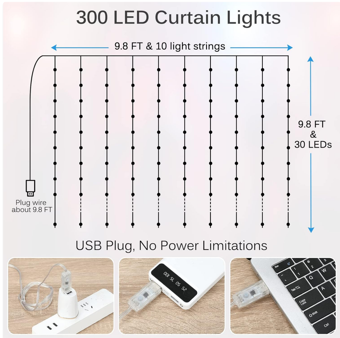
Image: The USB plug connected to various power sources like a wall adapter, power bank, and laptop.