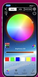
Image: The IR remote control and a smartphone displaying the control app interface.