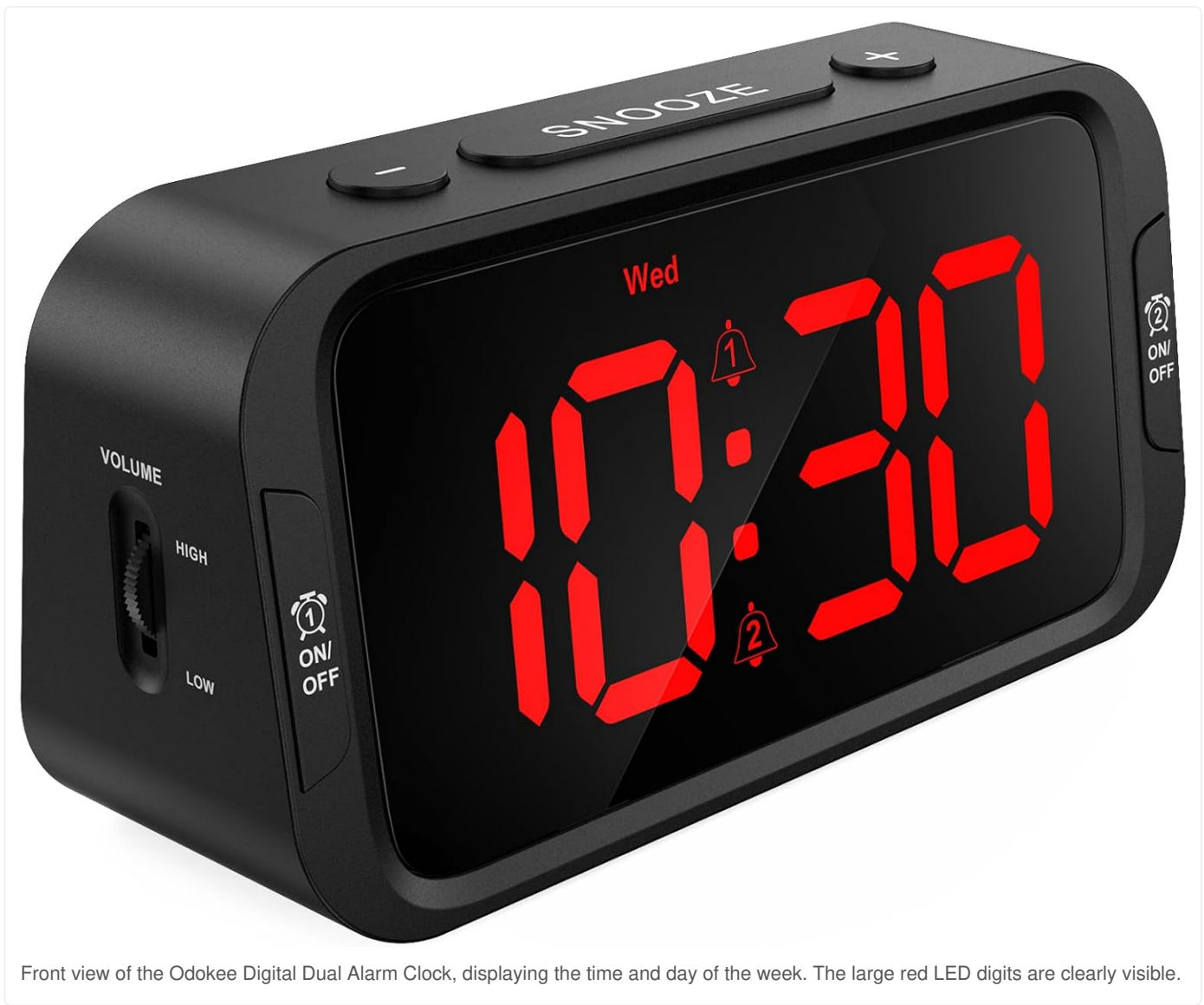
Front view of the Odokee Digital Dual Alarm Clock, displaying the time and day of the week. The large red LED digits are clearly visible.