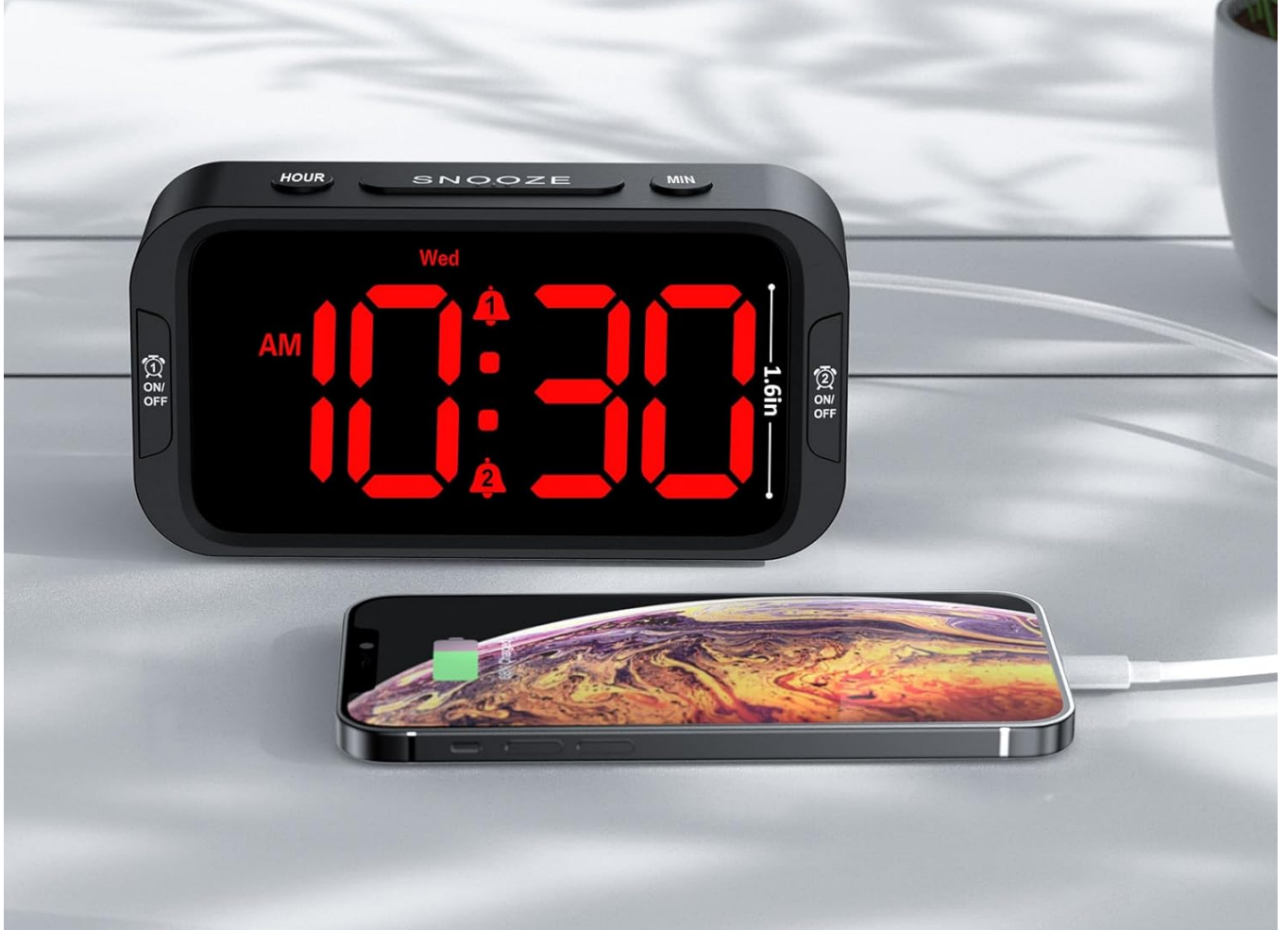
The alarm clock charging a smartphone via its integrated USB port.

Easy to read numbers without glasses & USB Port for charging device without plugging in the wall