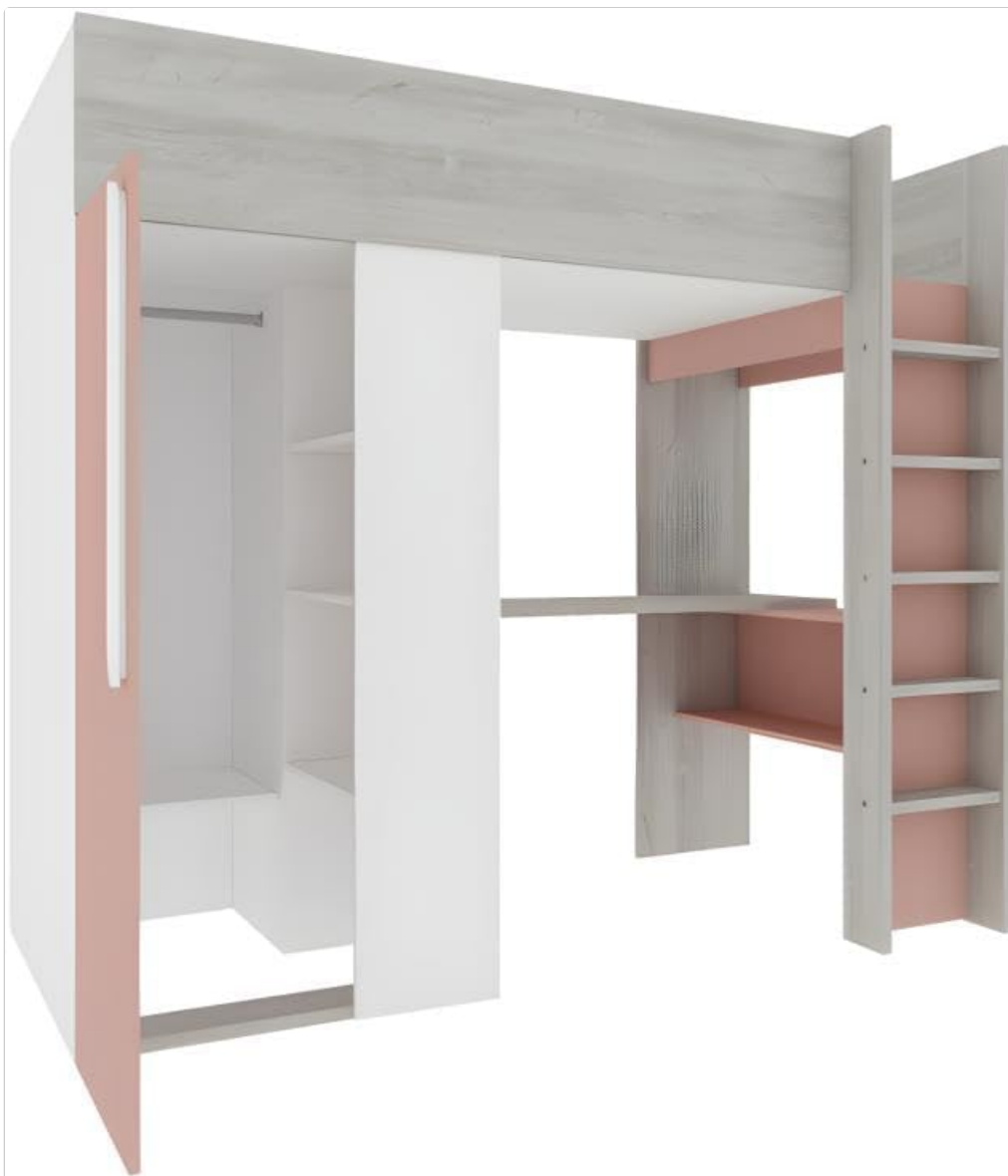
Image 4: Interior view of the wardrobe, showing the hanging space and shelves.