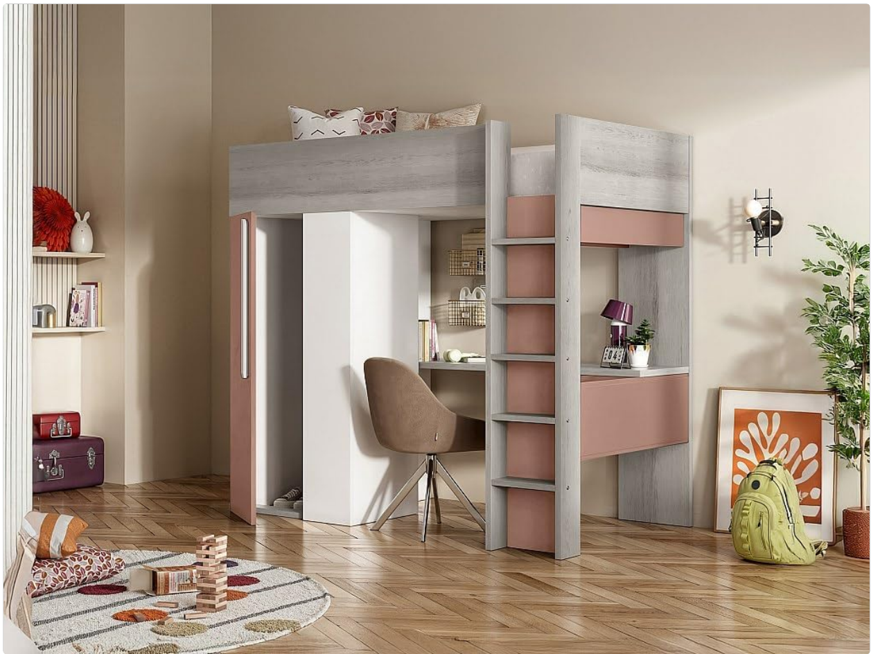
Image 5: The NICOLAS Loft Bed integrated into a room, showcasing its functional design.