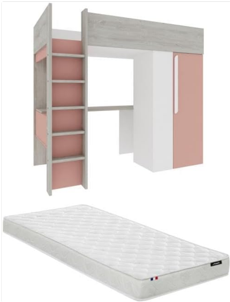
Image 6: The ZEUS Classic Mattress, included with the NICOLAS Loft Bed.