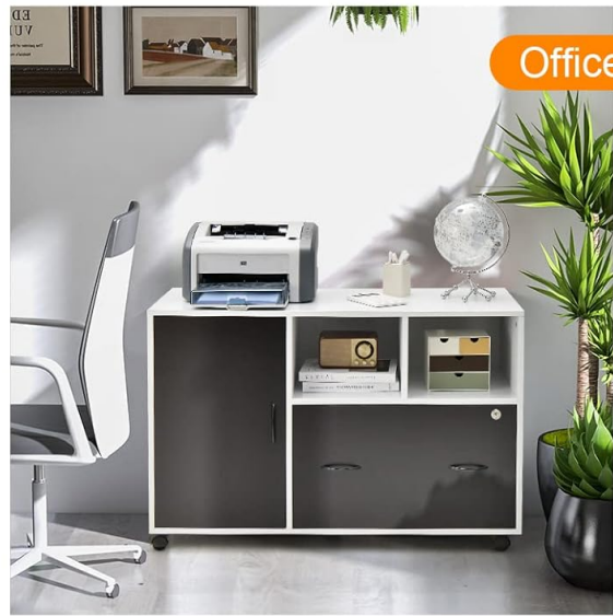
Image: A collage of images illustrating the file cabinet's versatile use in different settings, including a study room, a living room, and an office environment.