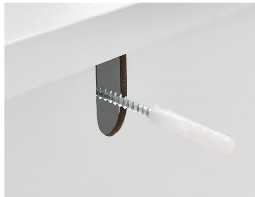
2 Anti-Topping Devices