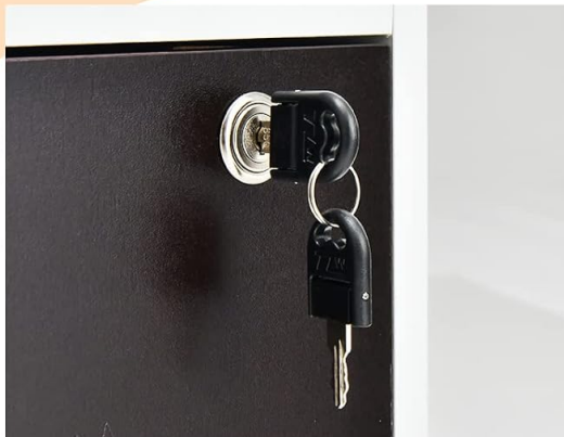
Drawer with Safety Lock & Keys