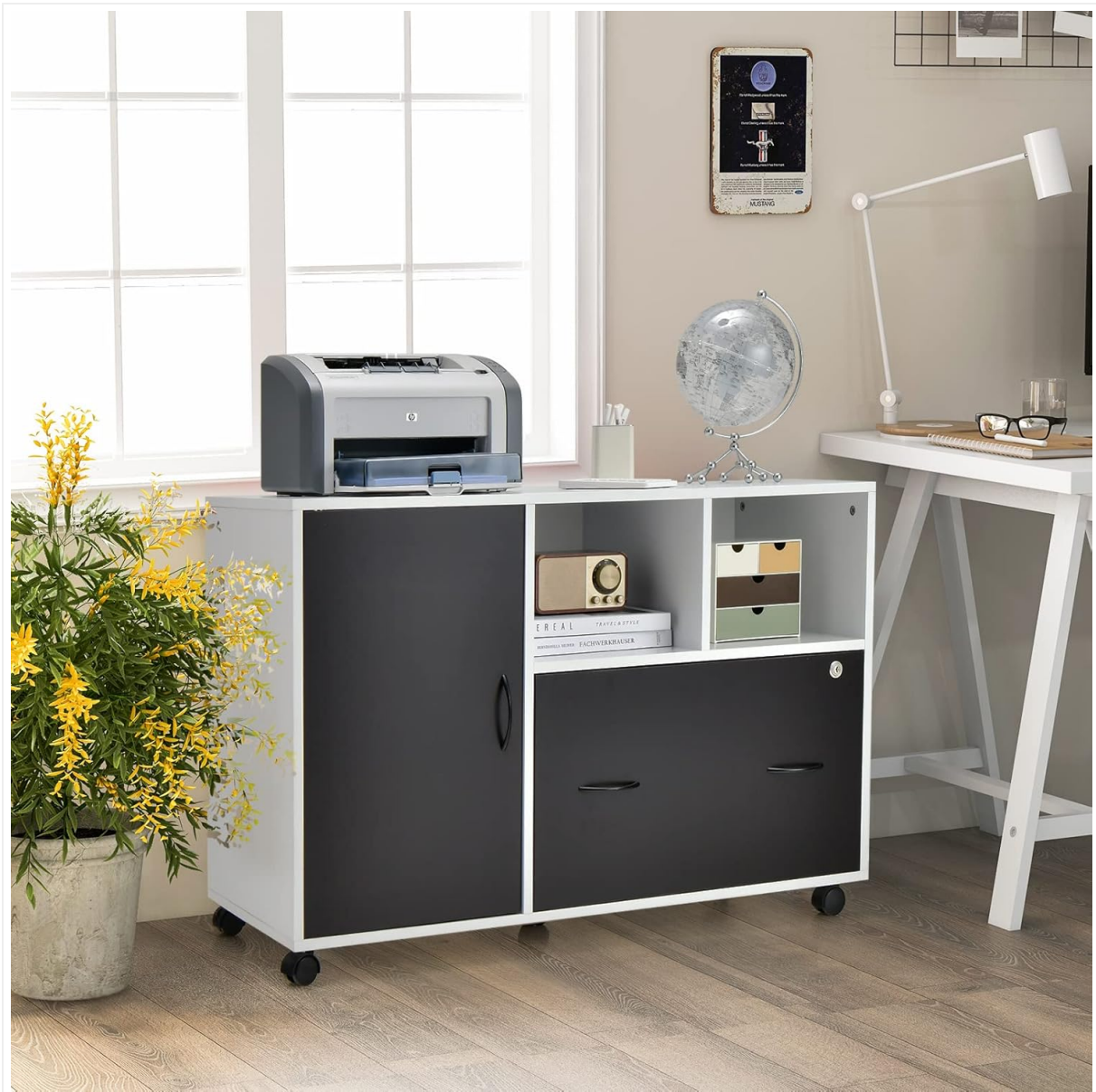
Image: The file drawer shown with adjustable hanging bars, demonstrating its capacity for Letter, Legal, and A4 size files, and highlighting the smooth drawer slides for easy access.