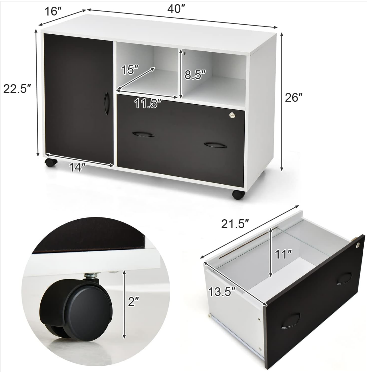
Image: A detailed diagram illustrating the key dimensions of the file cabinet, including its overall length (40"), depth (16"), height (26"), and the internal measurements of the drawer and open shelves.