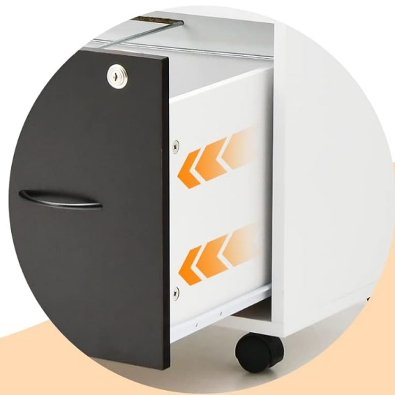
Image: Illustration of the five universal wheels, highlighting their 360-degree swivel capability, the central anti-tipping wheel for enhanced stability, and the two lockable wheels for securing the cabinet in place.