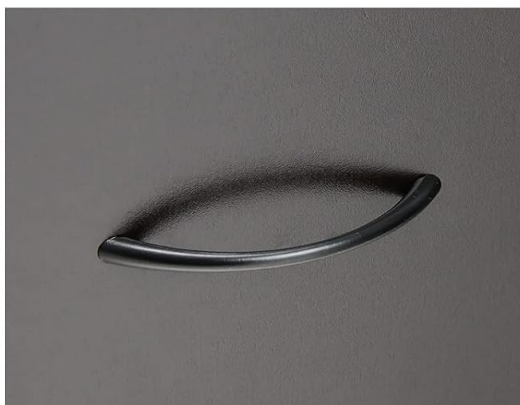
Convenient Metal Handle