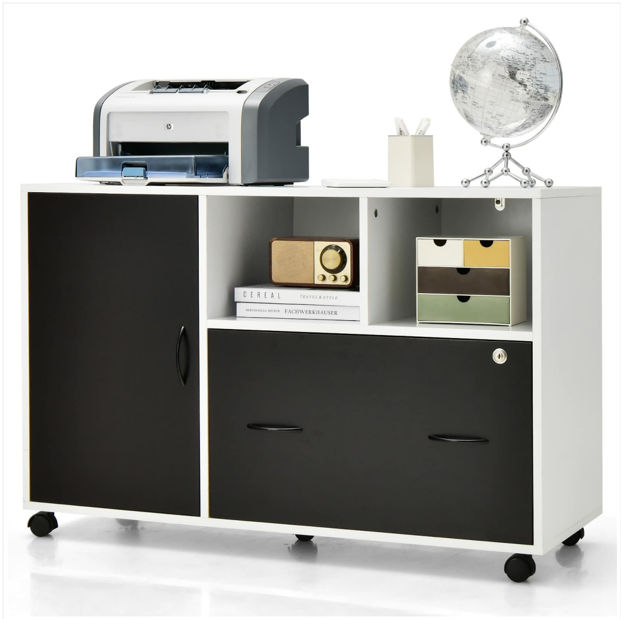
Image: The Giantex Mobile File Cabinet, showcasing its white and dark brown design with a curved knob, a spacious top surface, open shelves, a single door cabinet, and a lockable file drawer.